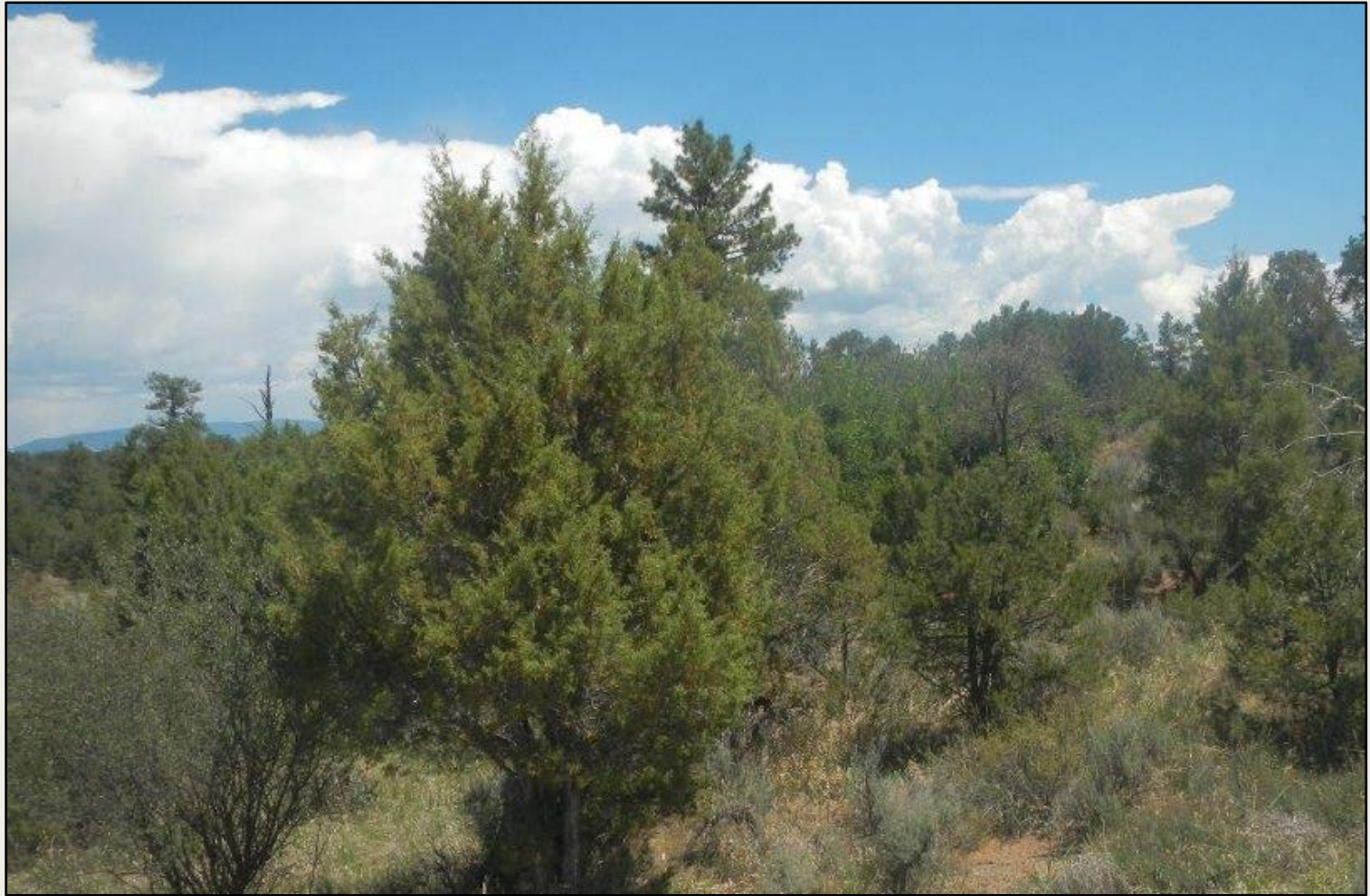
Photo 6. View of reference area comprised of pinyon and juniper woodland with understory of antelope bitterbrush, big sagebrush, James galleta, and penstemon.