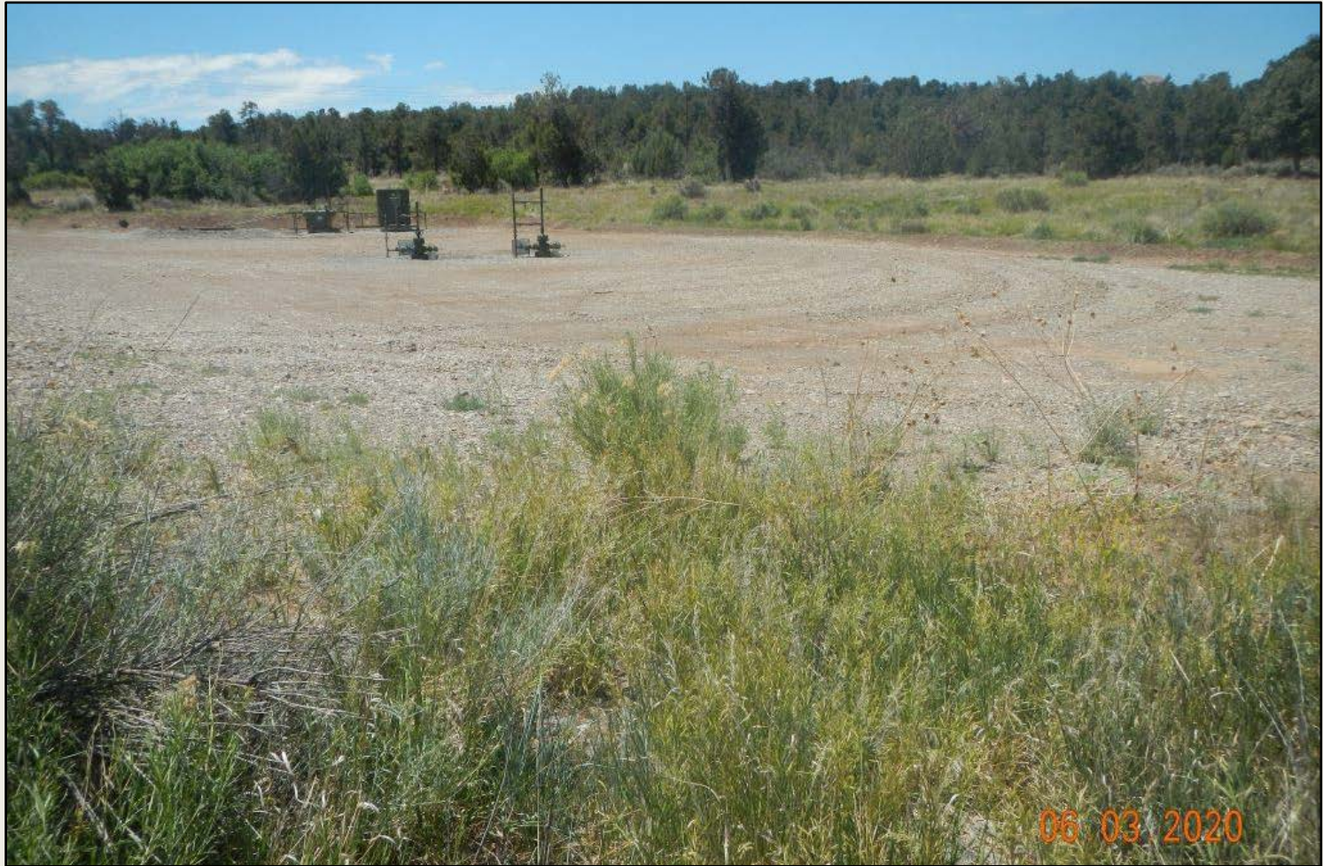
Photo 1. View of the project area from the northeastern corner facing center.