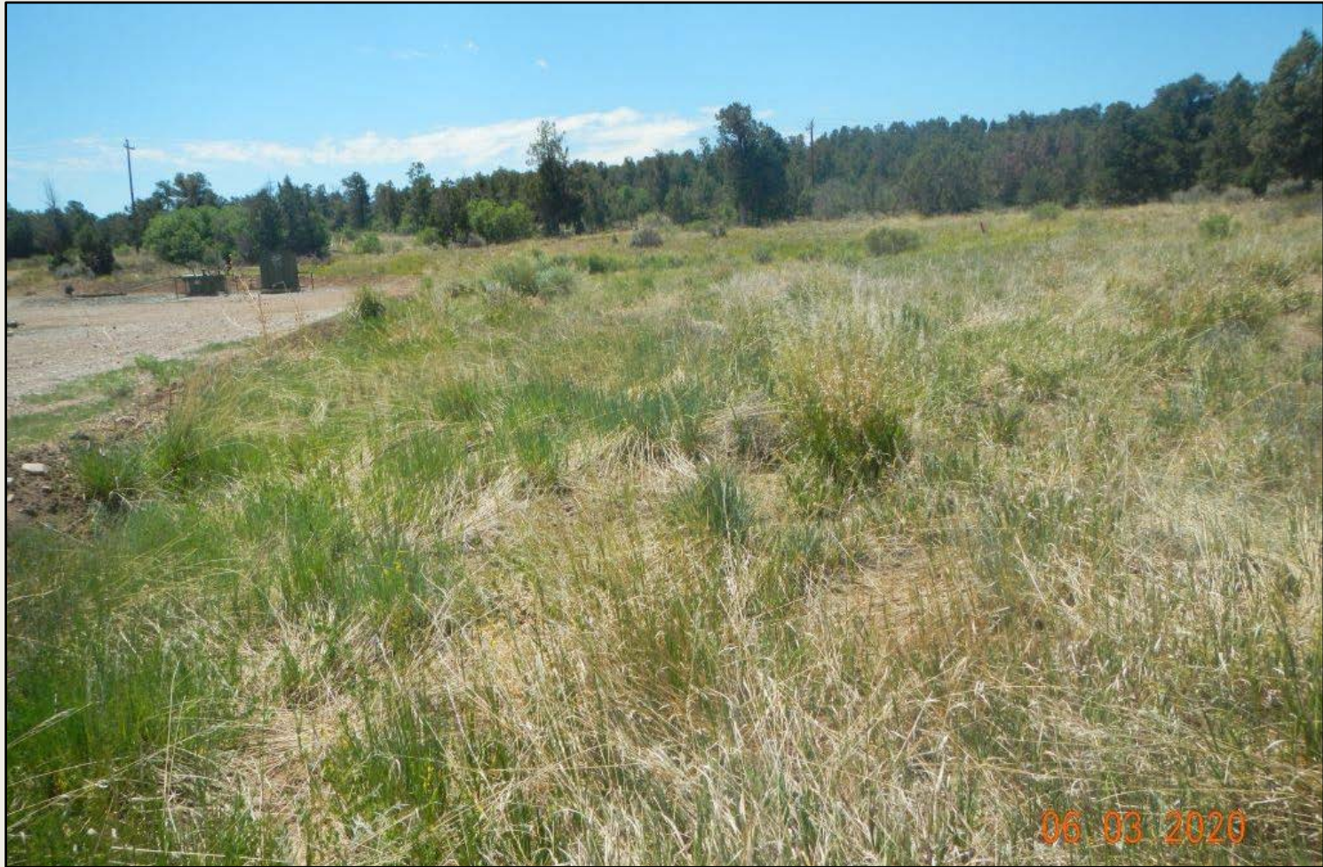
Photos 4. View of the western project area from the northwestern corner facing southward.