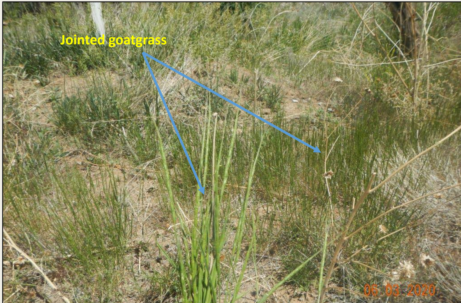
Photos 3. View of jointed goatgrass within the northern project area. Approximately 2000 individuals observed.