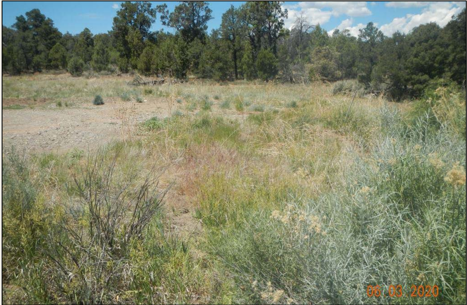
Photo 2. View of the northern fill slope from the northeastern corner facing westward. Revegetation is progressing in portions with western wheatgrass and smooth brome. However weed infestations (described below) are threatening successful revegetation.