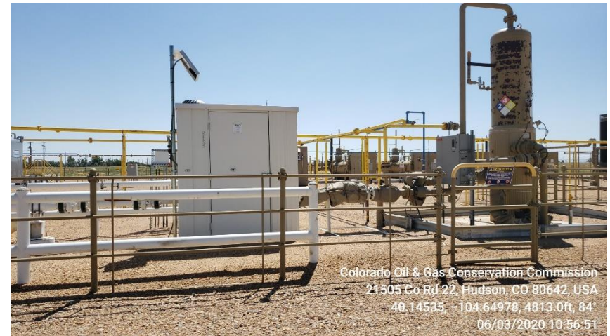
Photo 10 Gas Meter Run and Vertical separator