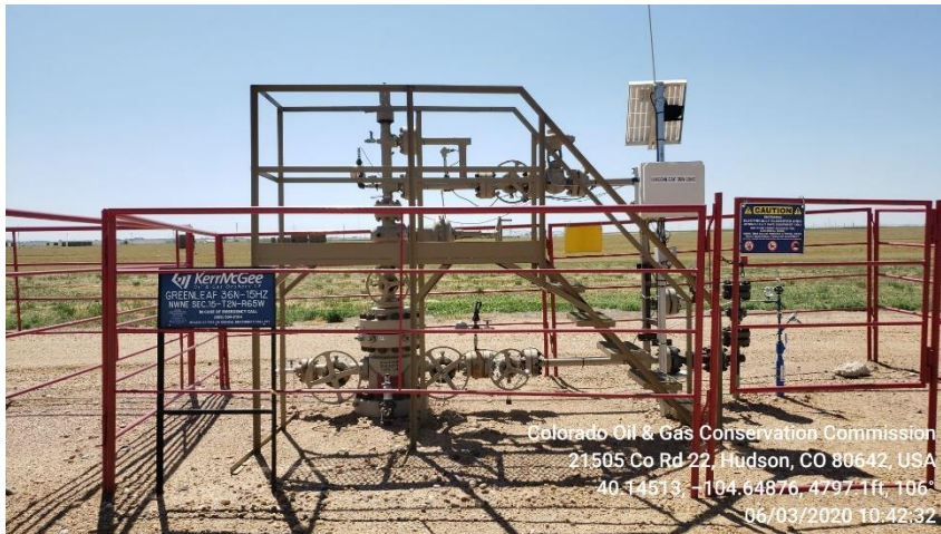
Photo 5 WH/sign