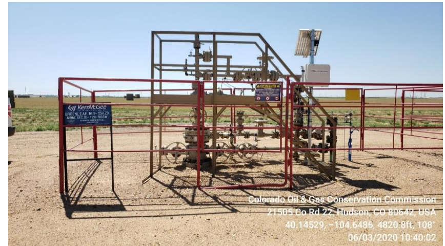
Photo 2 WH/sign