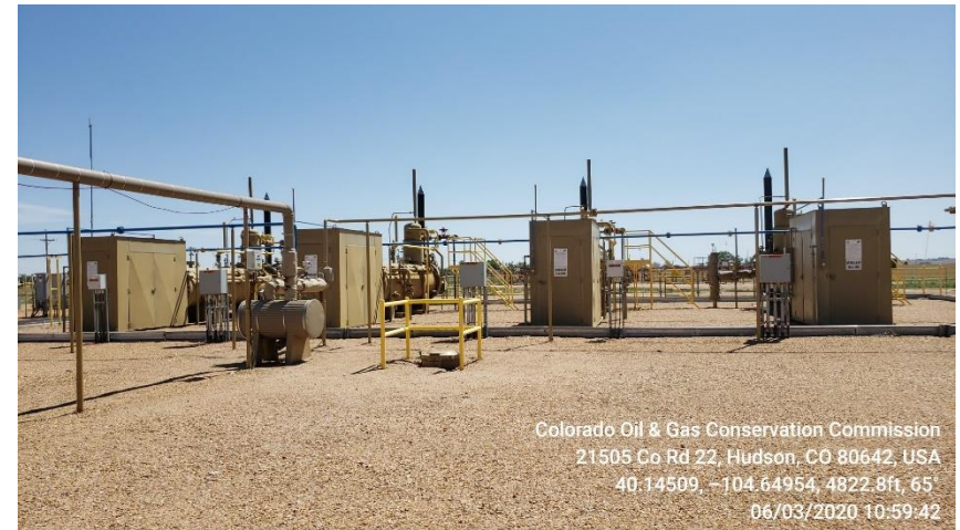
Photo 14 Horizontal Heated Separators