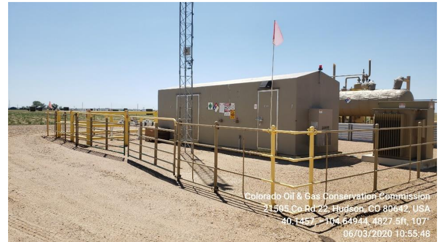
Photo 8 LACT