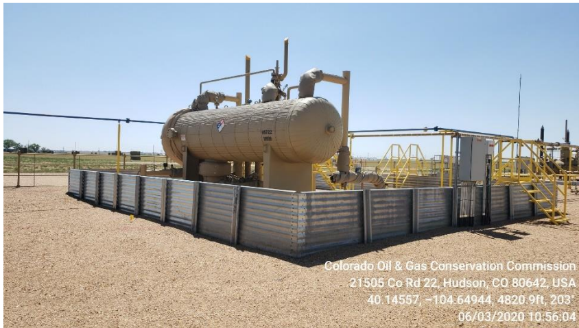
Photo 9 FWKO