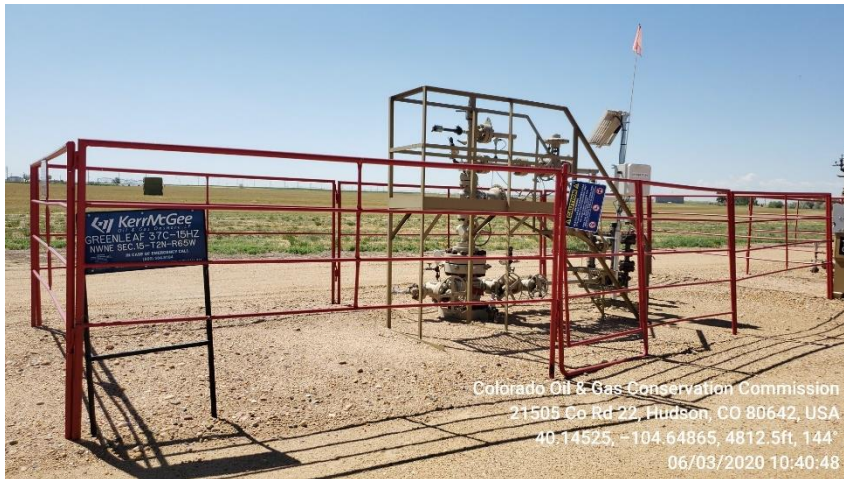
Photo 3 WH/sign