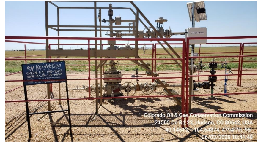
Photo 4 WH/sign