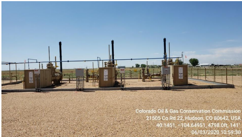
Photo 13 Horizontal Heated Separators