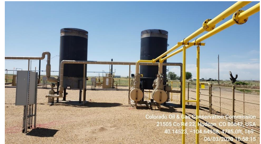
Photo 12 ECDs