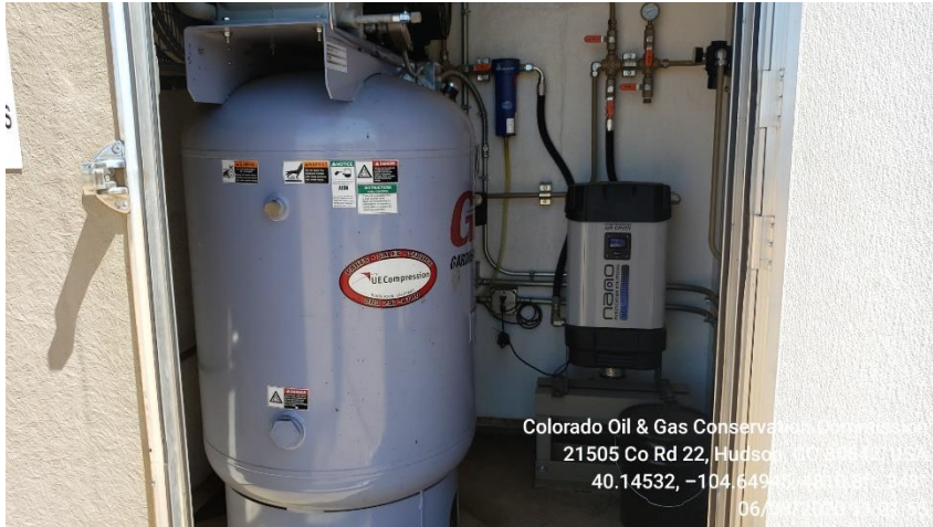
Photo 15 Compressor