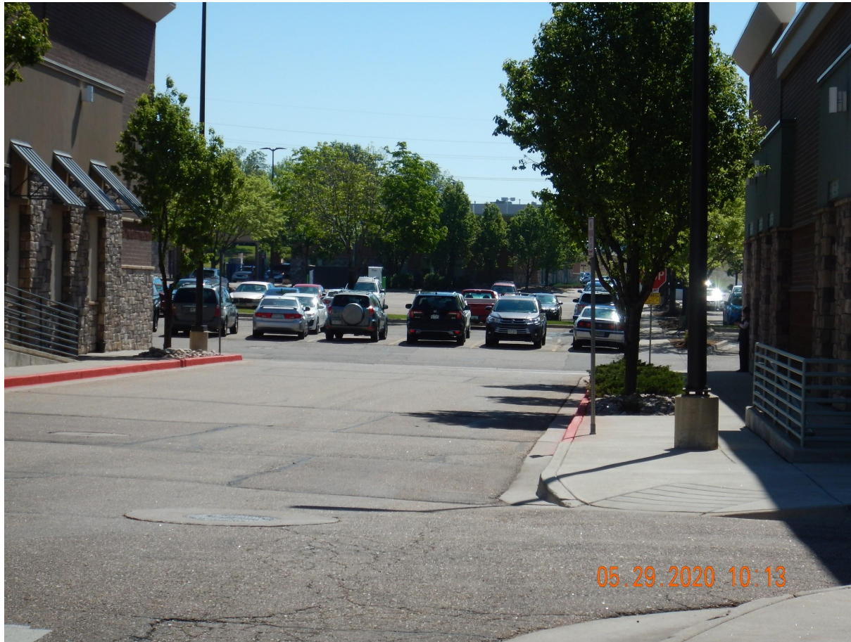
Photo 3. Photo taken from the well location, facing East. Photo illustrates the well location is within the Greeley Shopping Center.