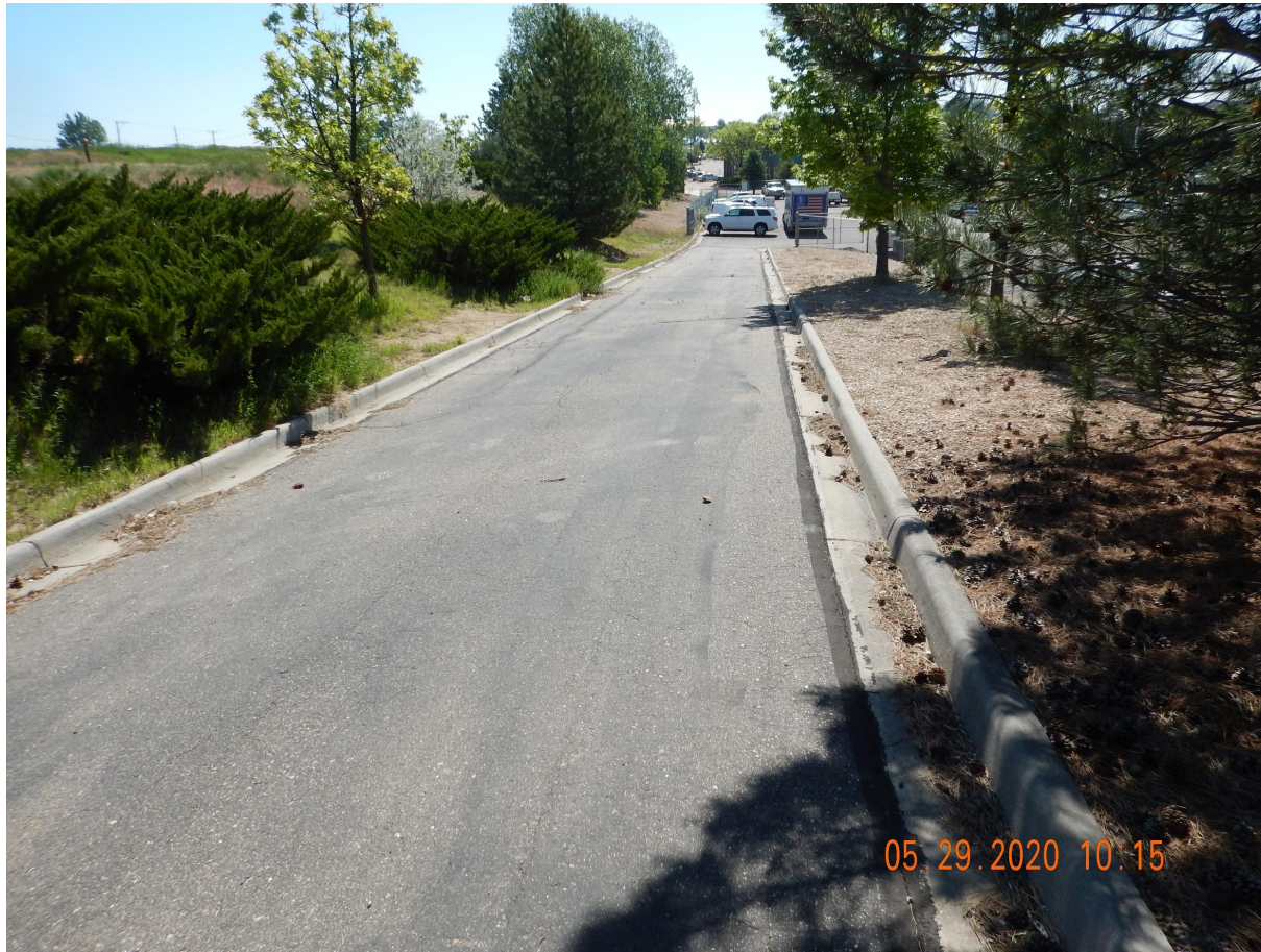
Photo 4. Photo taken from the associated offsite tank battery location, facing East. Photo illustrates the tank battery is within a Spradley Barr Ford parking lot.