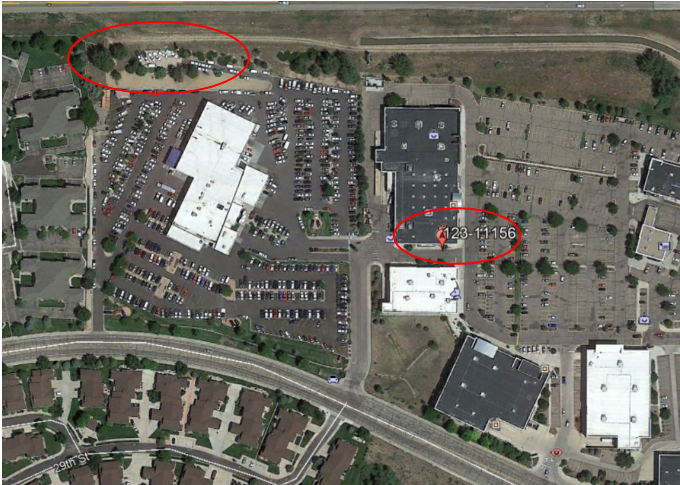
Photo 2. Google Earth aerial imagery taken 7/17/2019. Both the well (Greeley Shopping Center) and associated offsite tank battery (Spradley Barr Ford parking lot) location are within a final land use change.