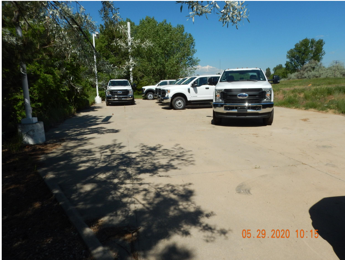
Photo 5. Photo taken from the associated offsite tank battery location, facing West. See comments under Photo 4.