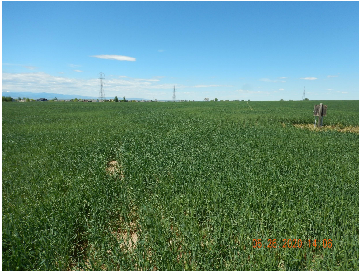
Photo 2. Photo taken from the well location, facing Northwest. Photo illustrates other areas surrounding the well location appear to meet Rule 1004 vegetative standards.