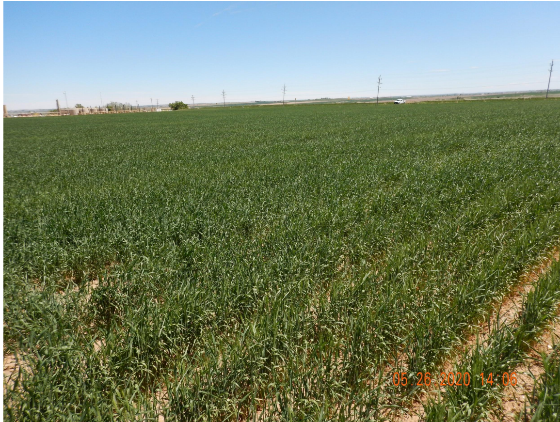
Photo 4. Photo taken from the well location, facing South. Photo illustrates the access road appears reflective of reference crop areas.