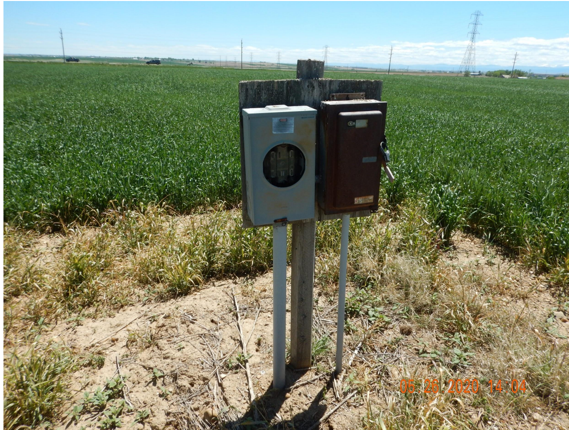
Photo 1. Photo taken from the well location, facing South. Photo illustrates the Operator has failed to remove all equipment.