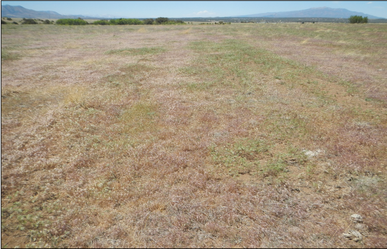
Photo 5. Facing northwest at the Big Pit area. This area consists predominately of undesirable weeds (Cheat grass).