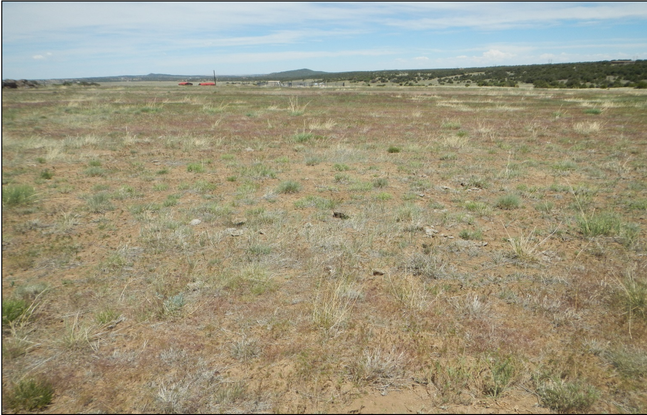
Photo 8. Facing northeast toward the disturbance area northeast of the Big Pit area. This area does not have adequate desirable vegetation establishment and consist of undesirable weeds (Cheat grass).