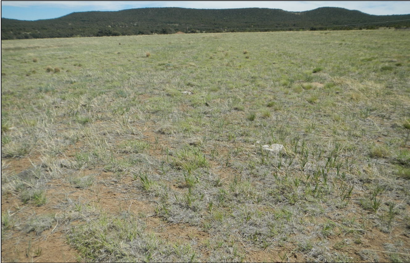
Photo 6. Facing southeast at the west side of the Big Pit area. The vegetation in this reclaimed area is well established and consist of desirable species such as western wheat grass, Blue grama, and Sand dropseed.