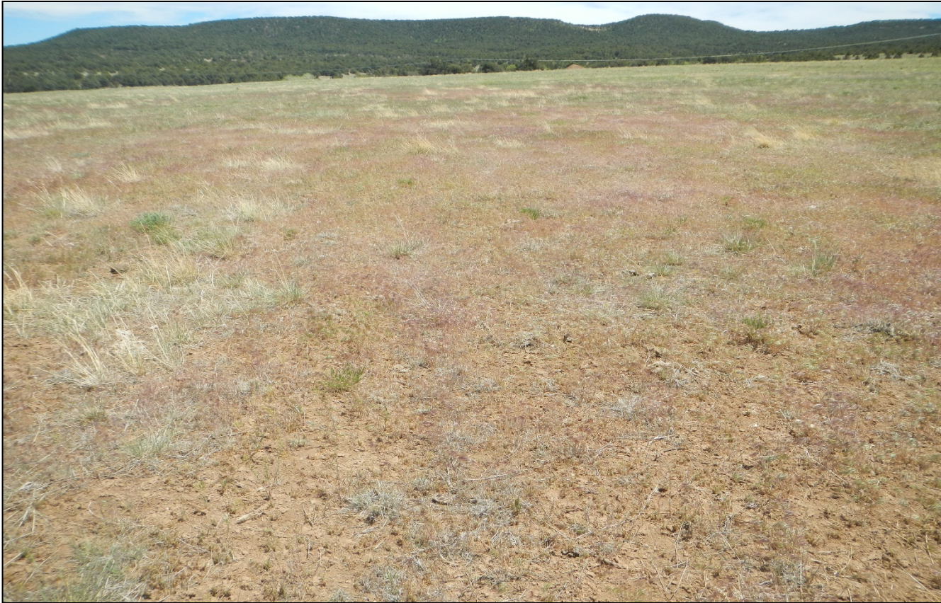
Photo 4. Facing southeast at the Big Pit area. This area consists predominately of undesirable weeds (Cheat grass).