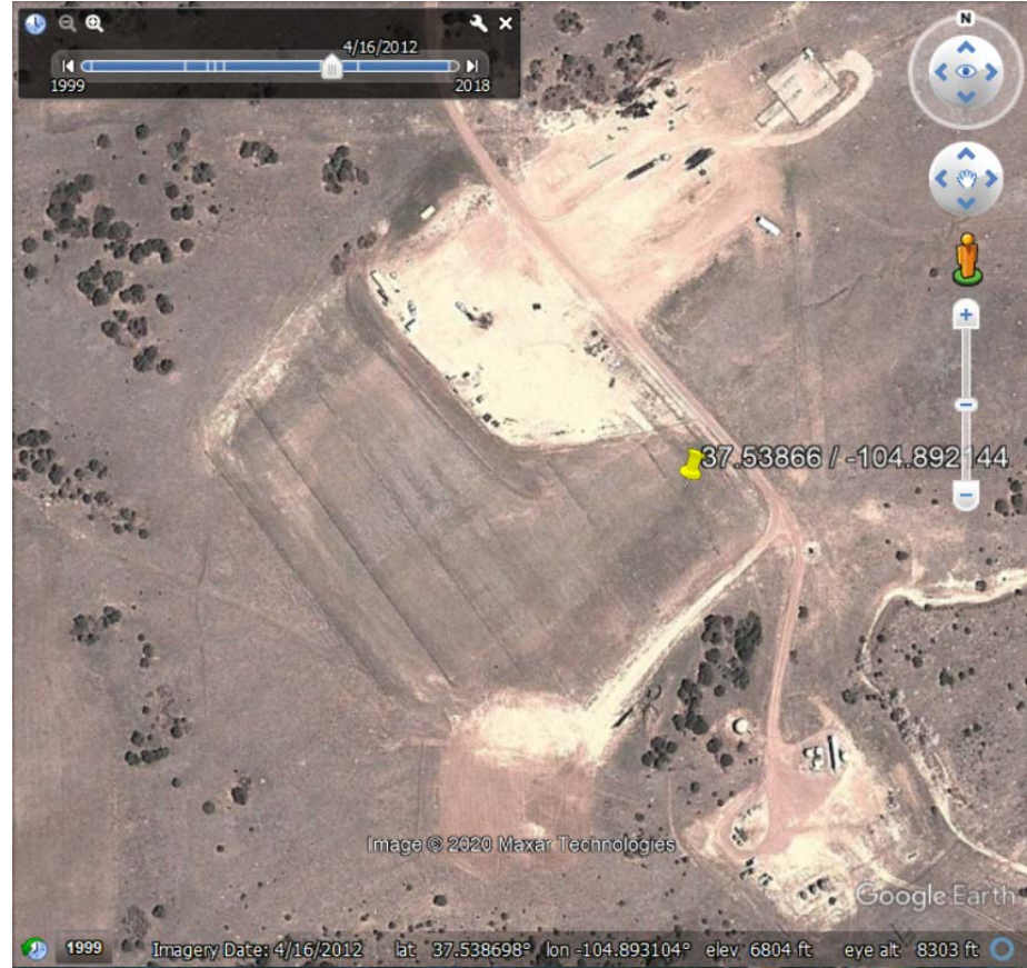
Photo 1. The two aerial images above show the disturbance area of the Rohr 09-10 Big Pit . The image on the left was taken in 2005 and the image on the right taken in 2012 which shows that most of the Big Pit area was reclaimed during that timeframe.