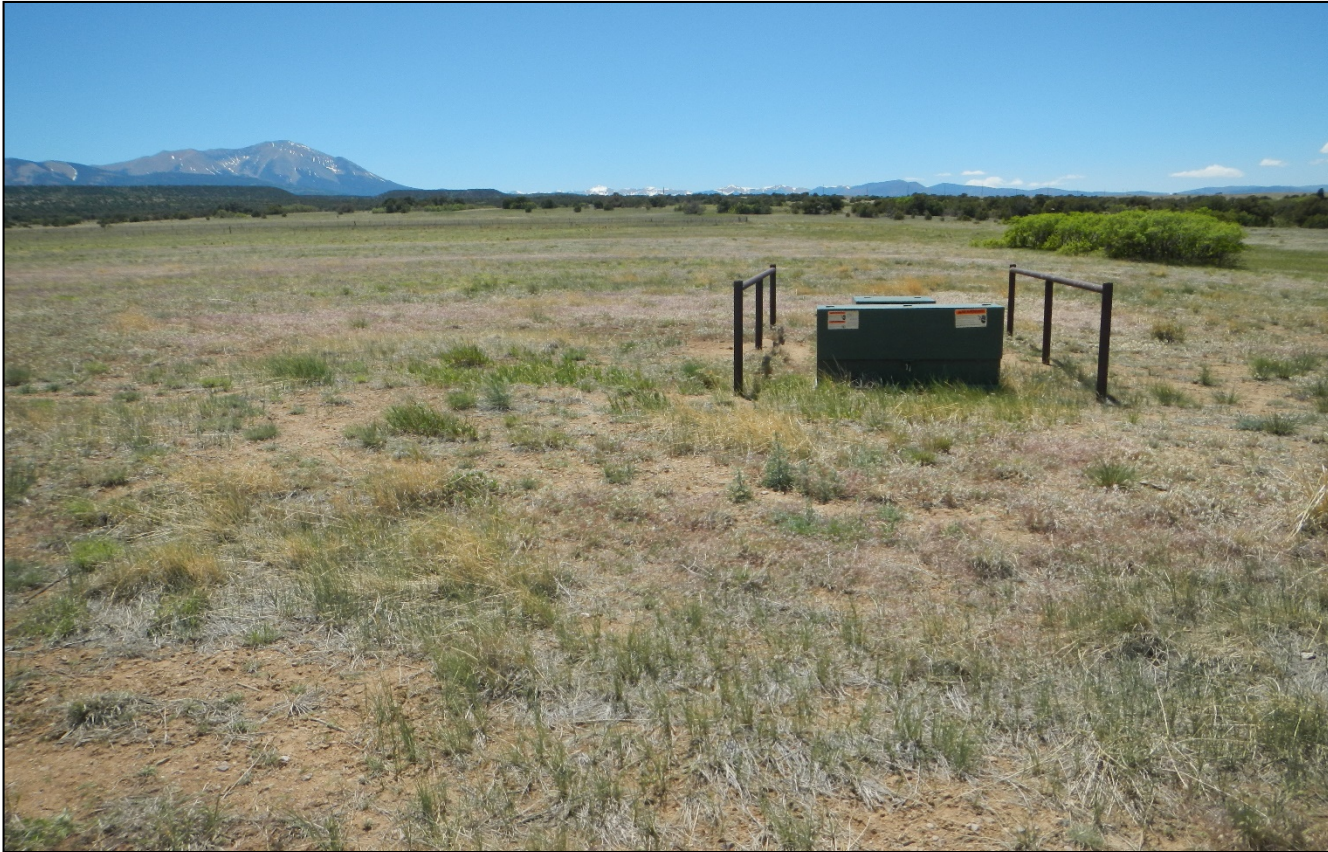
Photo 3. Facing southwest to The electric utility remains at this north side of the location.ward the Rohr 09-10 Big Pit reclaimed disturbance area.