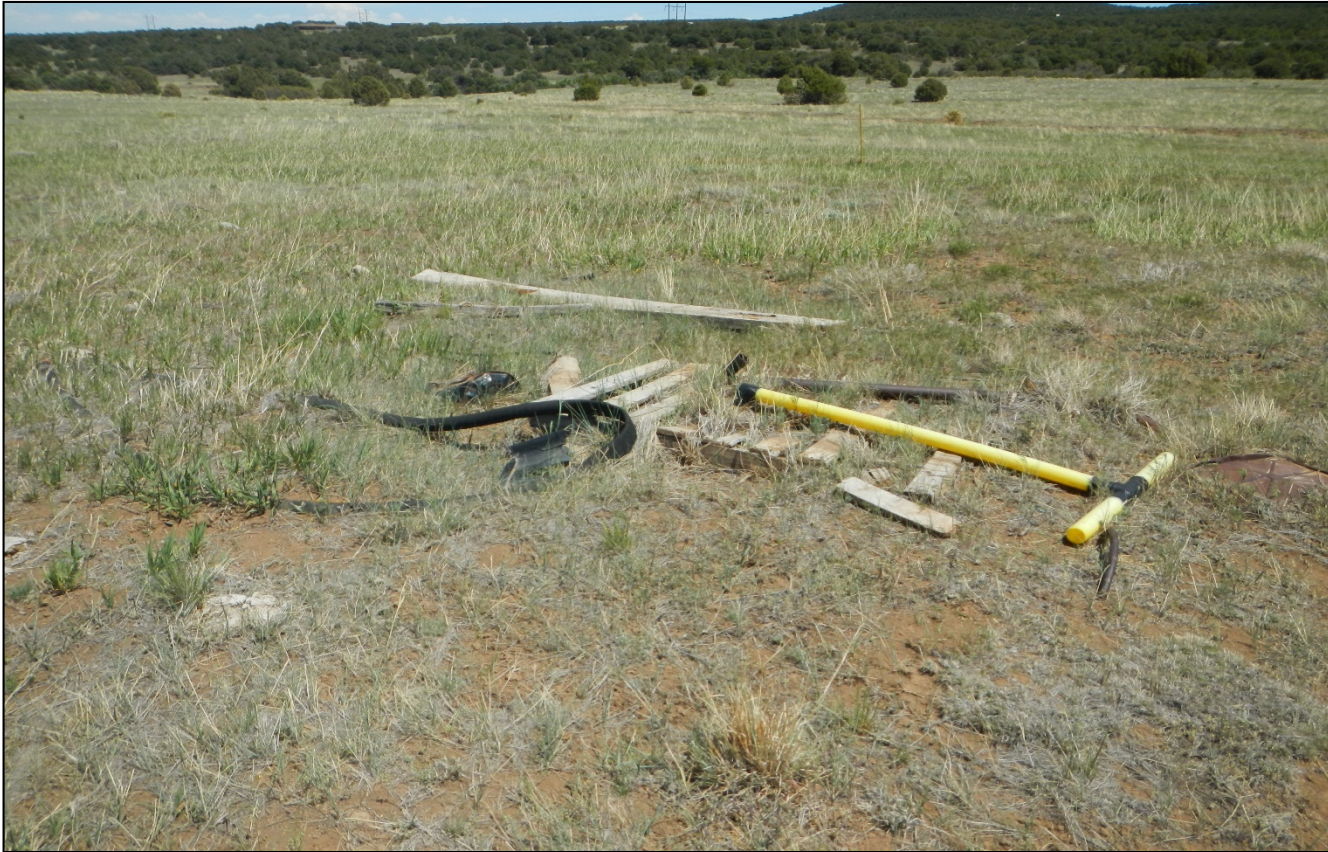
Photo 9. There is various debris that remains at the east side of this disturbance area.