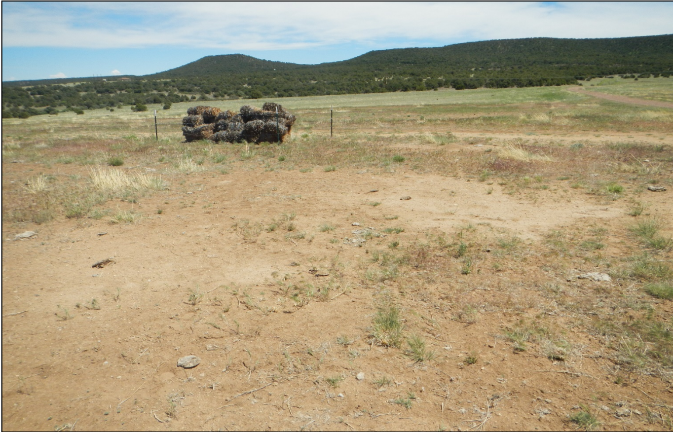
Photo 11. Facing southwest at the disturbance northeast of the Big pit area.