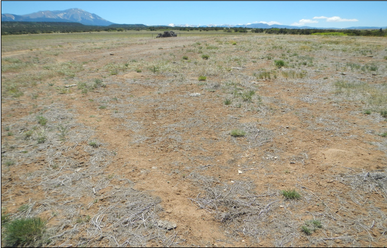
Photo 10. Facing southwest toward the disturbance area northeast of the Big Pit area. This area does not have adequate desirable vegetation establishment and consist of undesirable weeds (Cheat grass).