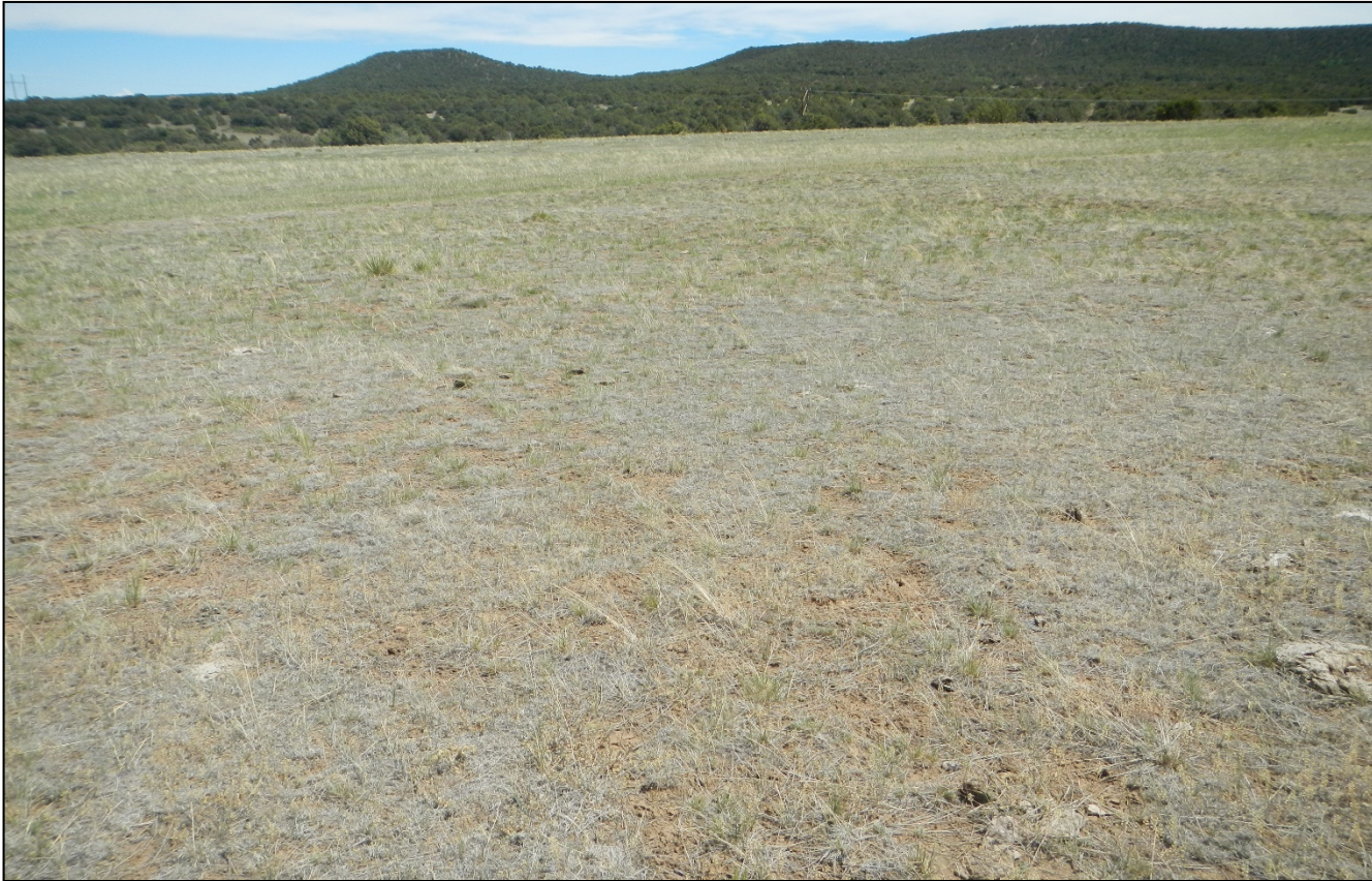
Photo 12. Facing southeast toward the undisturbed area. The vegetation consists of Blue grama, Sand dropseed, Prairiejune grass among other species.