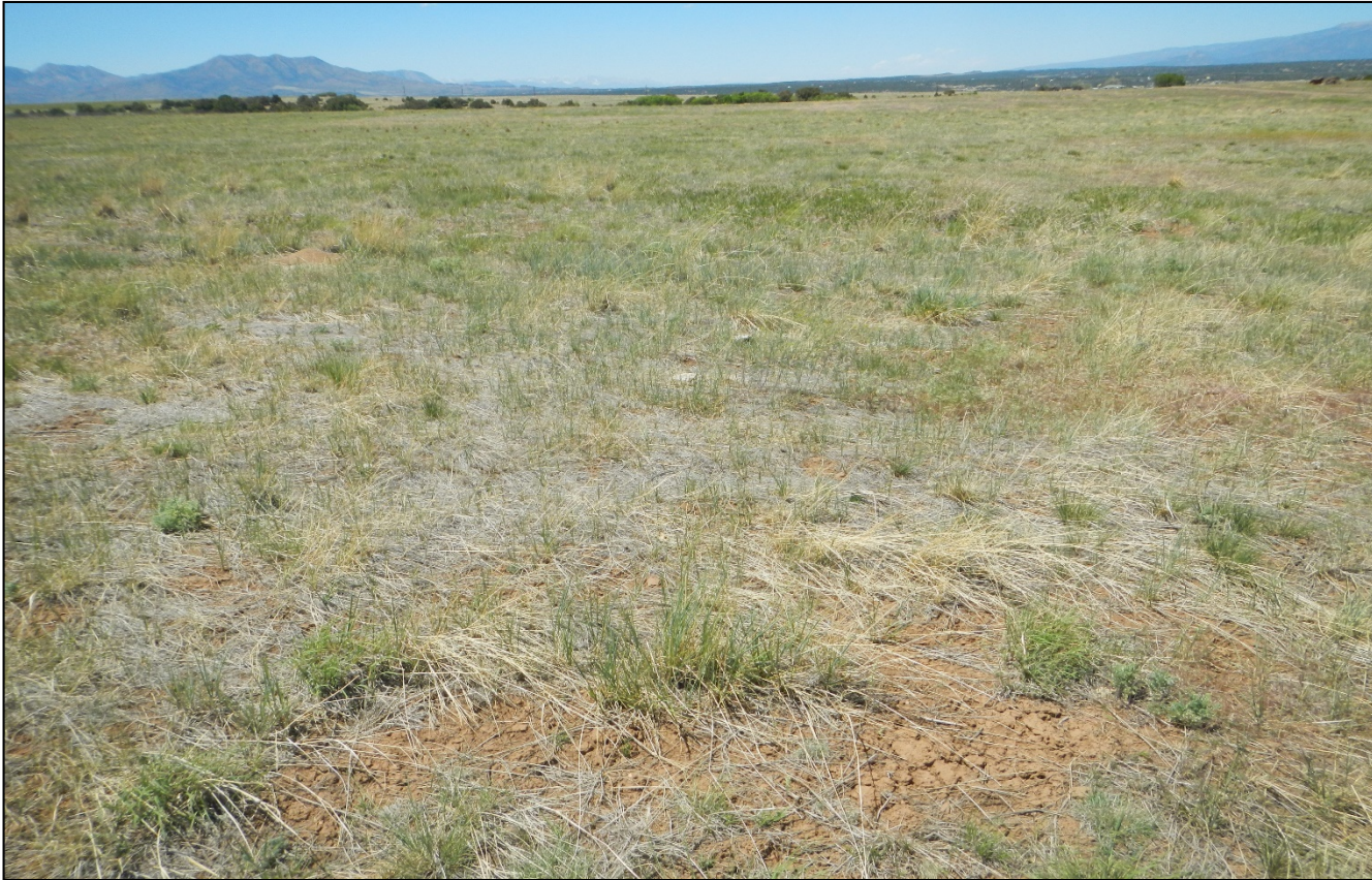
Photo 7. Facing northwest at the south side of the Big Pit area. The vegetation in this reclaimed area is well established and consist of desirable species such as western wheat grass, Blue grama, and Sand dropseed.