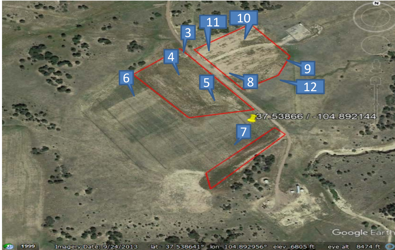
Photo 2. The above aerial image taken in 2013 shows the areas highlighted in red were reclaimed however, these areas have not adequately established desirable vegetation as shown in the following photos. The Blue inserted box corresponded to the following photo location.