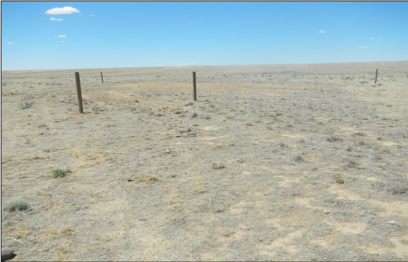
Photo 1. Facing south toward the location. There has been recent reclamation work performed and the location and a fence appears to be installed.