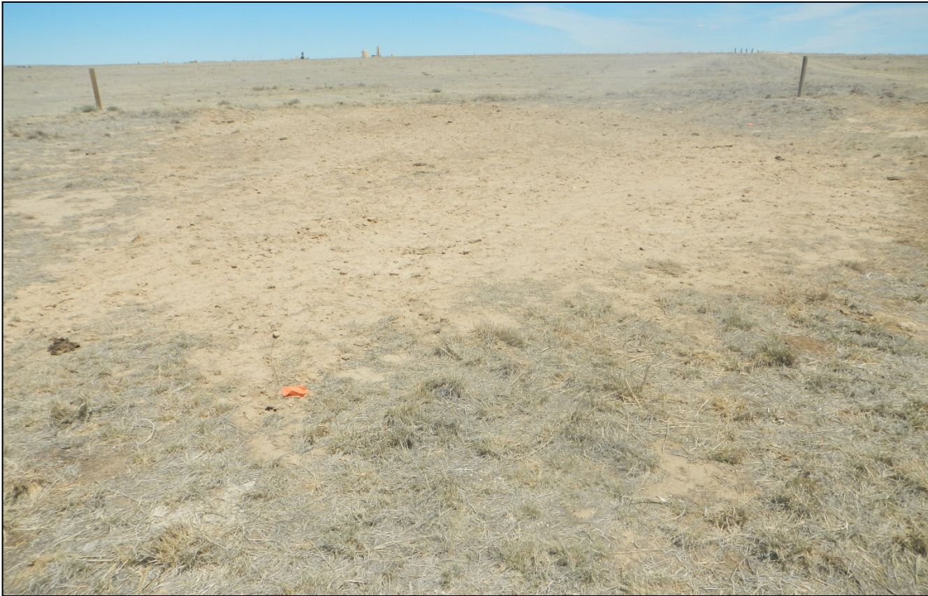
Photo 3. Facing back toward the north at the location.