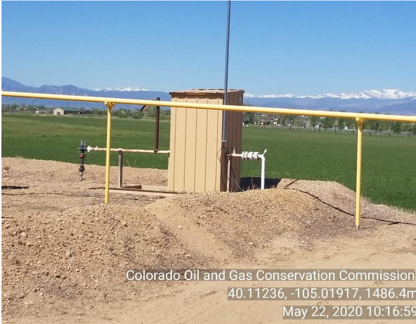
Photo 3 Unused equipment meter house not in operation not attached to flow lines