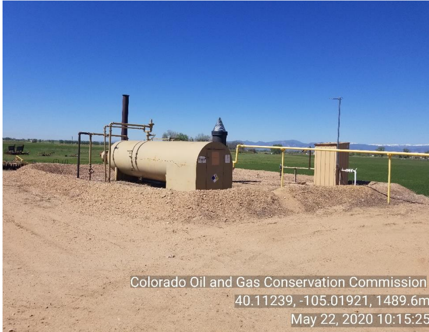
Photo 1 Sep/ meter house