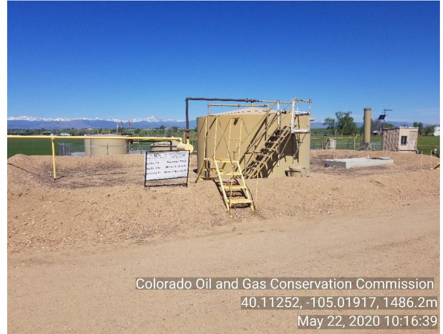
Photo 2 TNK BTRY and working meter house