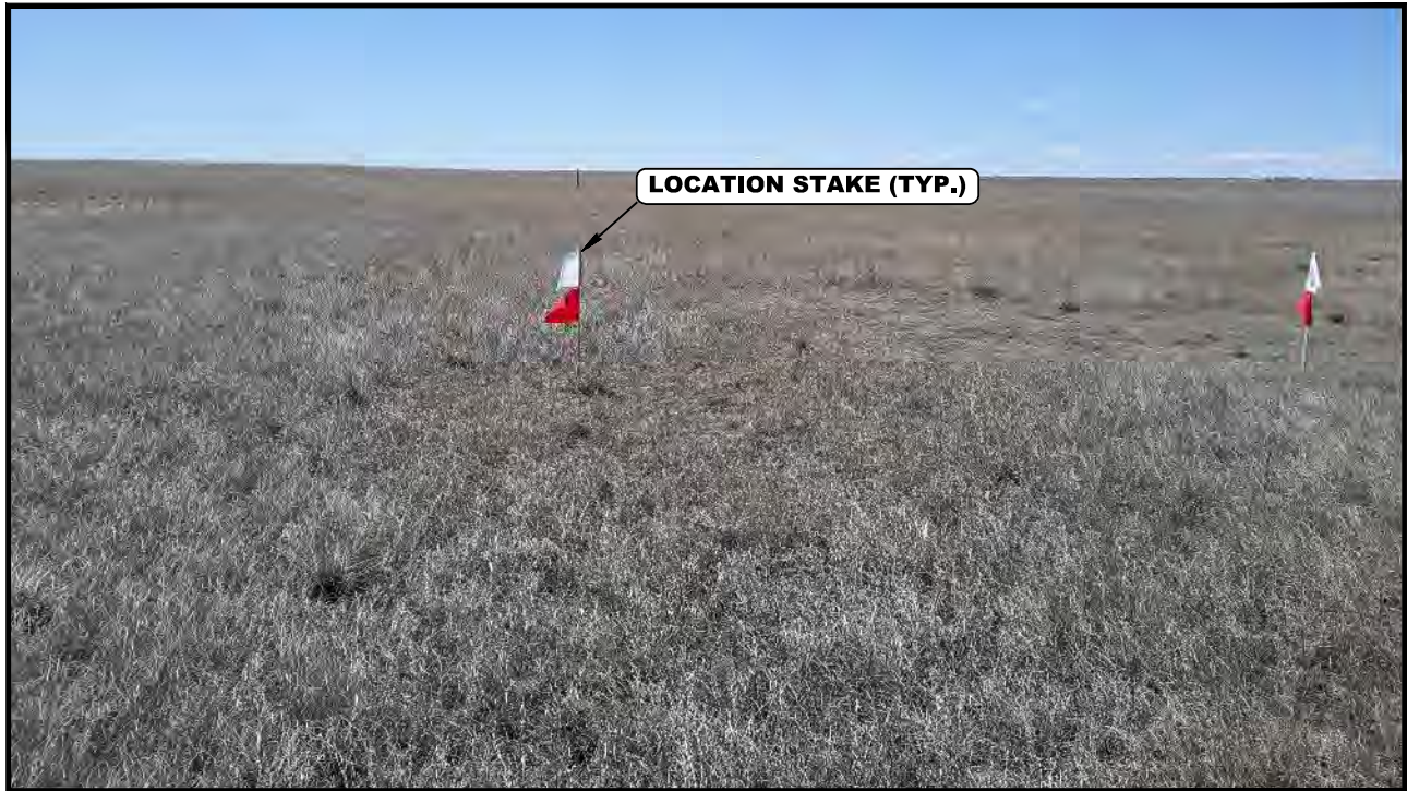
PHOTO: VIEW OF LOCATION STAKES