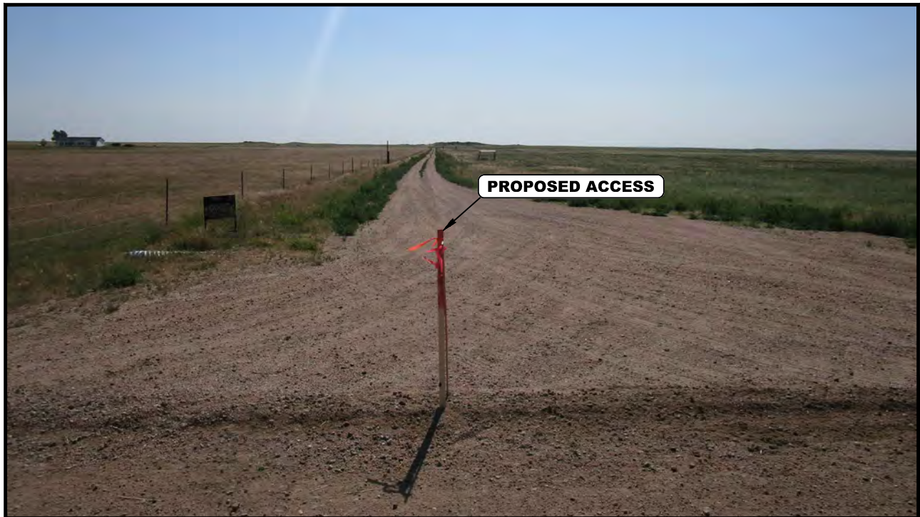
PHOTO: VIEW FROM COUNTY ROAD 95