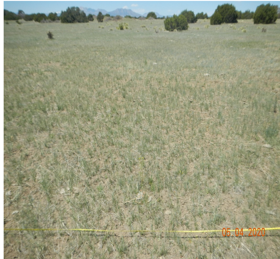
Photo 8. Facing northwest at the midpoint of the vegetation transect performed at the disturbed location.