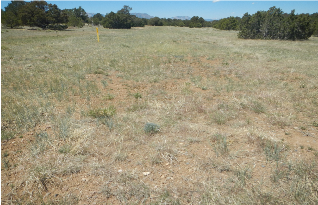
Photo 1. Facing west along the reclaimed access road. The vegetation has uniformly established along the reclaimed road.