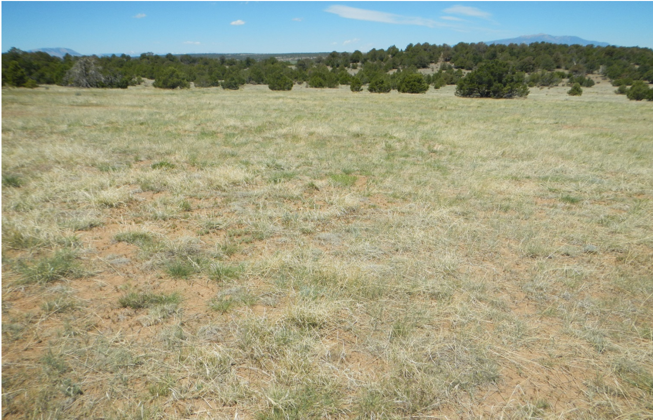
Photo 4. Facing east at the location. Perennial vegetation is well established throughout the location and consists of Western wheat grass, Sand dropseed, Blue grama among other species.