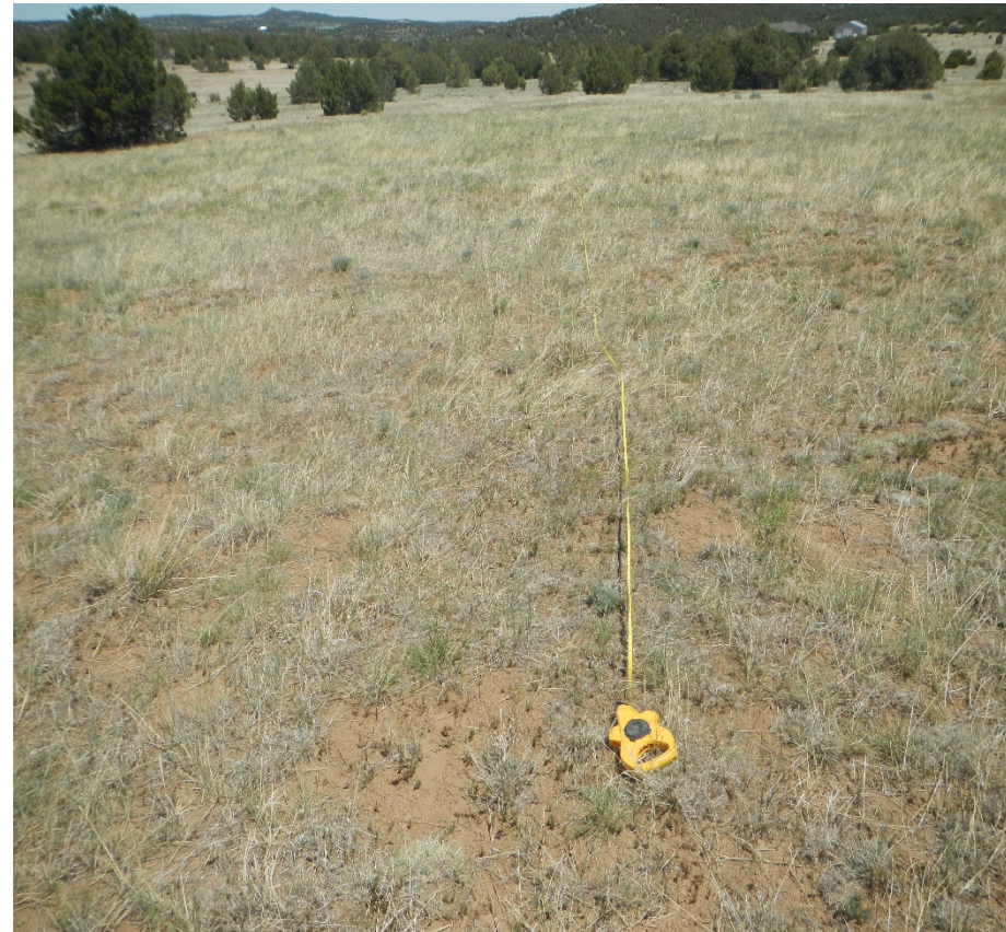
Photo 6. Facing northeast at the end of the vegetation transect performed at the disturbed location.