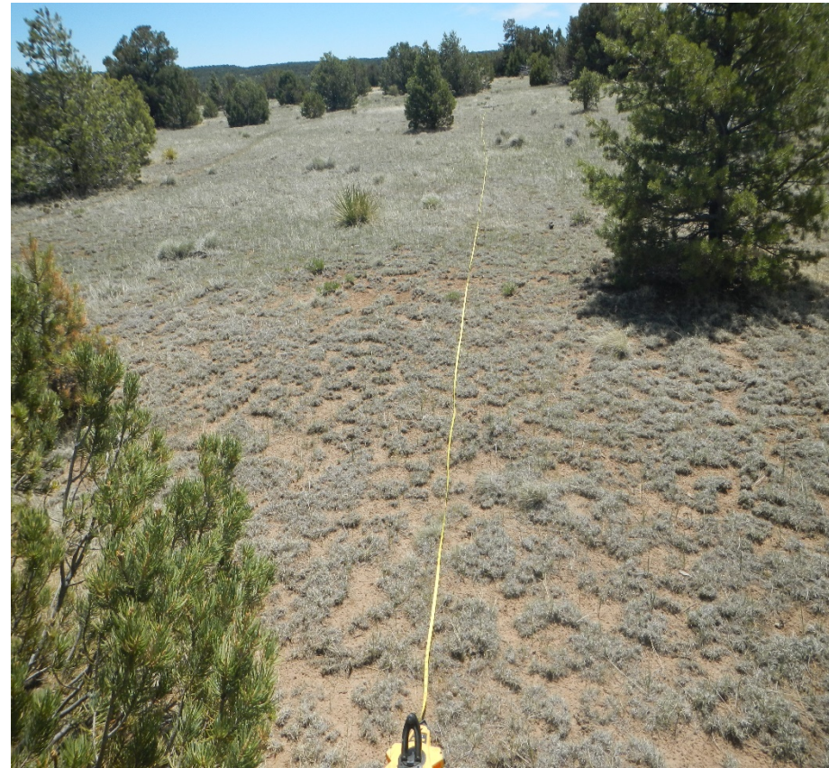
Photo 10. Facing southeast at the end of the vegetation transect performed at the reference area.