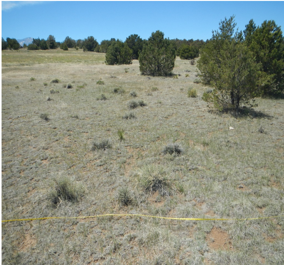
Photo 11. Facing southwest at the midpoint of the vegetation transect performed at the reference area.