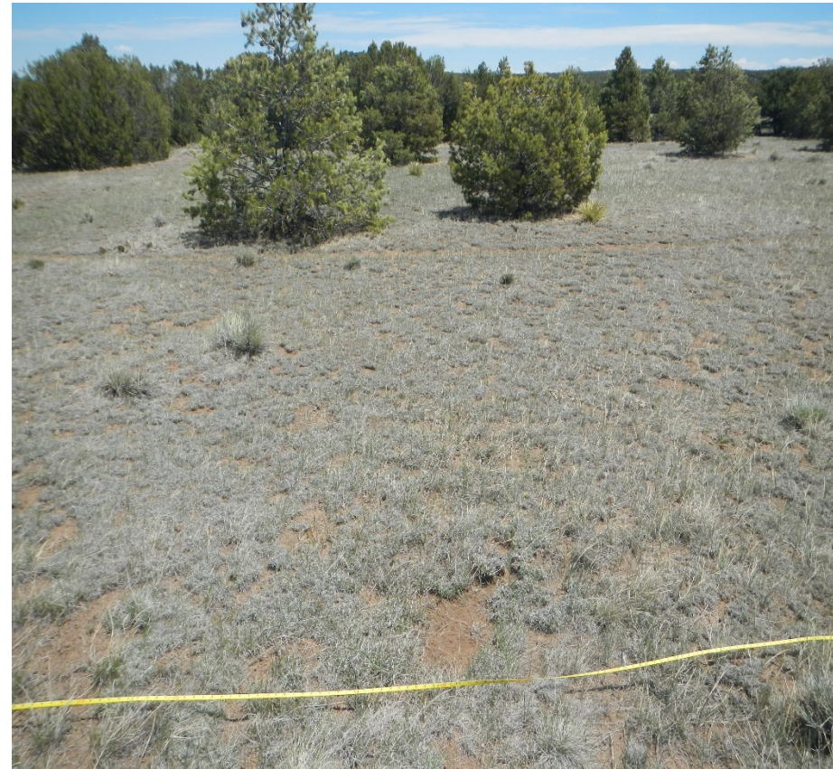
Photo 12. Facing northeast at the midpoint of the vegetation transect performed at the reference area.