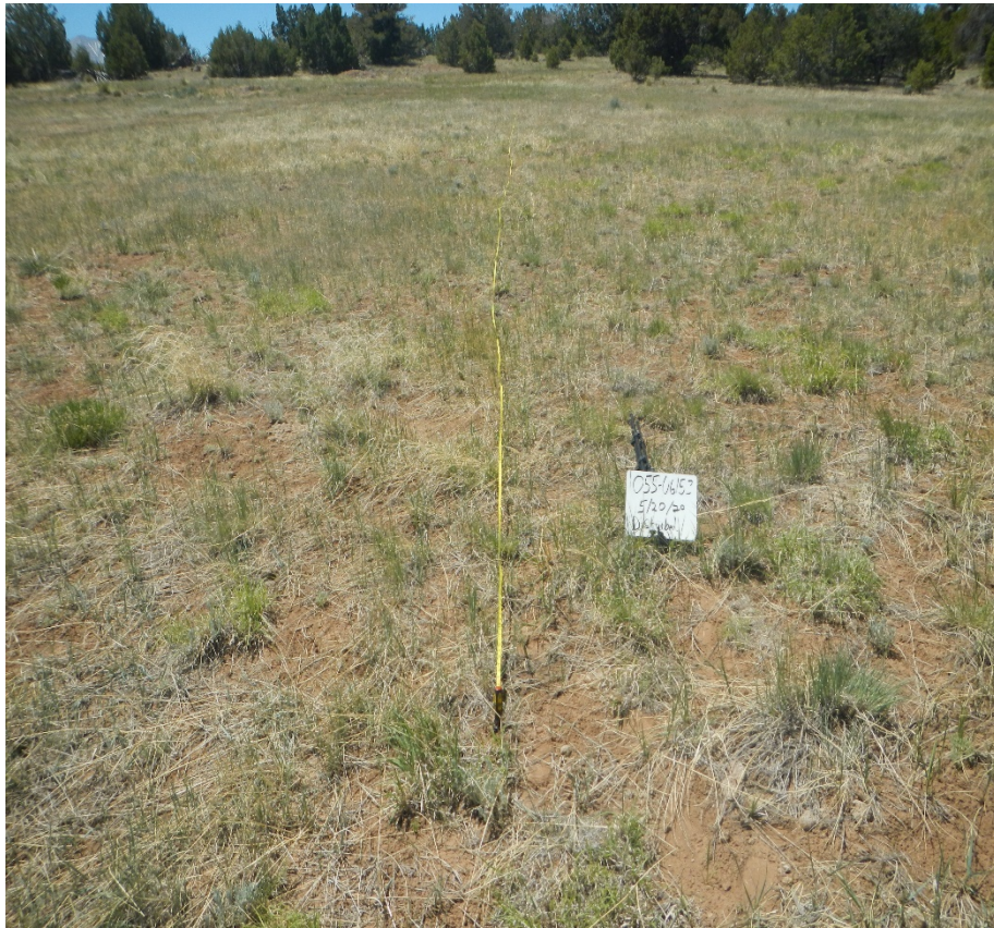
Photo 5. Facing southwest at the beginning of the vegetation transect performed at the disturbed location.