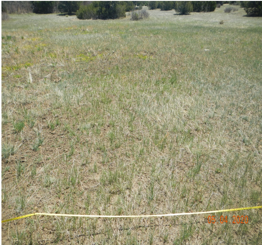
Photo 7. Facing southeast at the midpoint of the vegetation transect performed at the disturbed location.