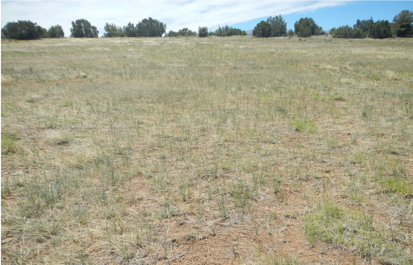
Photo 3. Facing east at the location. Perennial vegetation is well established throughout the location and consists of Western wheat grass, Sand dropseed, Blue grama among other species.