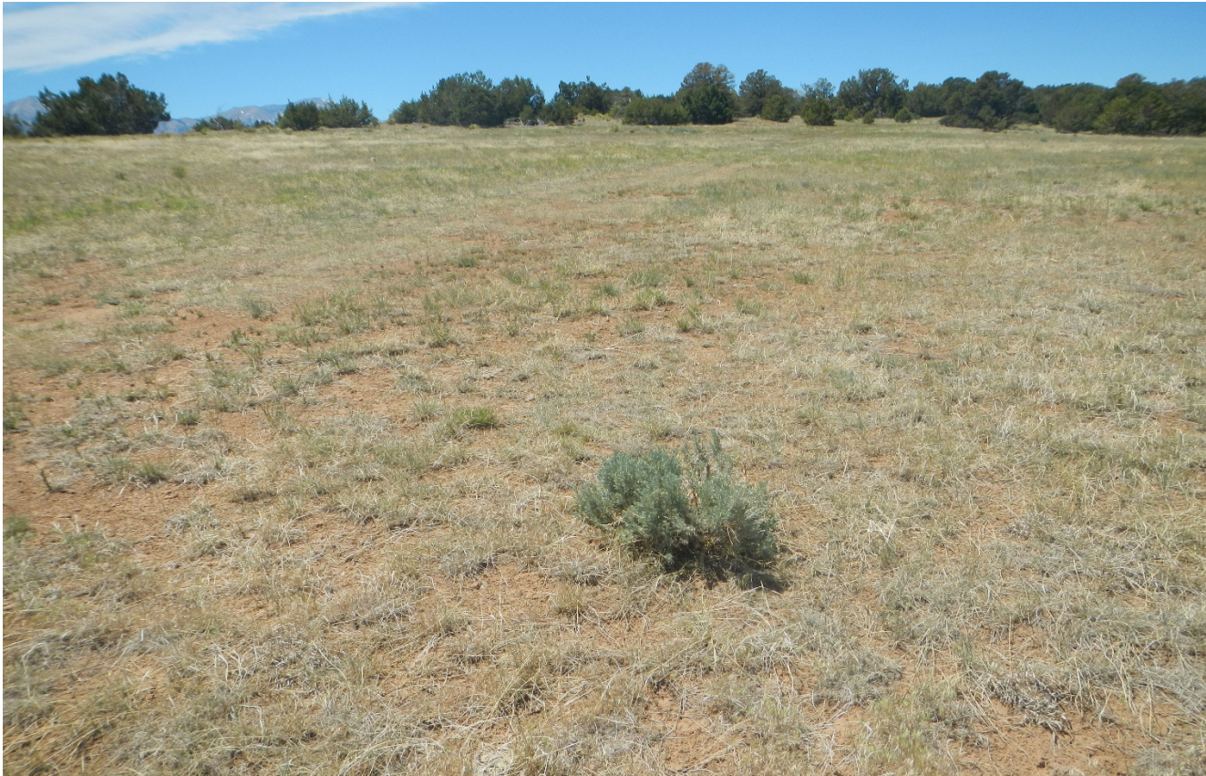
Photo 2. Facing southwest toward the location. The location is reclaimed and revegetated.