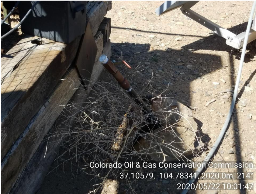
PHOTO 5: UNUSED EQUIPMENT (1" RISER NEAR PUMPJACK). REMOVE UNUSED EQUIPMENT ACCORDING TO NTO AND RULE 603.f.. CA DATE 8-22-20.