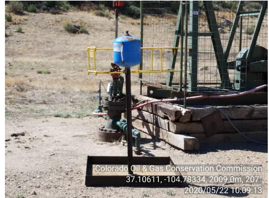
PHOTO 6: UNUSED EQUIPMENT STORED ON LOCATION. REMOVE OR INSTALL UNUSED EQUIPMENT. COMPLY WITH RULE 603.f. CA DATE 8-22-20