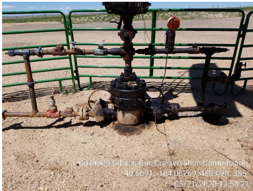
Photo 5 – Stained Soil at 1-14-8-60 Wellhead