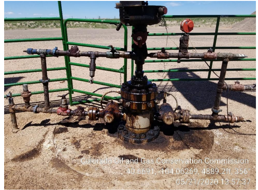
Photo 3 – Stained Soil at 2-14-8-60 Wellhead