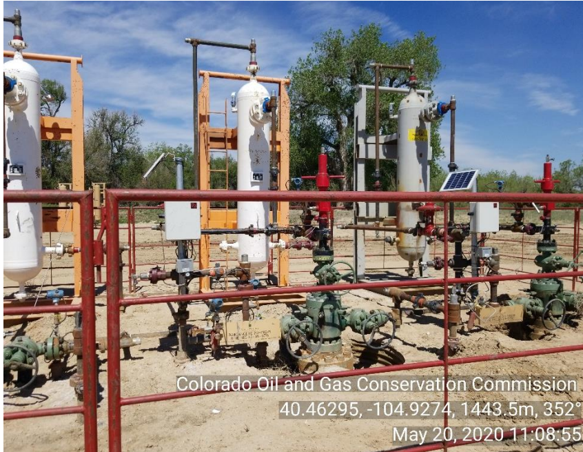
Colorado Oil and Gas Conservation Commission 40.46295, -104.9274, 1443.5m, 352° May 20, 2020 11:08:55