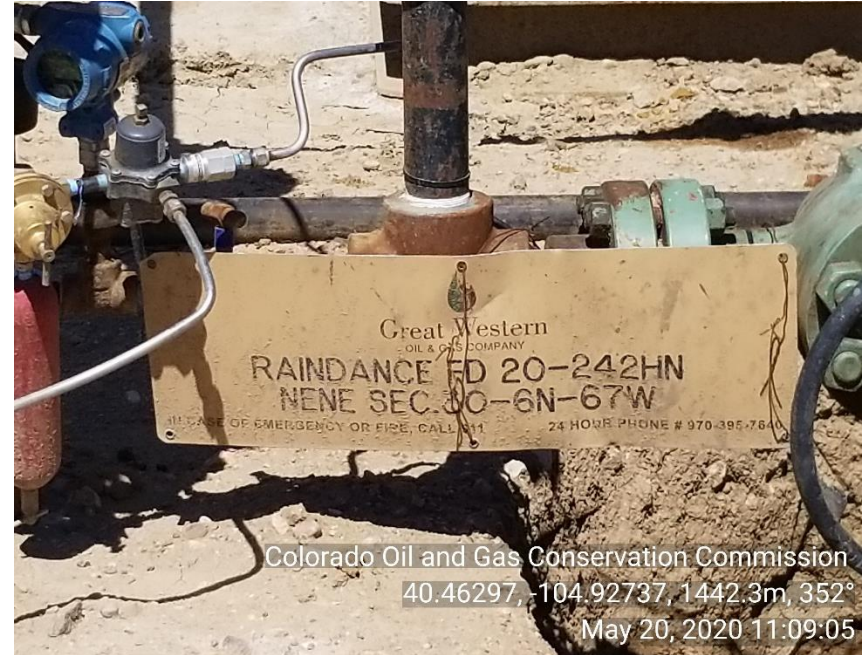
Colorado Oil and Gas Conservation Commission 40.46297, -104.92737, 1442.3m, 352° May 20, 2020 11:09:05