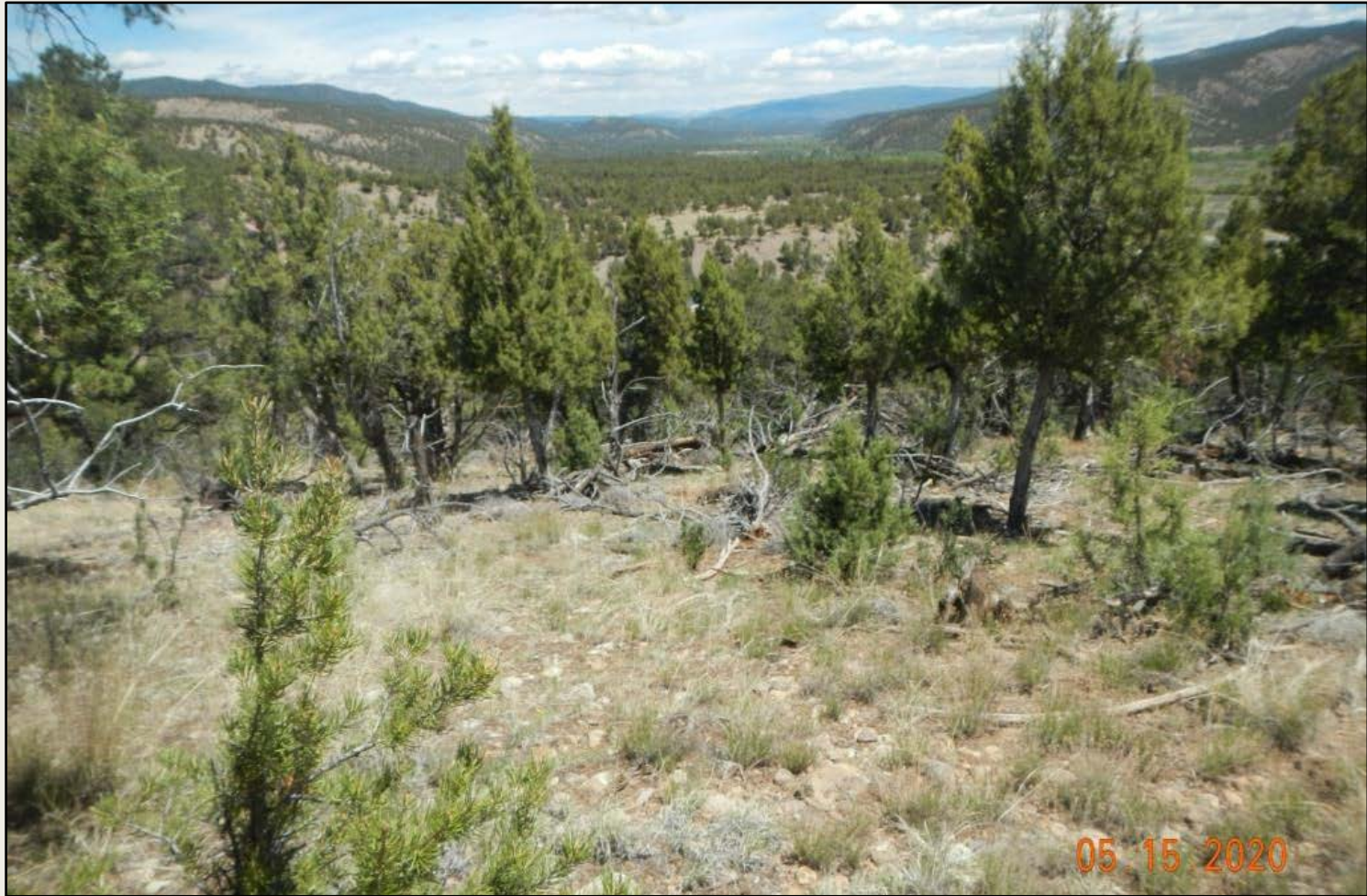
Photo 5. View of reference area vegetation comprised of pinyon juniper woodland with understory of grasses and forbs such as Indian ricegrass, James galleta, and Navajo tea.