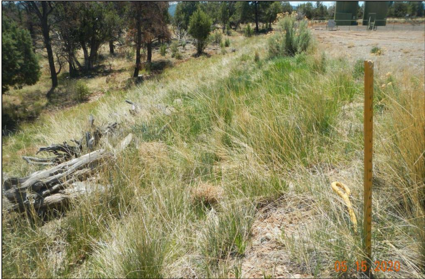
Photo 2. View of the southern project area from the southeastern corner facing westward. Revegetation is progressing on the fill slope with grasses such as western wheatgrass, crested wheatgrass, and Indian ricegrass.