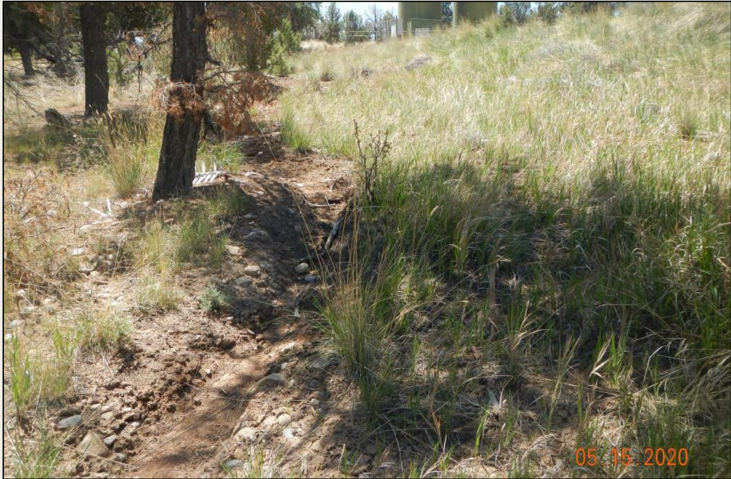
Photo 4. View of erosional channel approximately 1.5 feet wide and 1 foot deep, where stormwater flows exiting the southern well pad become concentrated and channeling off of the project area.