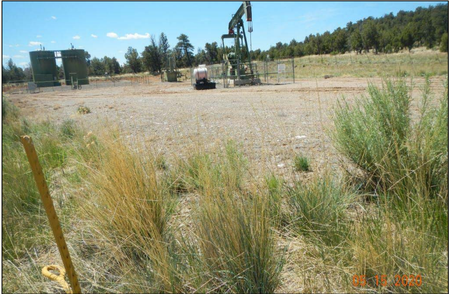
Photo 1. View of the project area from the southeastern corner facing center.