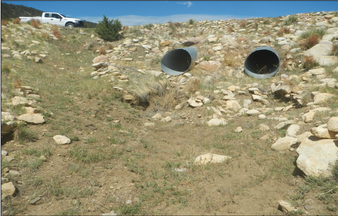
Photo 5. Facing toward the culvert outlet in the drainage shown in previous photos.