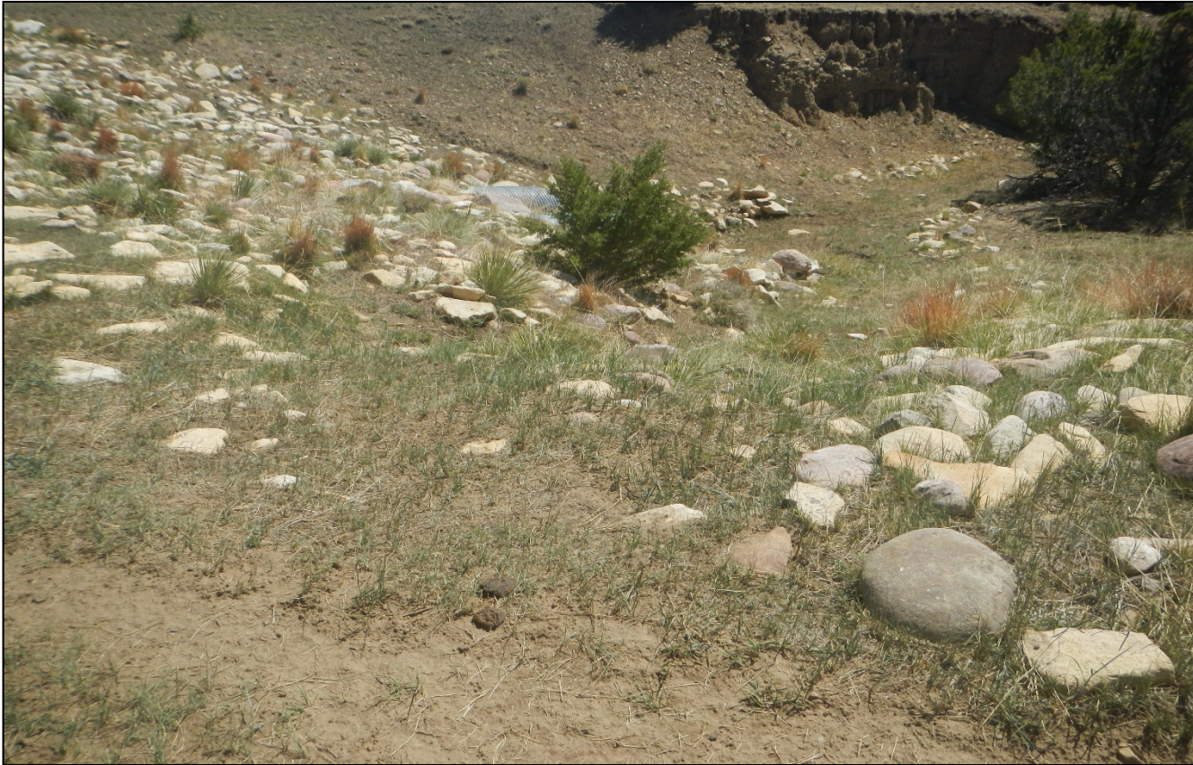
Photo 4. It appears rock rip/rap was displaced from this area of the embankment which could possibly cause erosion to occur in this area if stormwater flows across this embankment.