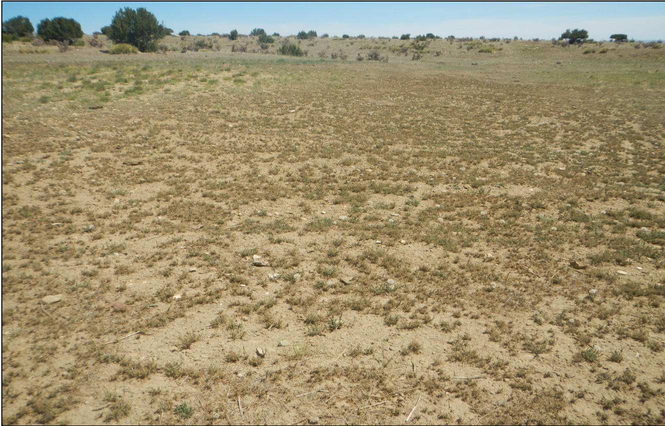
Photo 8. Facing northeast at the east side of the location. This area consist primarily of weeds (Redstem filaree).