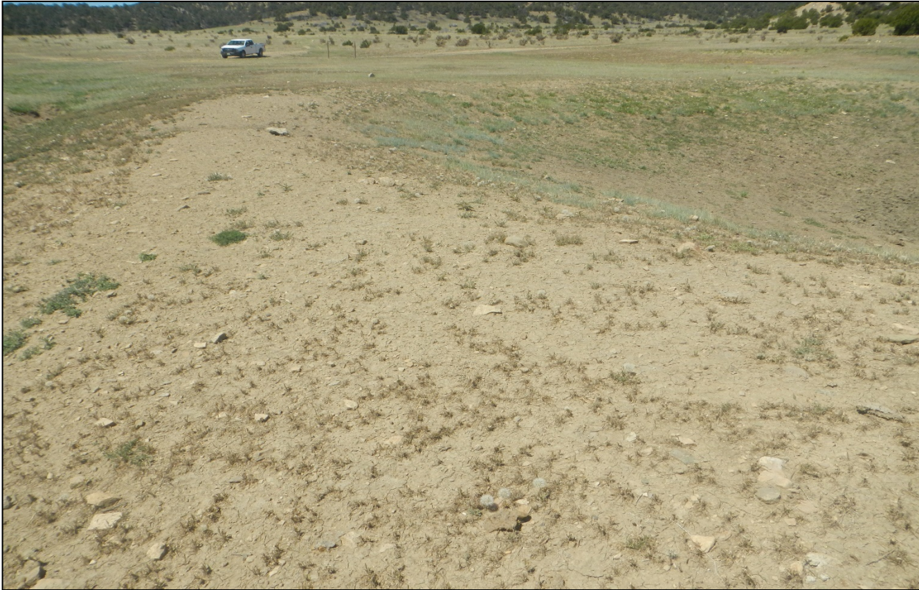
Photo 11. Facing southwest toward the location and pit area. This area of the pit berm is bare of vegetation.