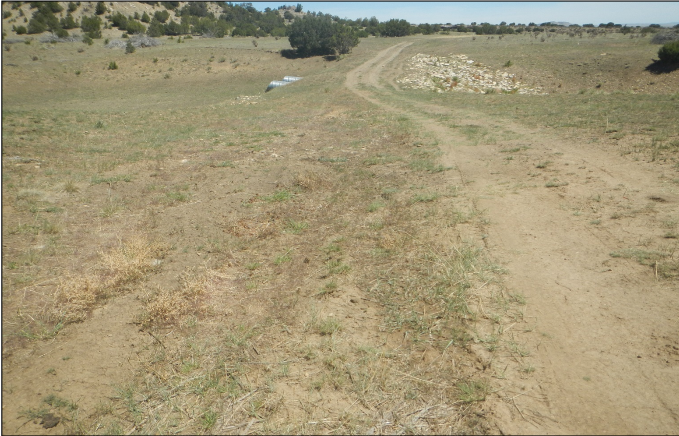
Photo 2. Facing northeast along the access road. The access road has not been reclaimed and culverts remain in the drainage.