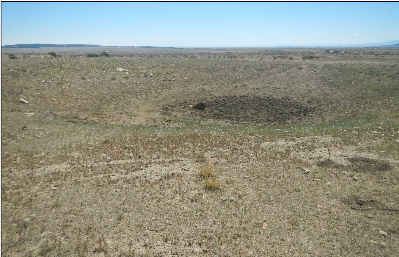
Photo 10. Facing toward the pit that remains per approved variance request.