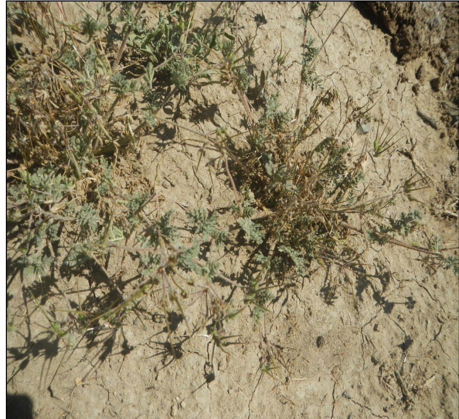
Photo 9. Facing southwest at the east side of the location. This area consist primarily of weeds (Redstem filaree). 100 ft. tape measure shows area that consists of weeds.