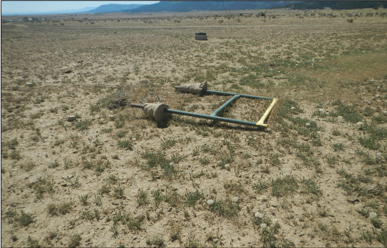
Photo 12. There were 3 metal H-braces found at the location that were apart of the location fence. These H-braces need to be removed from the location.