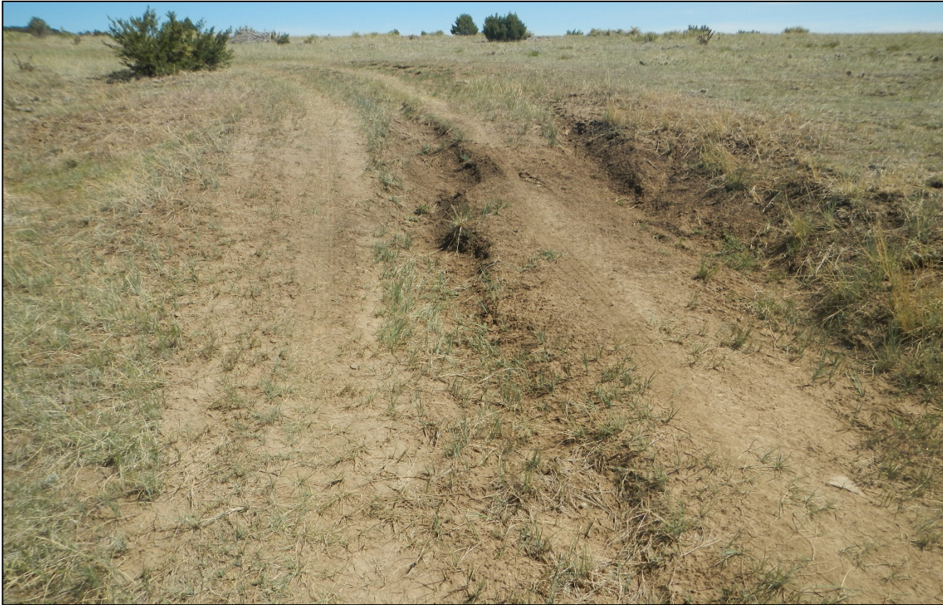
Photo 1. Facing north near the Valent Canyon location. There is an erosion channel forming along this area of the road. Lat/Long:37.34363,-104.60370.