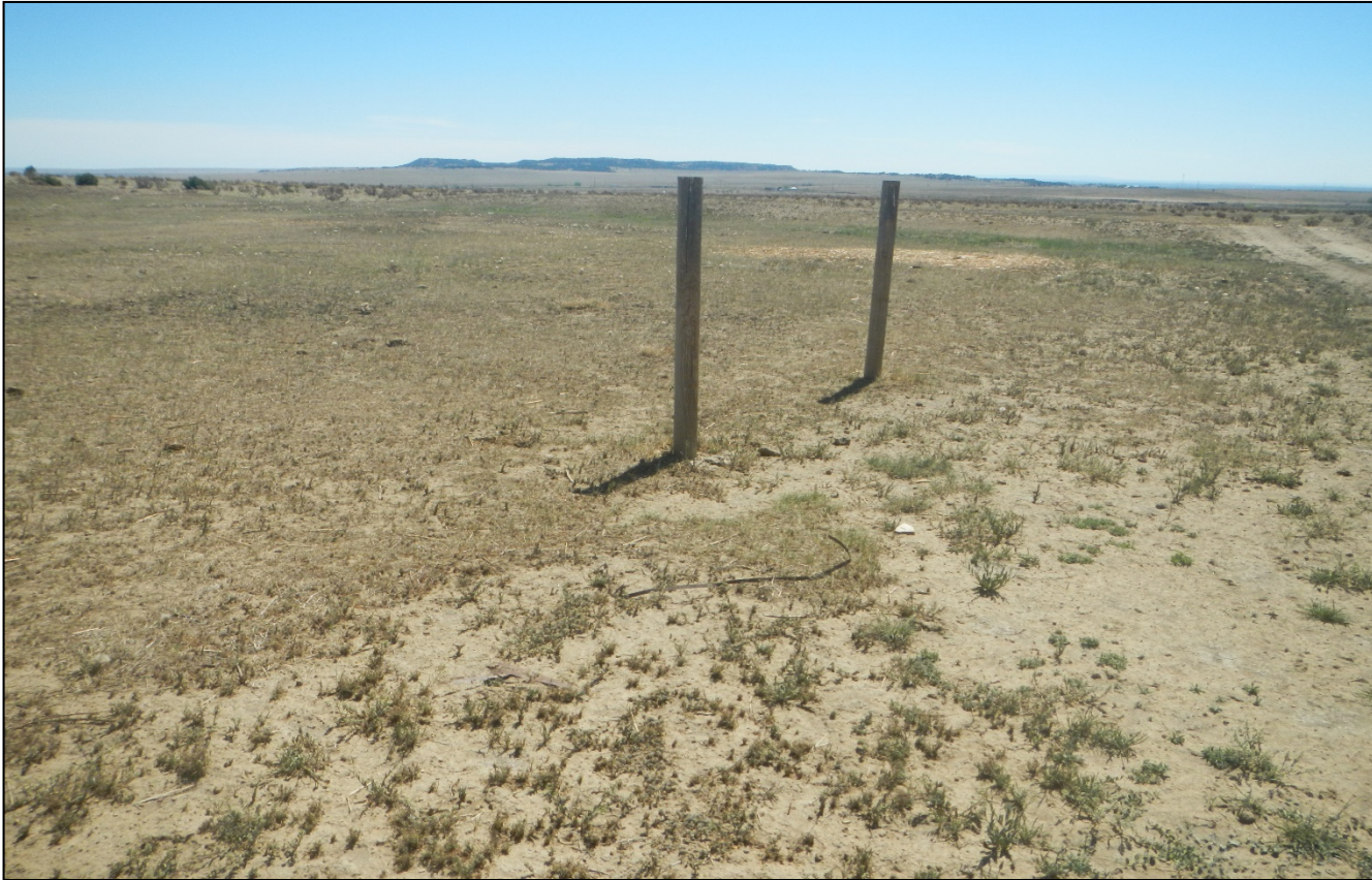
Photo 7. Facing east toward the location. Two fence post remain at the location and need to be removed.