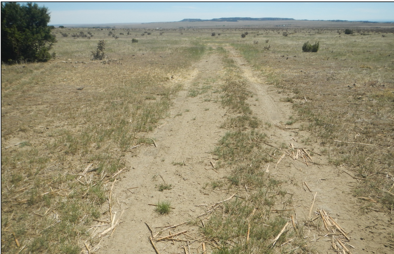
Photo 6. Facing east along the access road.