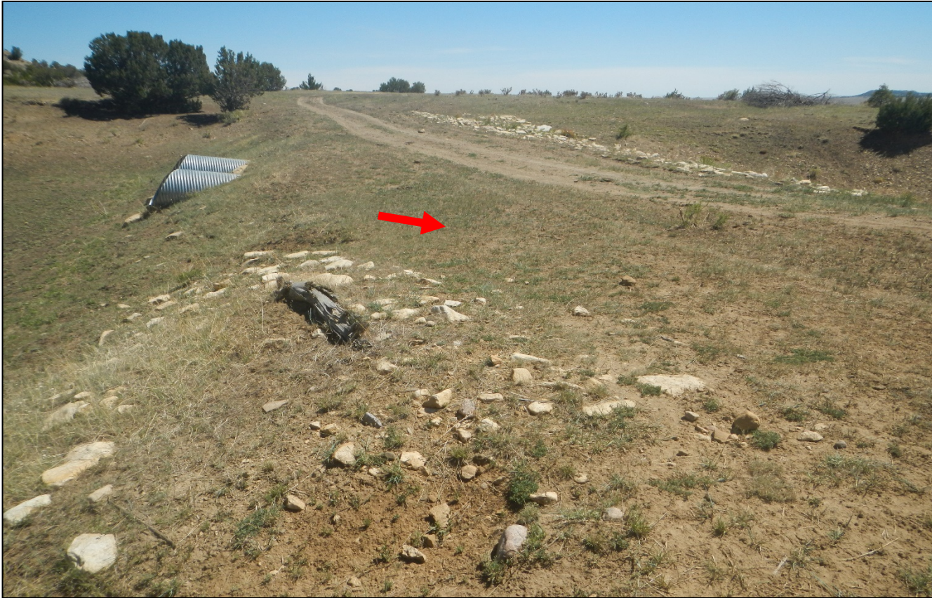
Photo 3. Facing north along the access road. It appears during precipitation events stormwater has previously flowed across the road in area of the red arrow. This has caused rip/rap to be displaced on other side shown in next photo.