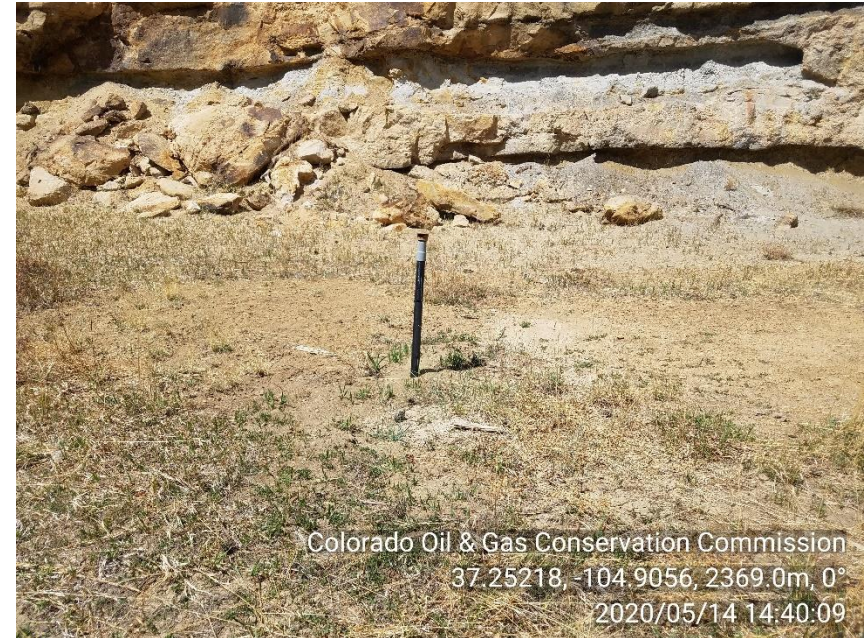
PHOTO 4: UNUSED EQUIPMENT (2" RISER). REMOVE UNUSED EQUIPMENT COMPLY WITH NTO AND RULE 603.f. CA DATE 8-14-20.