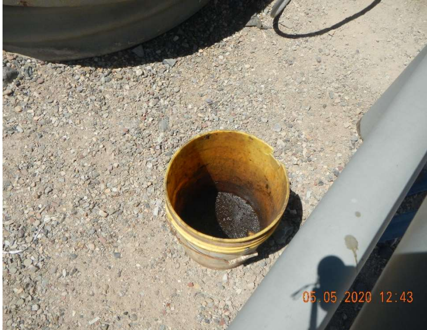
Five gallon bucket containing fluids with a detectable hydrocarbon odor