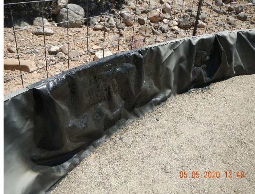
Repairs made to the PA 21 – 2 tank battery secondary containment