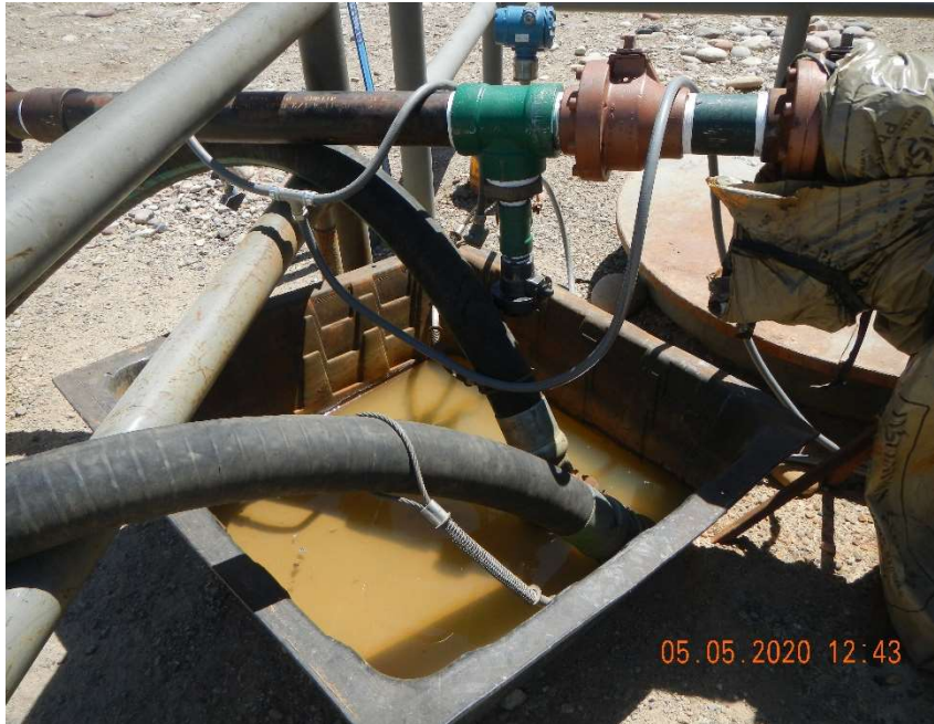
Trough containing fluids with a detectable hydrocarbon odor