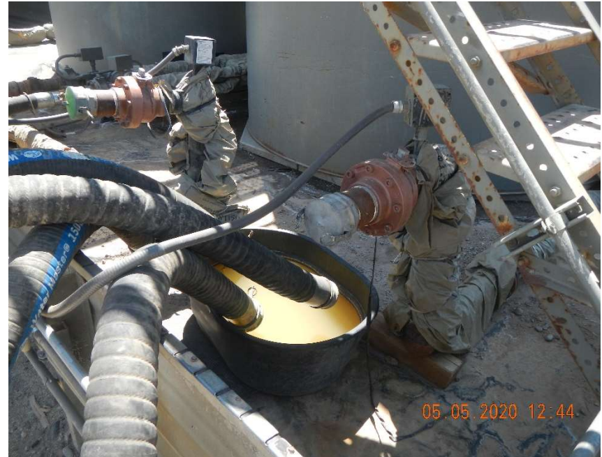
Trough containing fluids with a detectable hydrocarbon odor