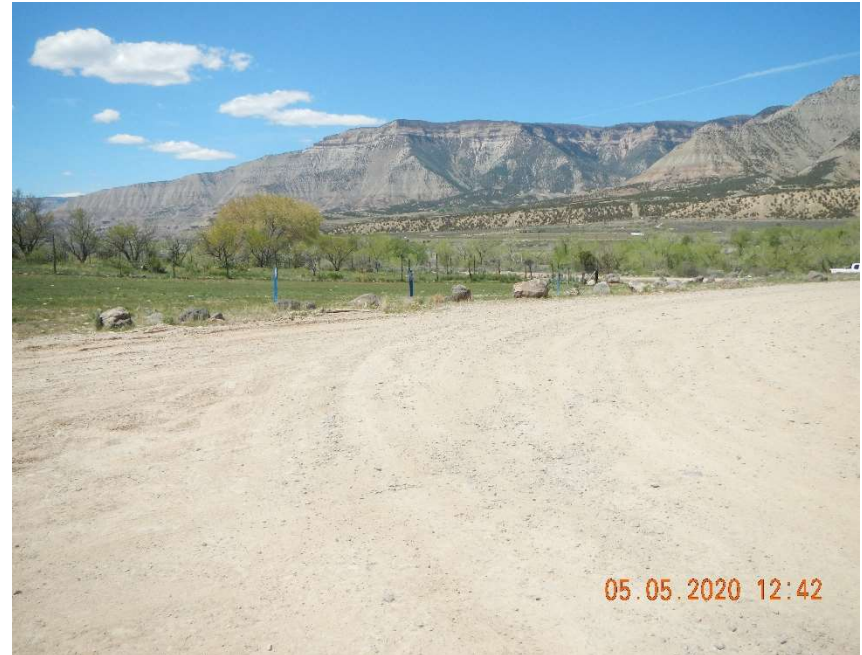
PA 21 – 2 location north of the combustor