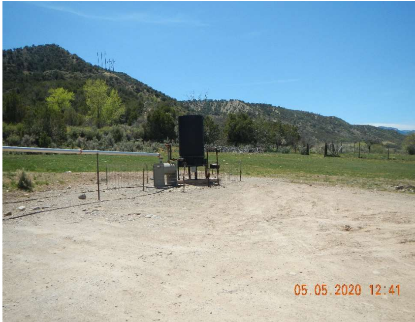
View of the combustor where Spill/Release ID 443563 occurred