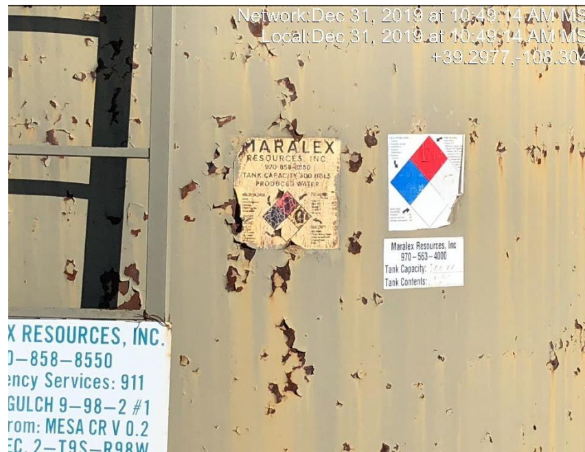
Photo #0329 from inspection #699800295 inspection conducted on 12/31/20.