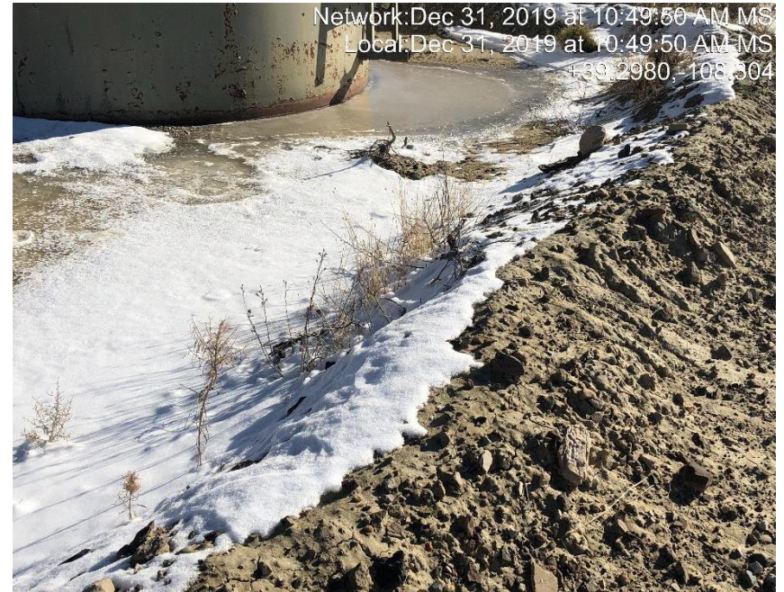
Photo #0330 from inspection #699800295 inspection conducted on 12/31/20.