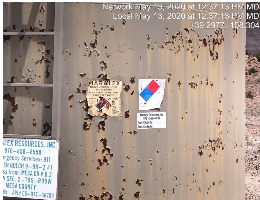
Photo #1175 Tank label and placards are weathered and not legible.