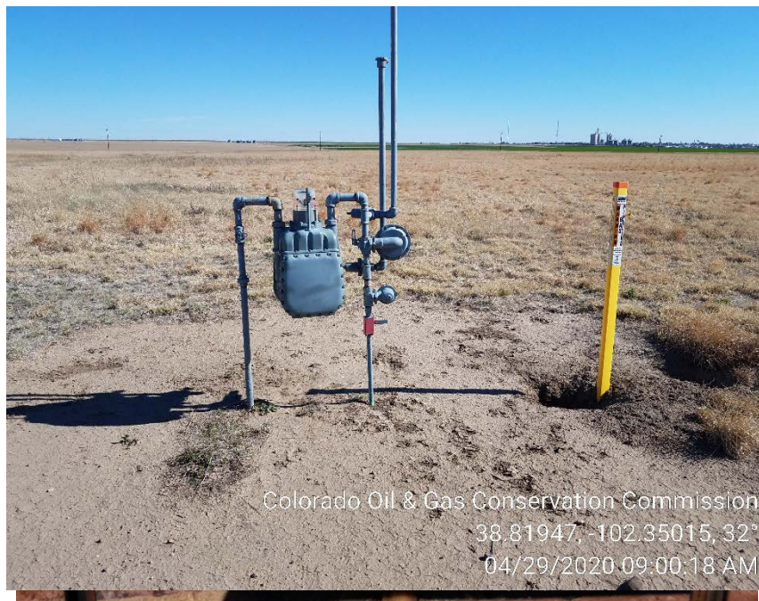
3. Bellows gas meter east of well