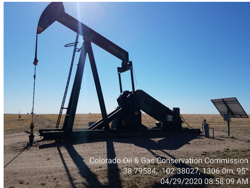
2. Wellhead Equipment