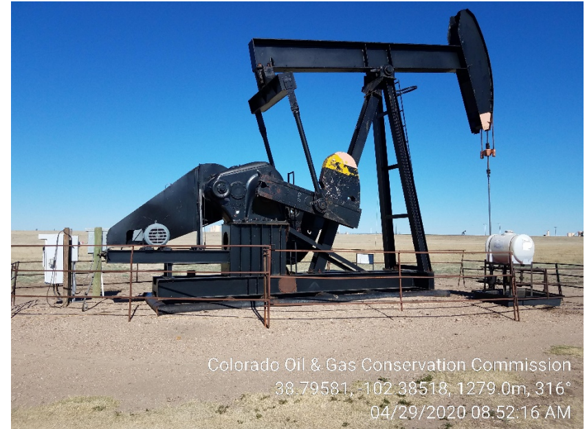
2. Wellhead Equipment