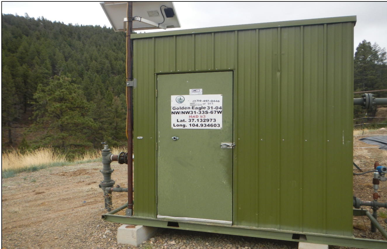
Photo 3. The well sign is posted t the meter shed.