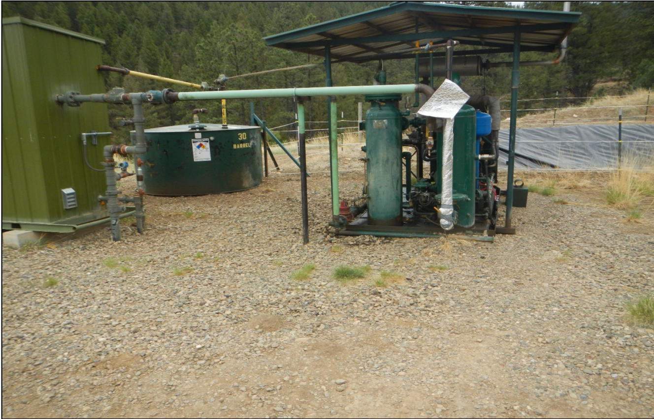
Photo 2. Oil on engine skid and on ground near engine skid appears to have been cleaned up. There is still some spotting stains around engine skid. Operator will need to inspect and maintain.