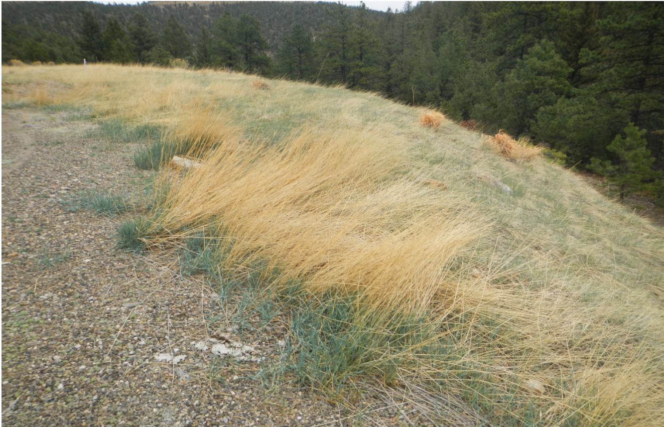
Photo 5. Facing toward the fill slope which is stabilized with vegetation.