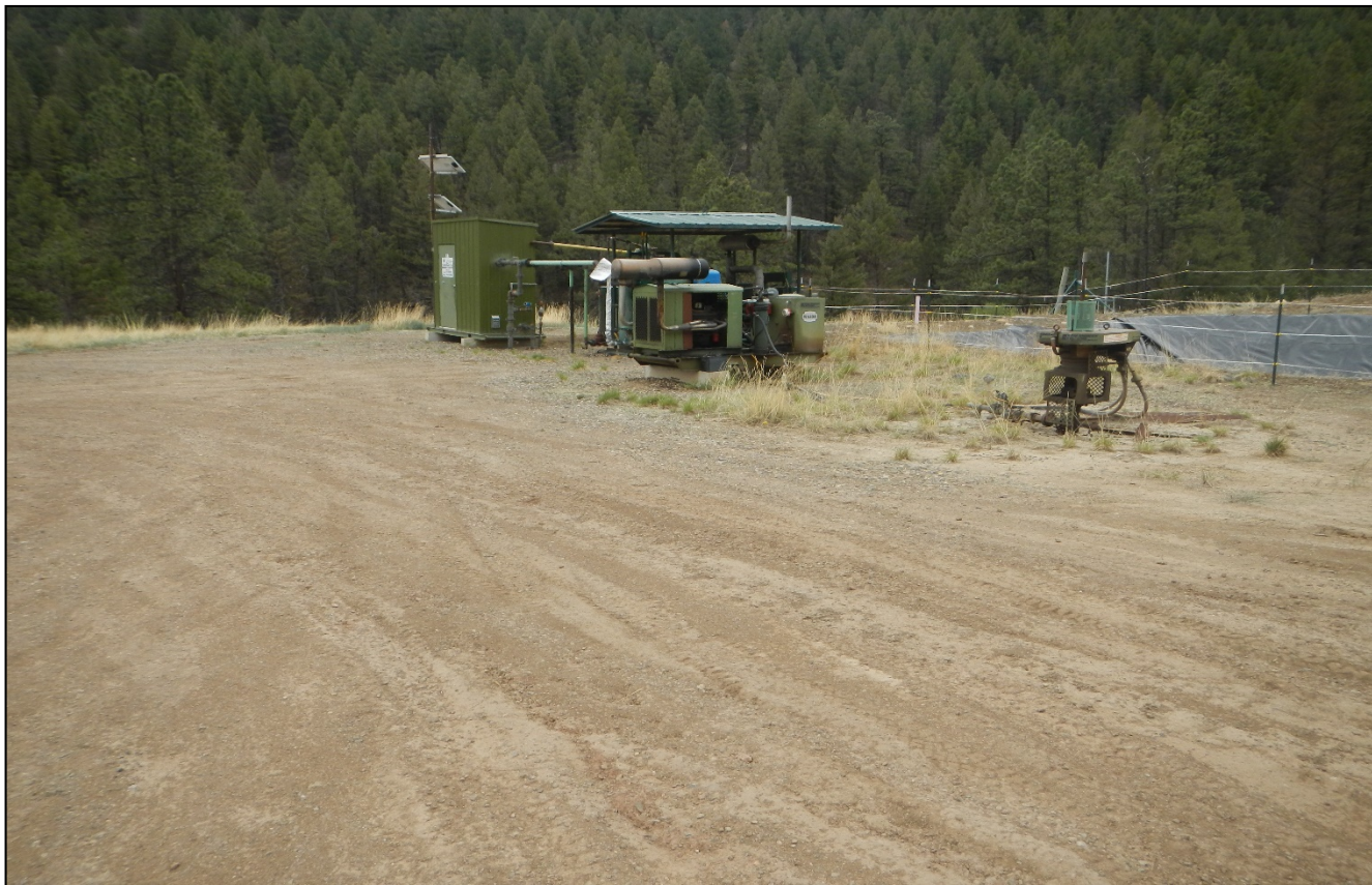
Photo 1. Facing toward the location.