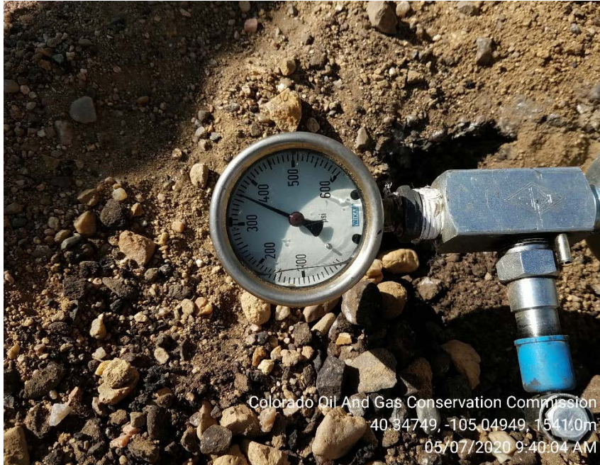
10 minute casing pressure