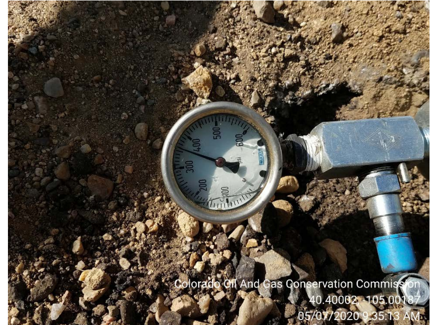
5 minute casing pressure