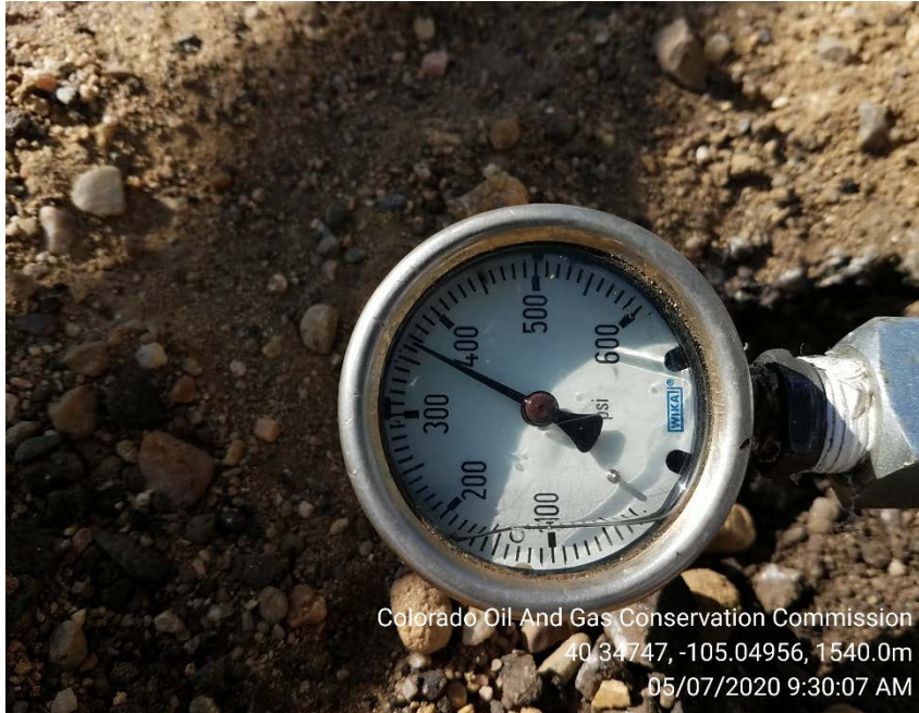
Initial casing pressure