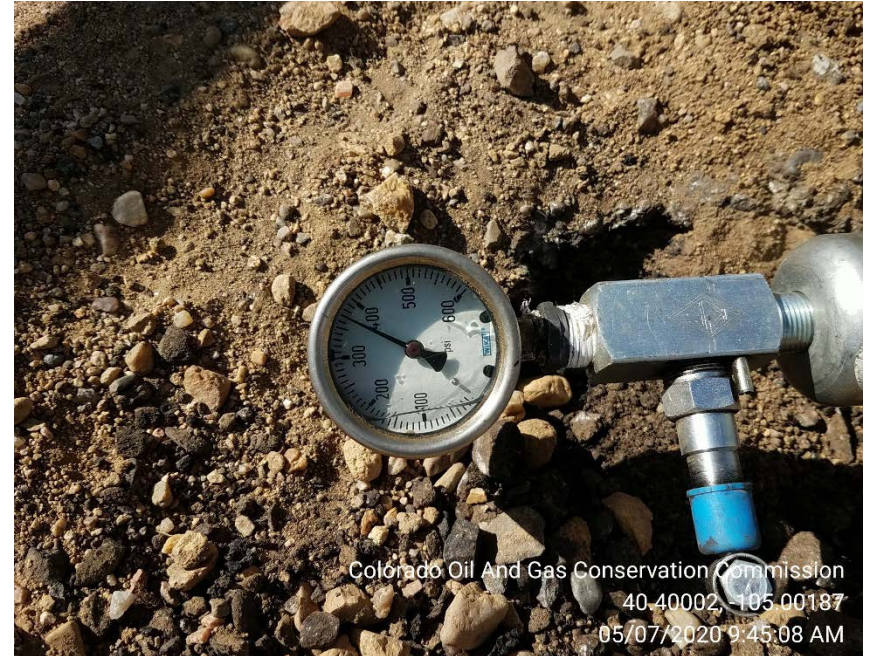
15 minute casing pressure