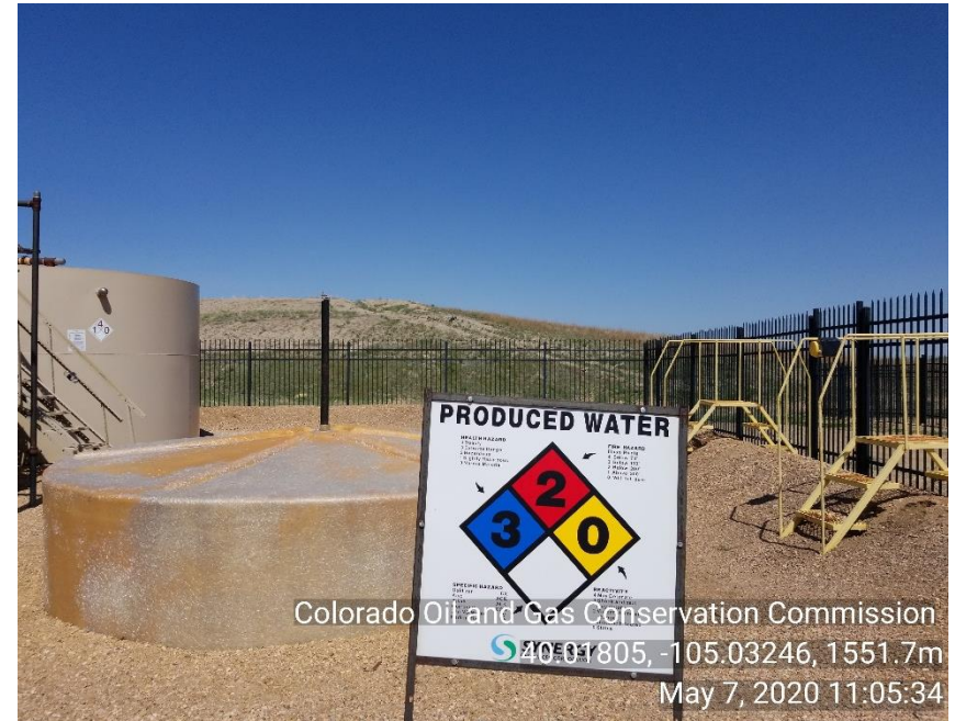
Photo 4 Produced water tank has no volume sign or markings on tank.