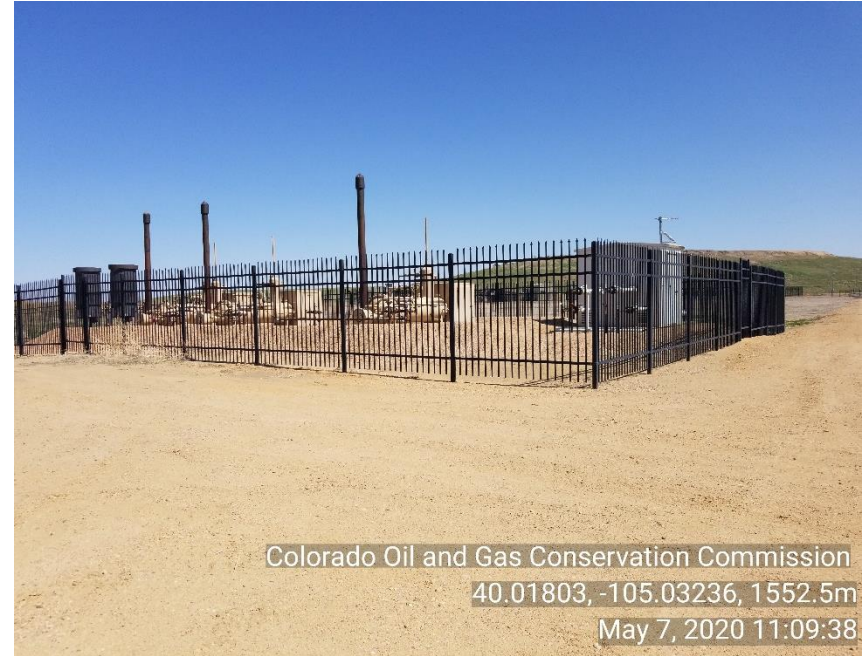
Photo 8 Meter house/seps and ECD's