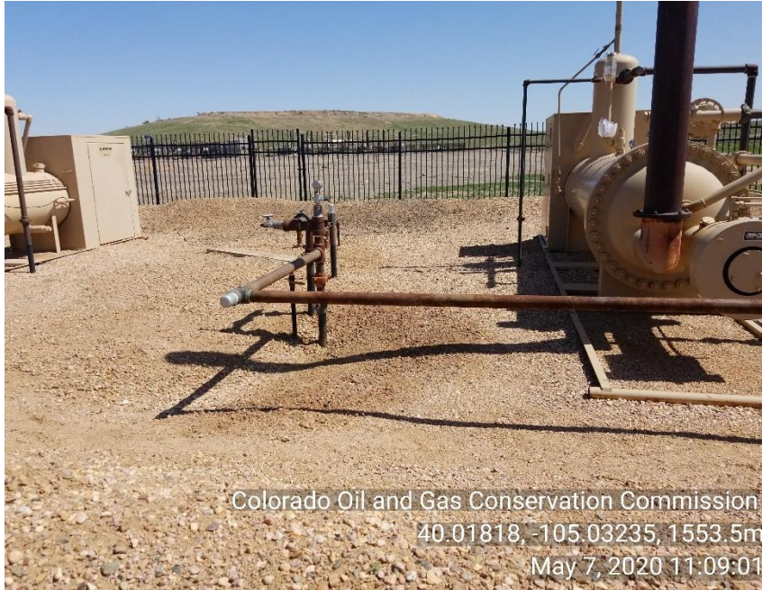
Photo 7 stained soil in separator containment