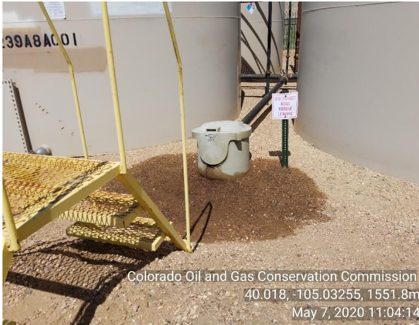
Photo 3 stained soil around crude oil load out line