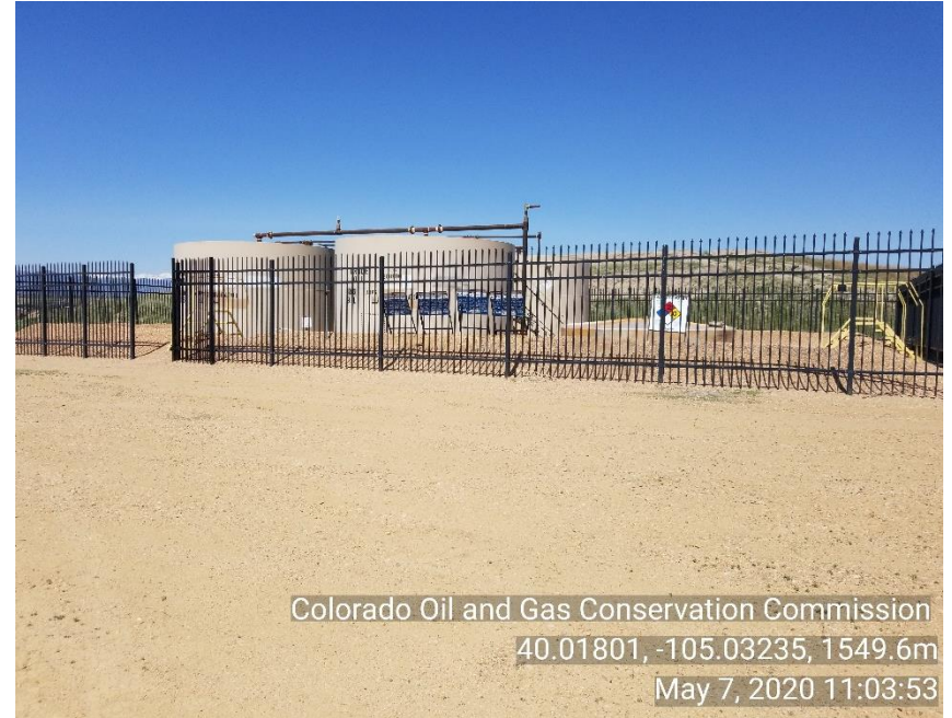
Photo 2 TNK BTRY Tank NFPA placards are either faded or missing.