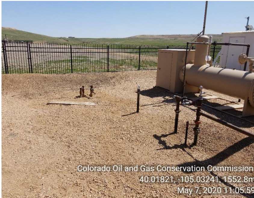
Photo 5 Lines not marked or LOTO