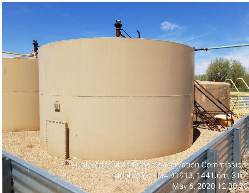
Photo 55: Tank has no type of labeling (contents/capacity/NFPA placard)