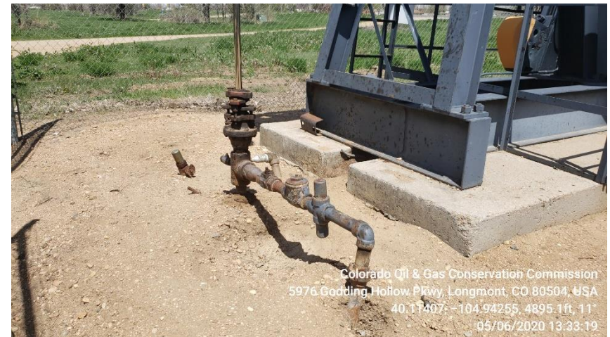
Photo 2 WH