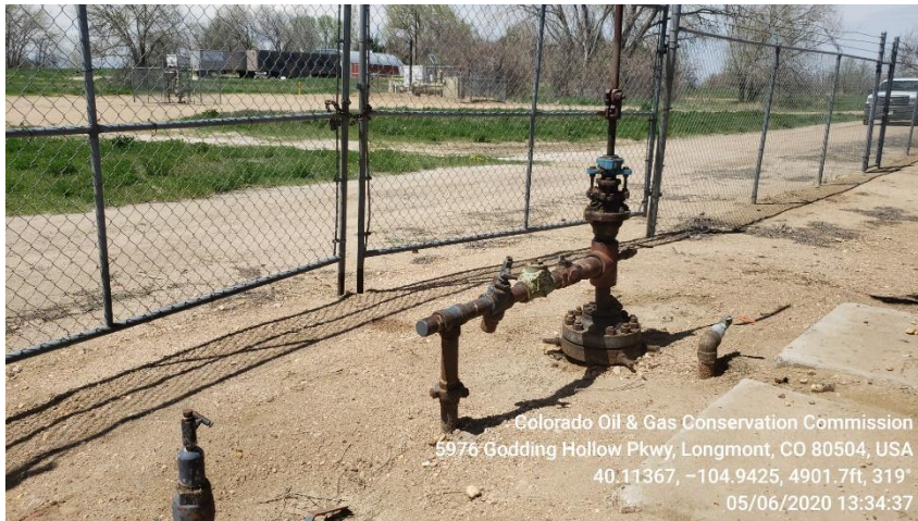
Photo 9 WH