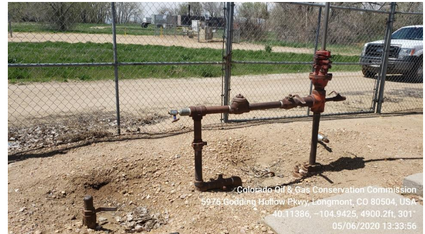
Photo 6 WH