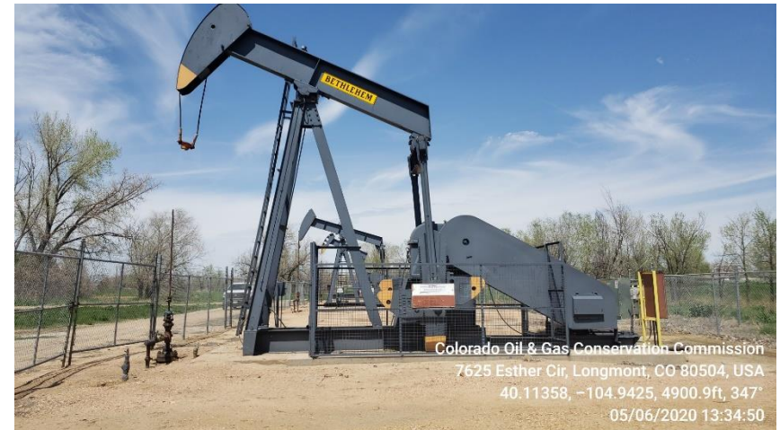
Photo 10 PU