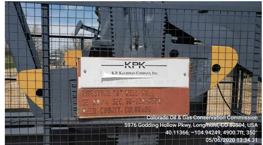
Photo 8 WH sign