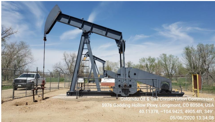
Photo 7 PU