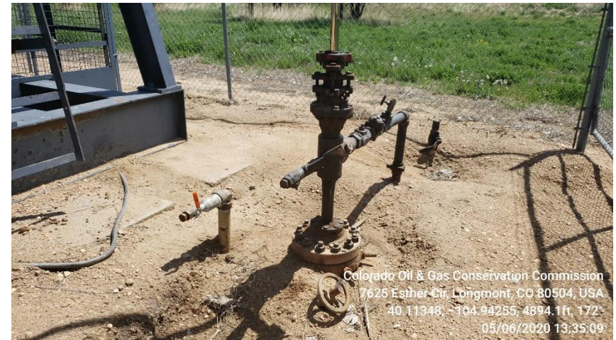
Photo 12 WH