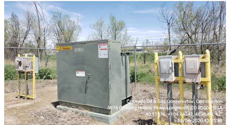
Photo 4 Transformers, meter box and electric panel