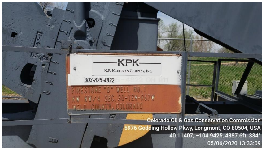
Photo 1 WH sign