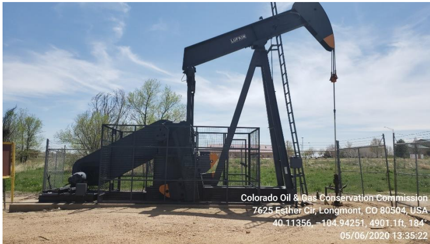
Photo 13 PU