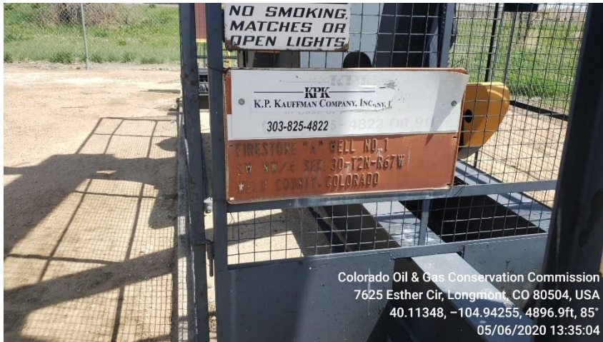
Photo 11 WH sign