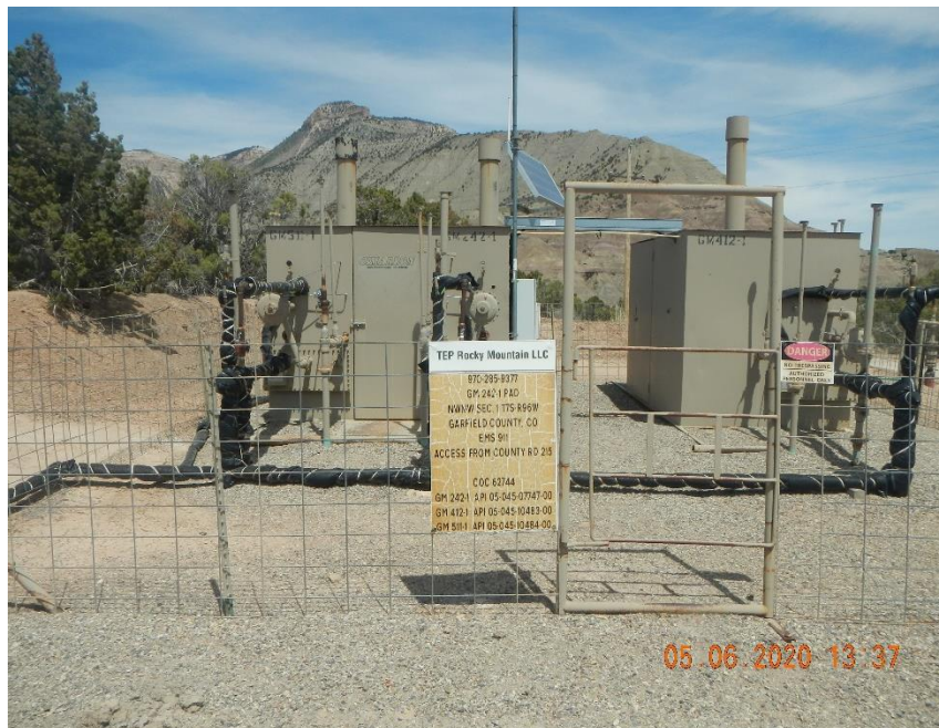
Separators and Produced Water tank at remote location. Coordinates 39.47215 -108.06387