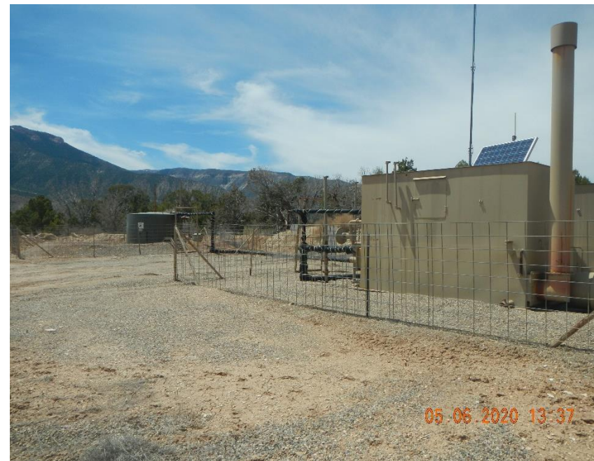
Separators and Produced Water tank at remote location. Coordinates 39.47215 -108.06387