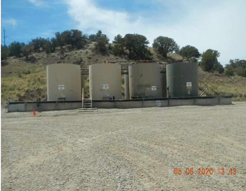
Unused Drilling Mud storage tanks. Tank labels need updated of operator name.