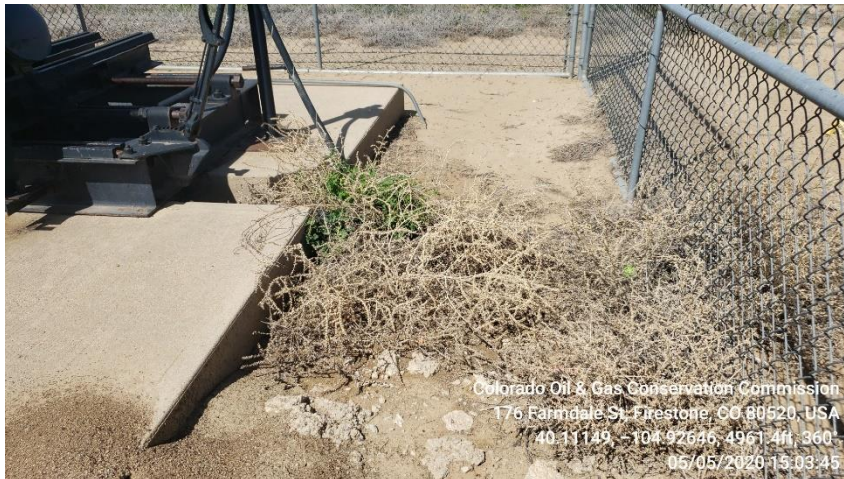
Photo 5 dead weeds inside WH/PU fencing