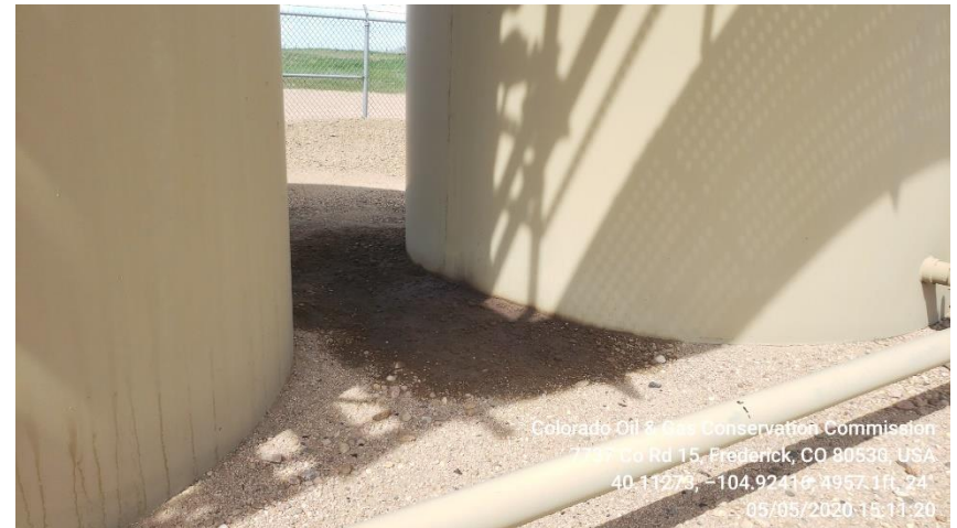
Photo 14 Stained soil between crude oil tanks