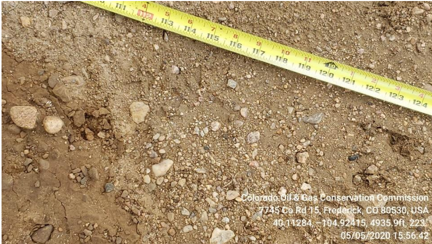
Photo 17 Stained soil approximately 10' long