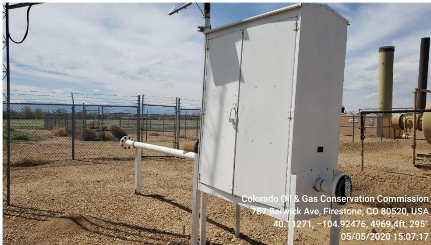
Photo 9 unused gas meter run