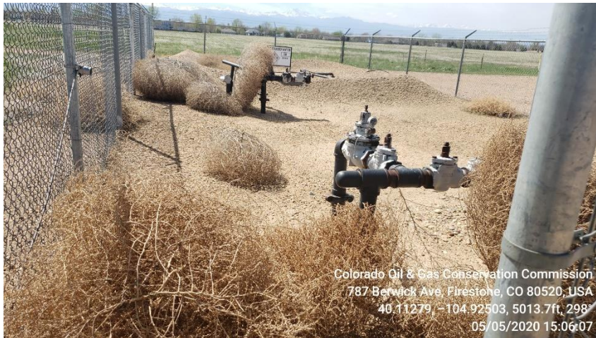
Photo 7 dead weeds inside PW tank fencing