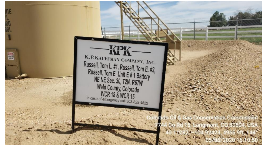
Photo 12 TB sign