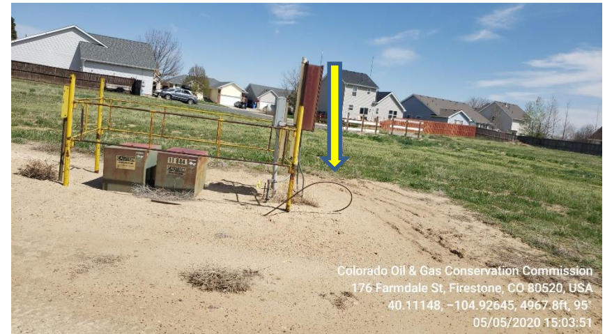
Photo 6 transformers, meter box and electric panel, Trash (bent rebar)