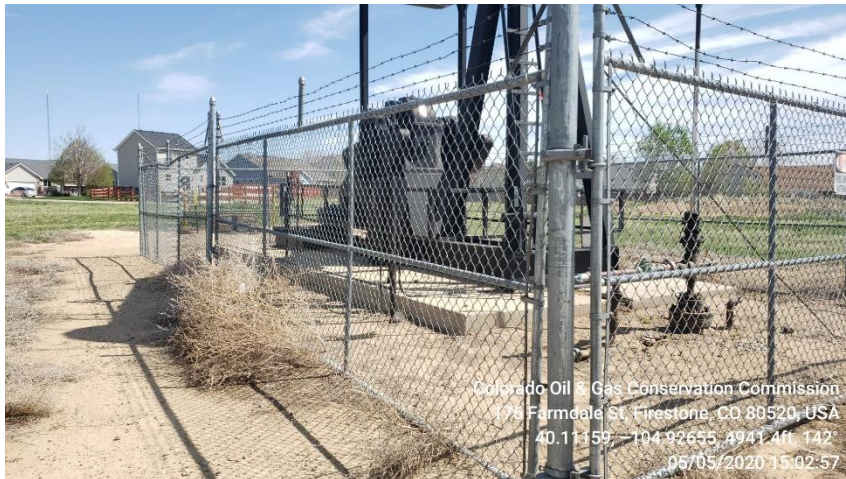
Photo 3 dead weeds around WH/PU fencing