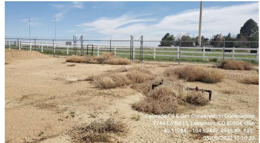
Photo 8 dead weeds inside tank battery fencing