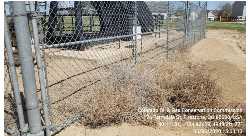
Photo 4 dead weeds around WH/PU fencing