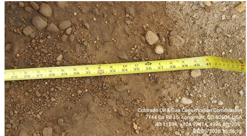
Photo 16 Stained soil approximately 3' wide