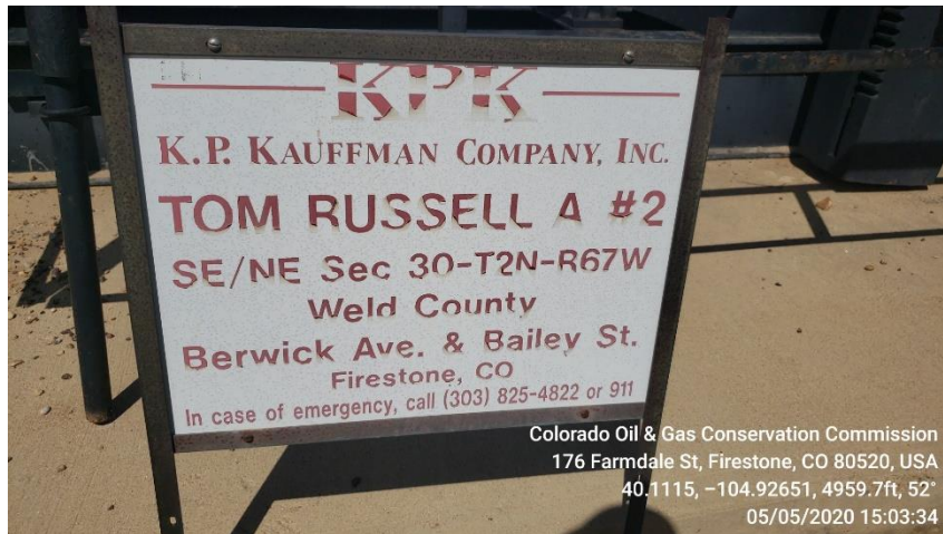
Photo 1 WH sign