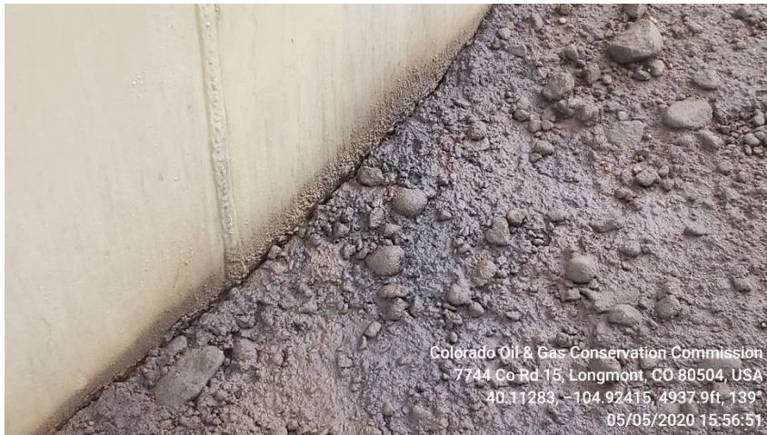
Photo 15 East crude oil tank appears to be leaking