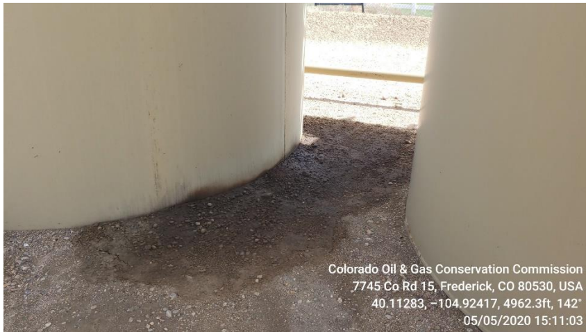
Photo 13 Stained soil between crude oil tanks