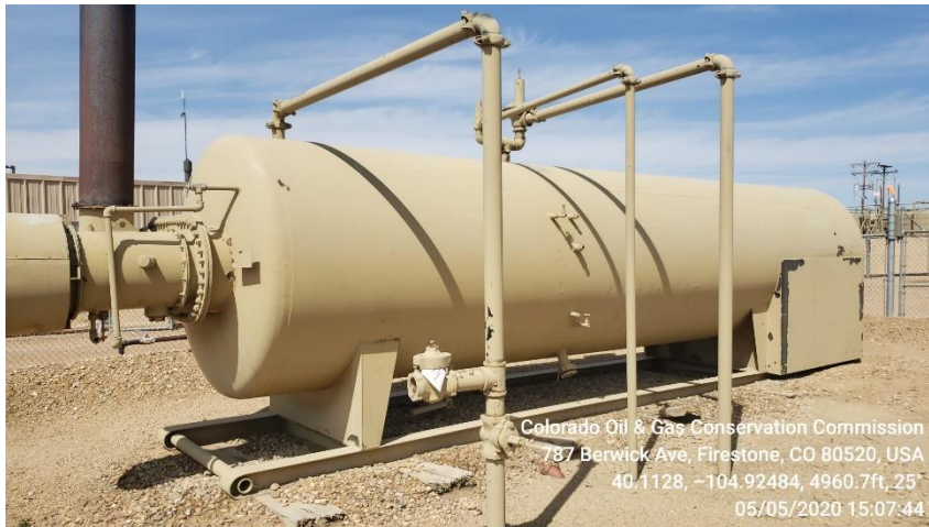
Photo 11 Horizontal Heated separator