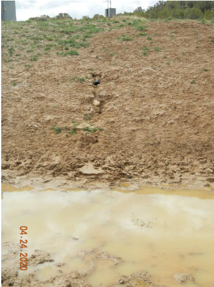
Photo#8: Fill slope and BMPs being de-stabilized, not functioning.