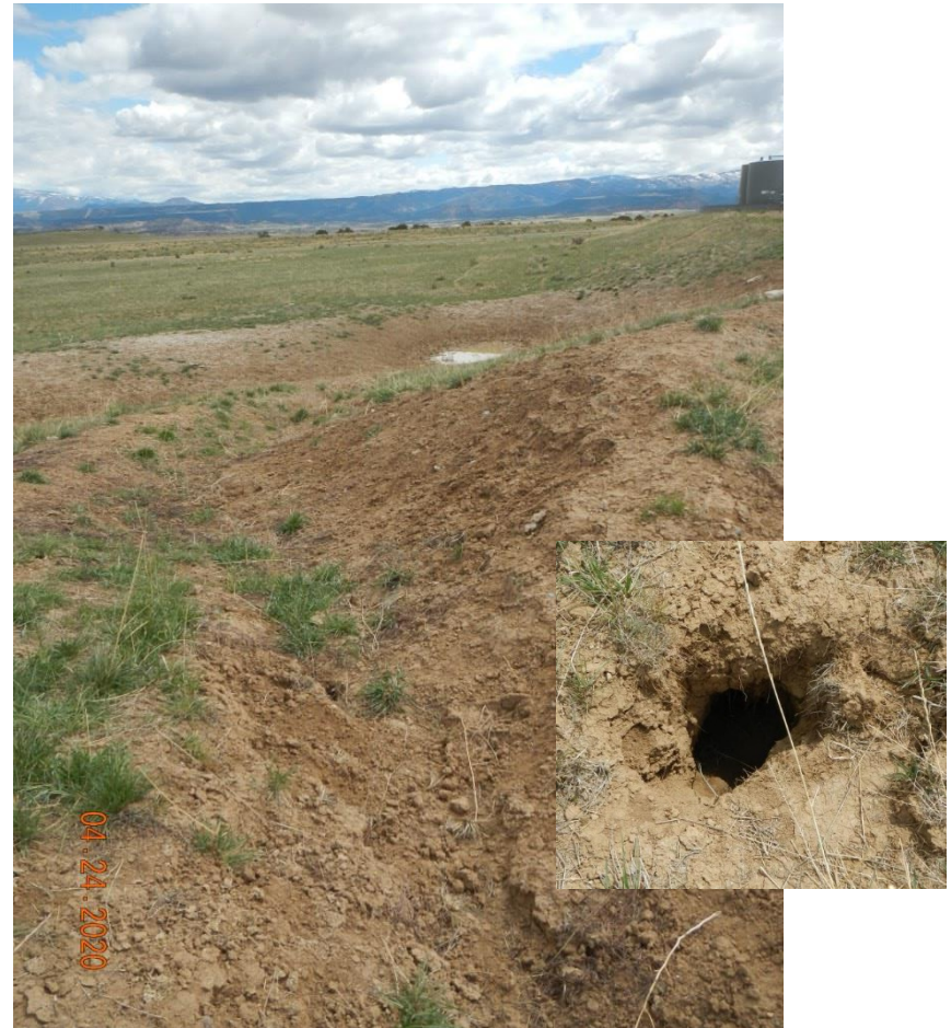
Photo#7: Fill slope and BMPs being de-stabilized, not functioning.