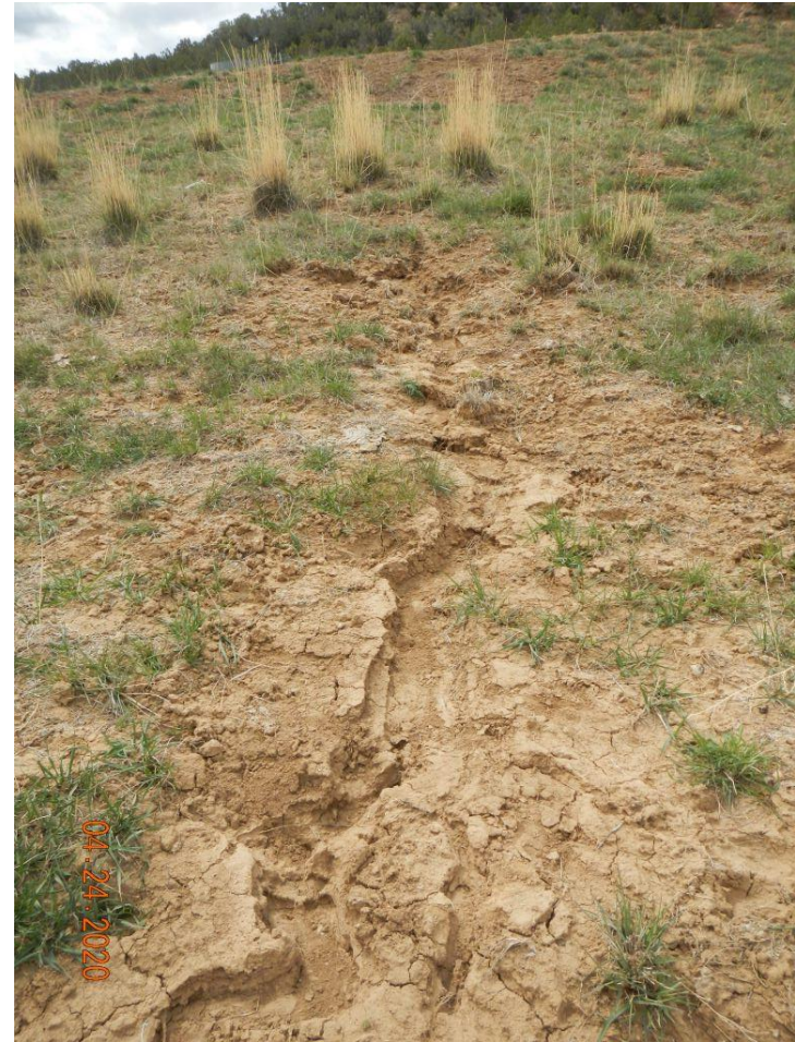
Photo#9: Fill slope and BMPs being de-stabilized, not functioning.