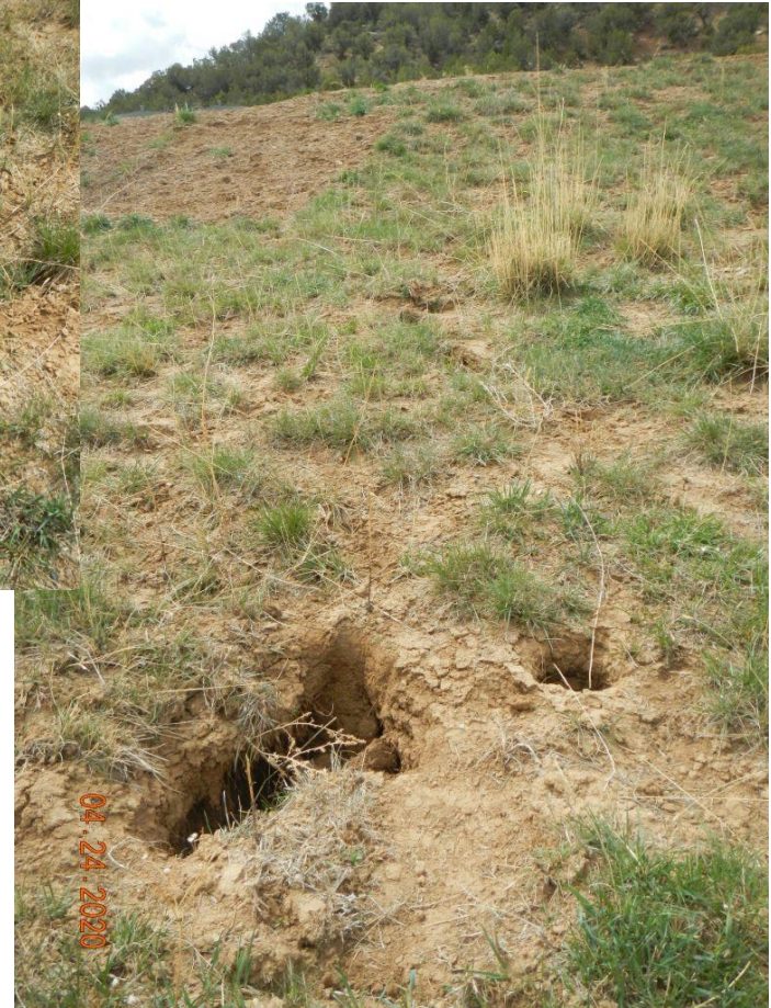
Photo#10: Fill slope and BMPs being de-stabilized, not functioning.