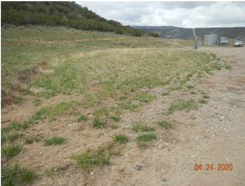
Photo#2: Area no longer needed for use re-vegetated on adjacent Location.