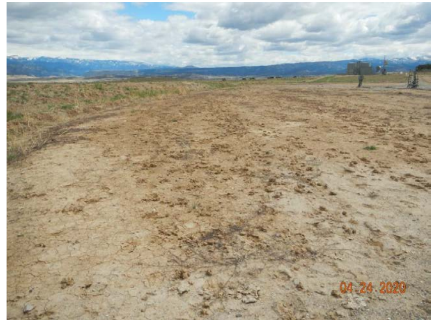
Photo#3: Area no longer needed for use, not re-vegetated on subject Location.