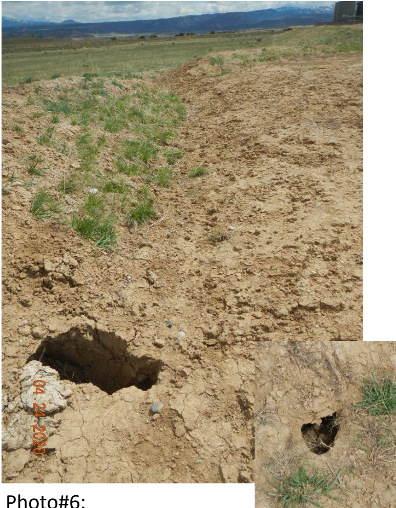
Photo#6: Fill slope and BMPs being de-stabilized, not functioning.