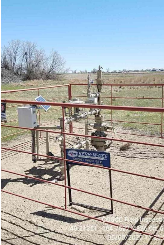
05-123-08051 DWIGHT SARCHET GAS UNIT

Location ID, Name: 317964, DWIGHT SARCHET GAS UNIT-63N66W22SWNE