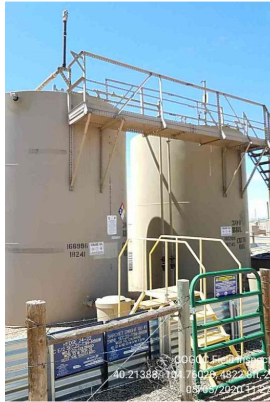
Photo 2 Battery