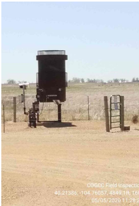
Photo 4 ECD

Location ID, Name: 317964, DWIGHT SARCHET GAS UNIT-63N66W22SWNE