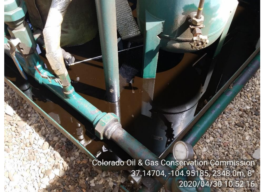
Colorado Oil & Gas Conservation Commission 37.14704, -104.95185, 2348.0m, 8° 2020/04/30 10:52:16

PHOTO 5: TRASH INSIDE COMPRESSOR SOUND WALLS. REMOVE ALL TRASH IN AND AROUND LOCATION. COMPLY WITH RULE 603.F. CA DATE 5-9-20.