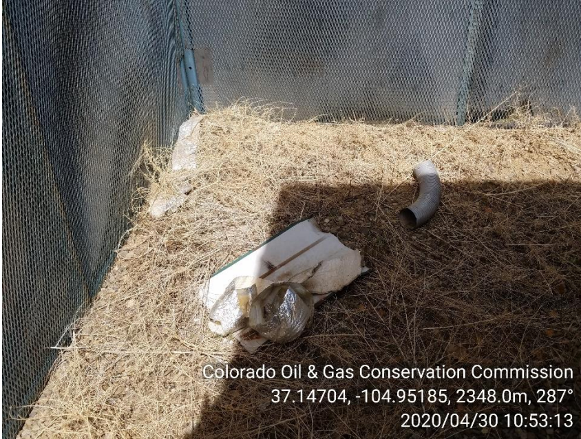
Colorado Oil & Gas Conservation Commission 37.14704, -104.95185, 2348.0m, 287° 2020/04/30 10:53:13