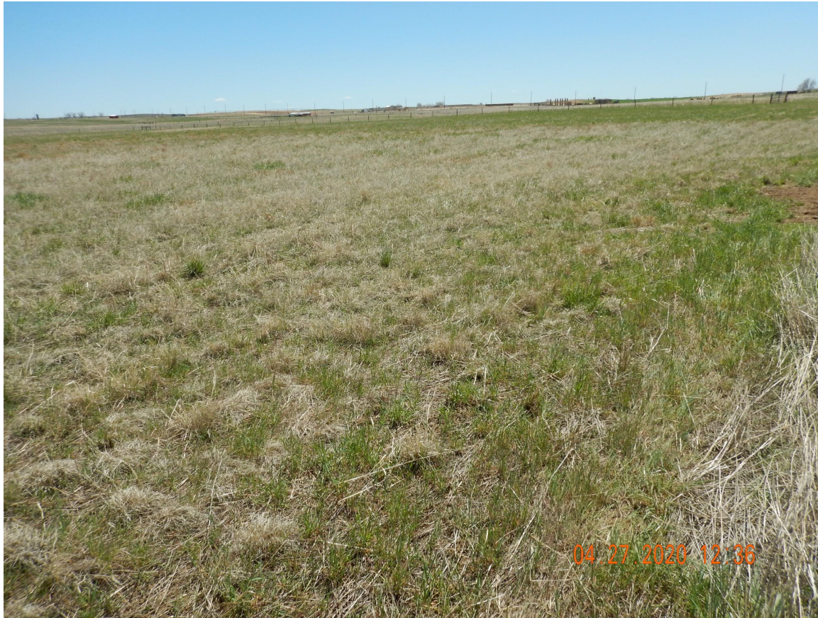
Photo 1. Photo taken from the western location, facing Southeast. Photo illustrates desirable, perennial plant species establishment is evident throughout the interim reclamation area. Some of the desirable species observed were: Bouteloua gracilis , Panicum virgatum , Calamovilfa longifolia , Thinopyrum intermedia , Pascopyrum smithii , and Dactylis glomerata .