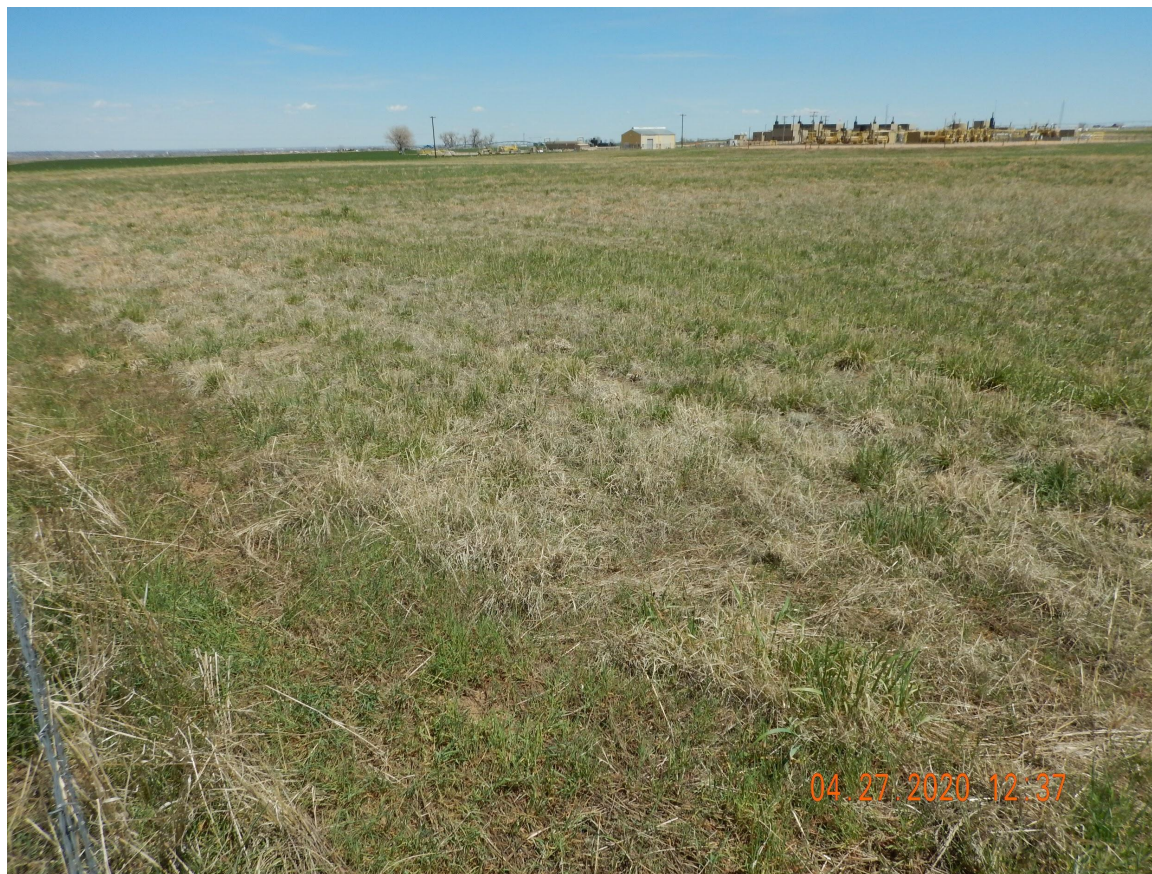
Photo 3. Photo taken from the western location, facing Northeast. See comments under Photo 1.