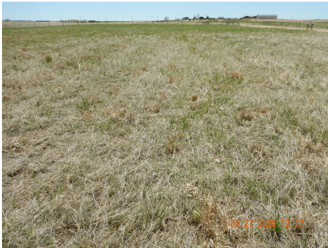
Photo 4. Photo taken from the eastern location, facing South. See comments under Photo 1.