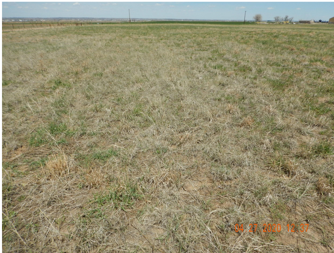
Photo 5. Photo taken from the eastern location, facing North. See comments under Photo 1.