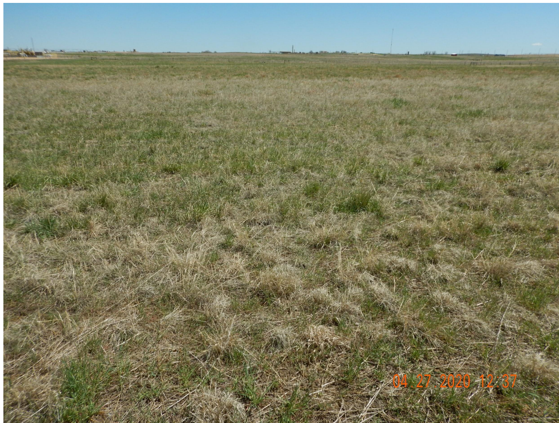
Photo 2. Photo taken from the western location, facing East. See comments under Photo 1.