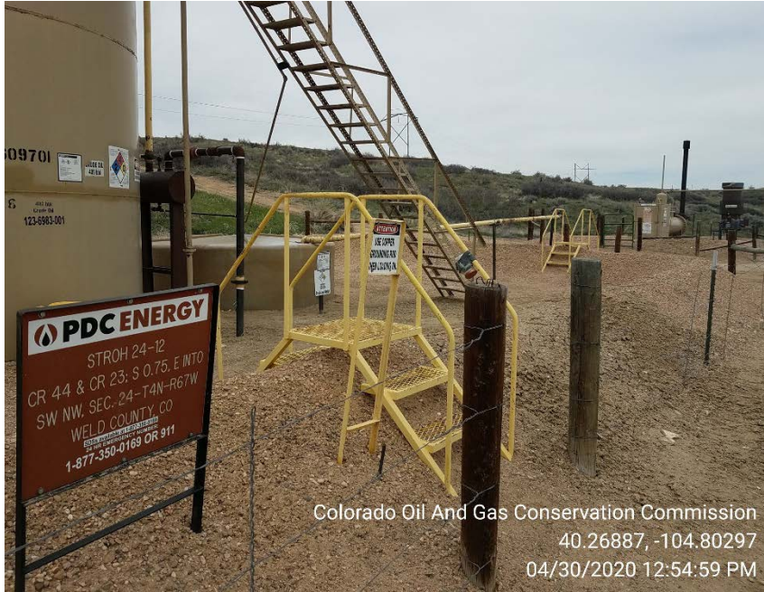
Colorado Oil And Gas Conservation Commission 40.26887, -104.80297 04/30/2020 12:54:59 PM