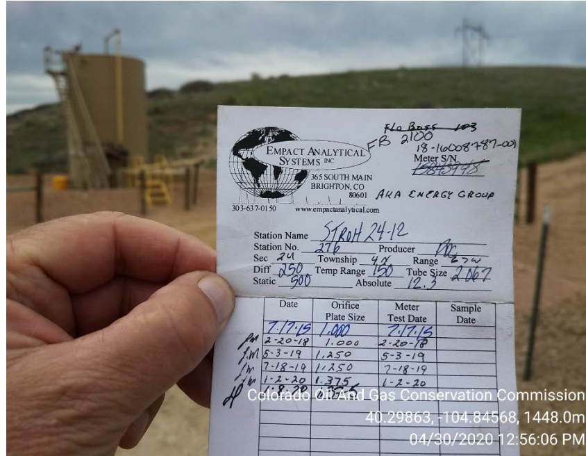
Meter calibration card