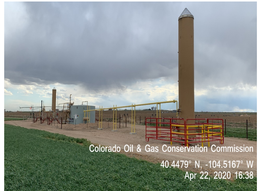
Colorado Oil & Gas Conservation Commission 40.4479° N, -104.5167° W Apr 22, 2020 16:38

Sharkey 32-35 (05-123-22859) Wellsite Producing | PR