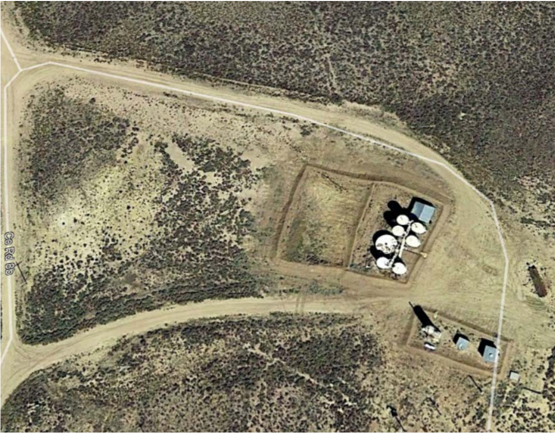
Photo #1 Aerial Photo, provided to give context to photos. Berm west of tanks separates the tank battery from lower level secondary containment.

Inspection Photos Spill Fac ID 473059 Inspection Date: 4/10/2020