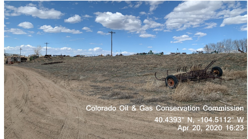
Colorado Oil & Gas Conservation Commission 40.4393° N, -104.5112° W Apr 20, 2020 16:23

Hoffner 44-35 (05-123-22832) Wellsite Temporarily Abandoned | TA