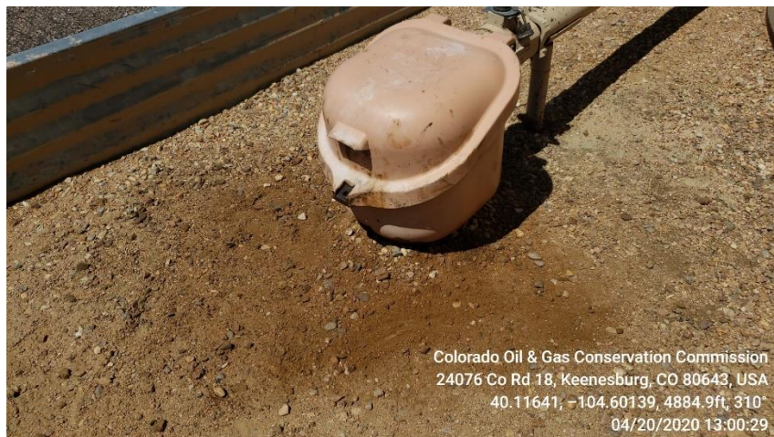
Photo 13 Stained soil by fill line at tank battery.