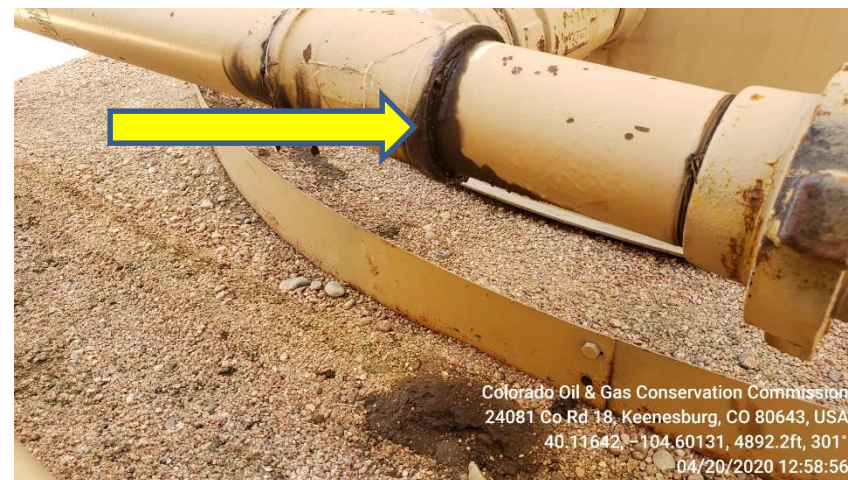
Photo 16 Stained soil by fill line at tank battery, possible leak