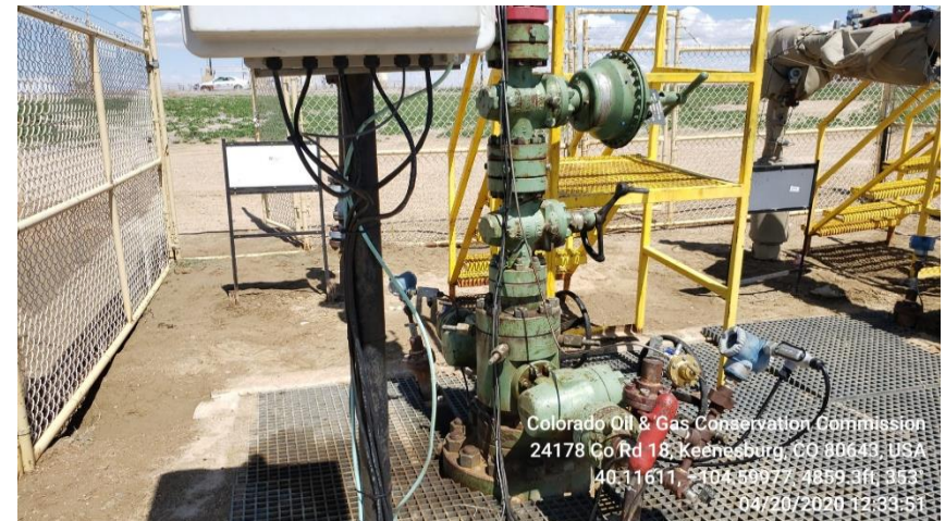
Photo 2 WH