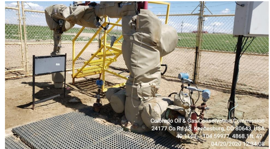
Photo 4 WH