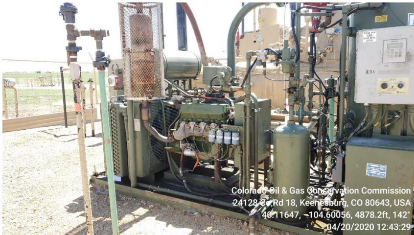
Photo 9 Compressor