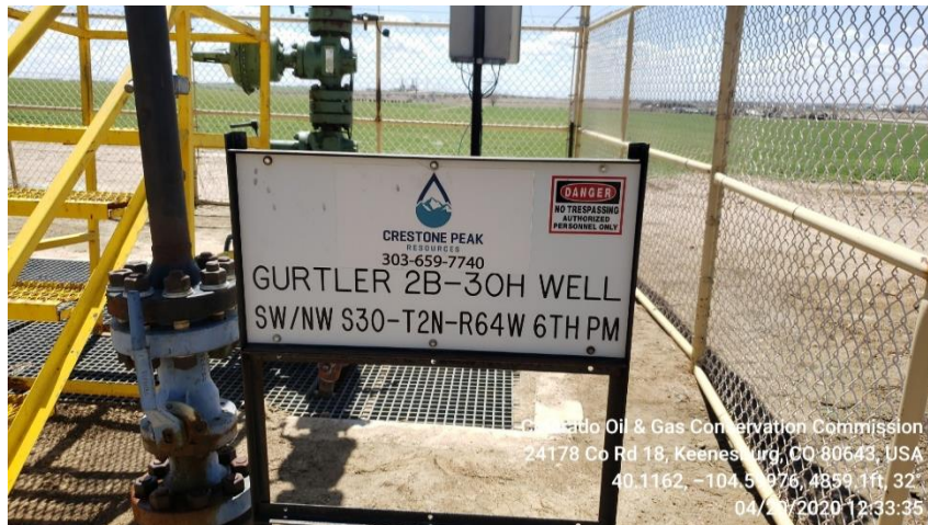
Photo 1 WH sign