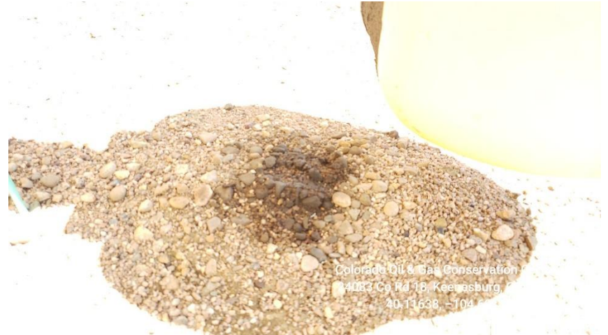
Photo 12 Stained soil by fill line at tank battery.