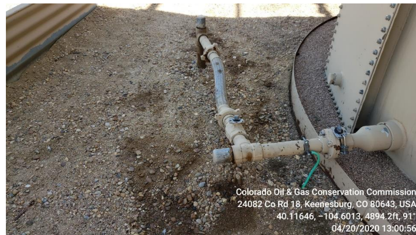
Photo 14 Stained soil by fill line at tank battery.