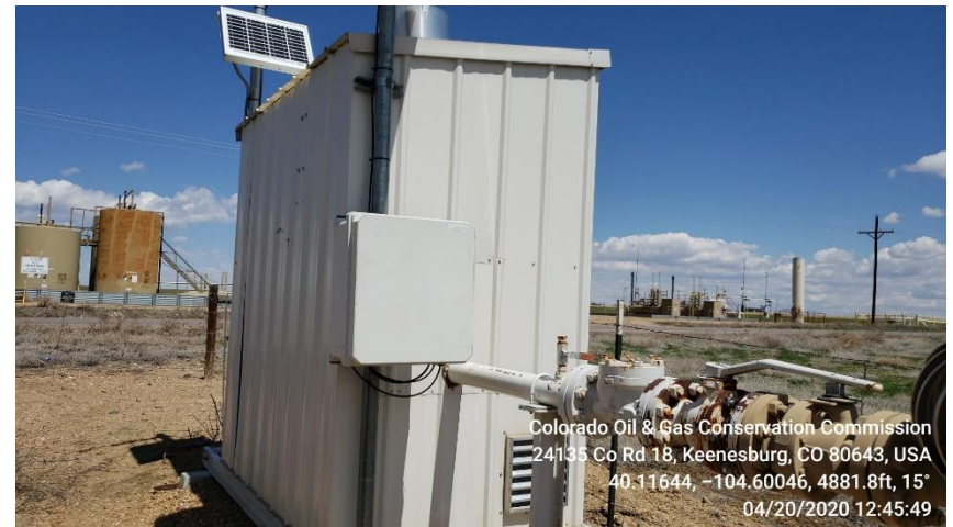
Photo 10 Gas meter run