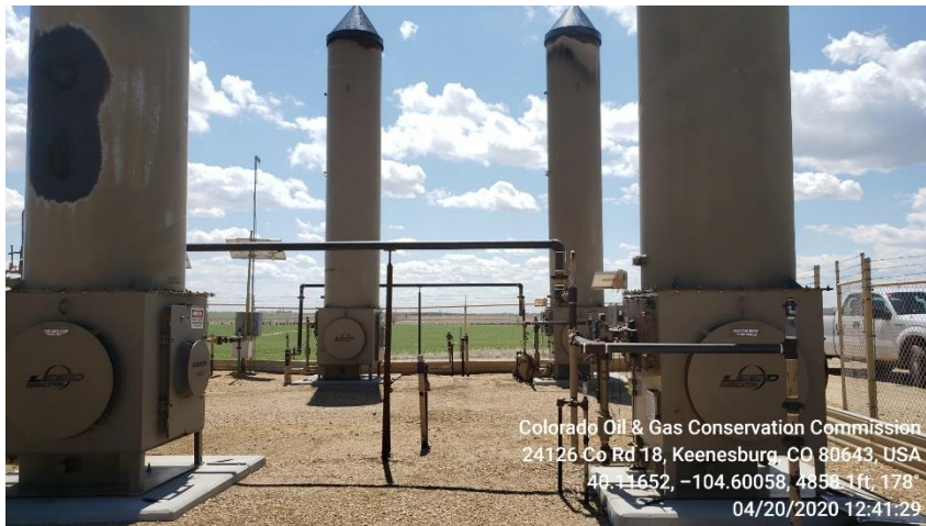
Photo 7 ECDs