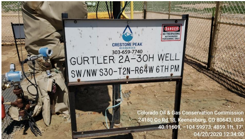
Photo 3 WH sign