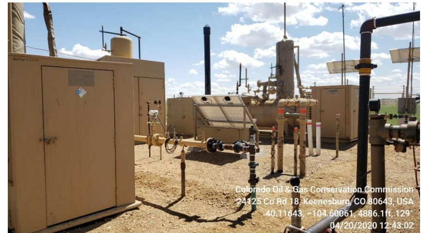
Photo 8 Heated horiz.sep. and vertical sep.