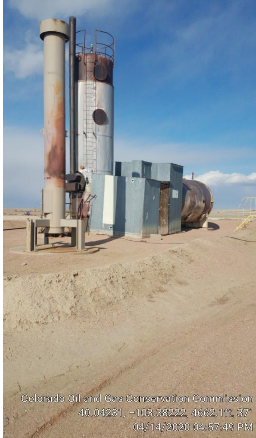
Colorado Oil and Gas Conservation Commission 40.04281, -103.38222, 4662.1ft, 37° 04/14/2020 04:57:49 PM