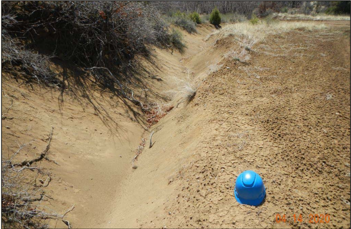
Photo 8. View of roadside ditch along access, that is not stabilized. Significant downcutting is observed, as ditch is approximately 4 feet wide and deep.