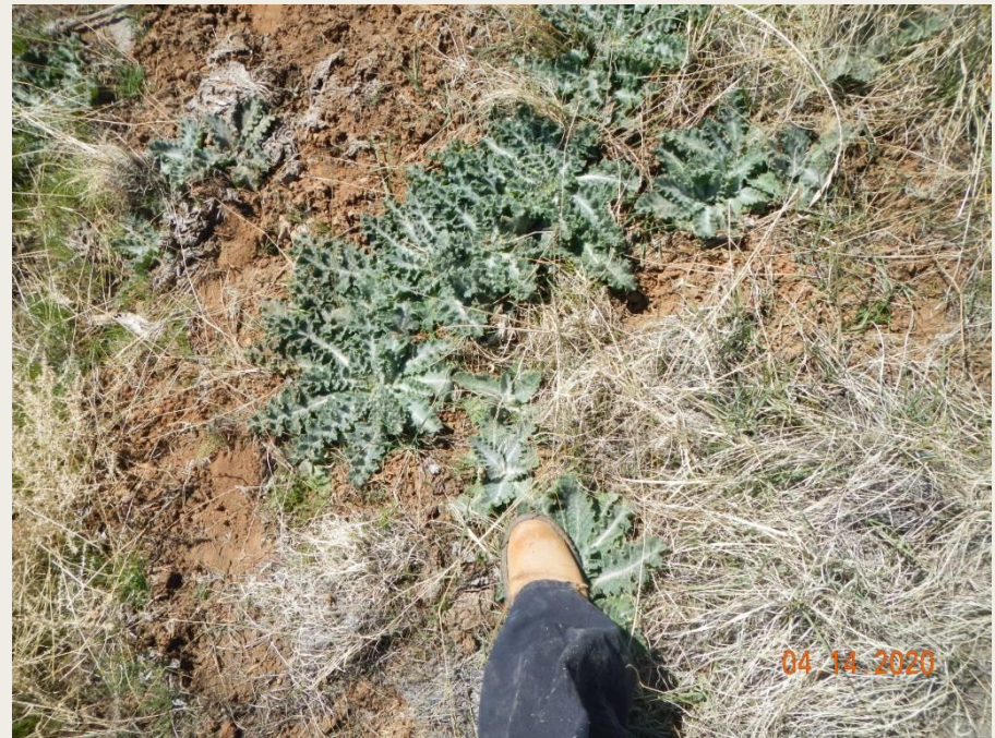
Photos 9/10. View of Scotch thistles within the project area, also observed along access. Approximately 300 individuals observed.