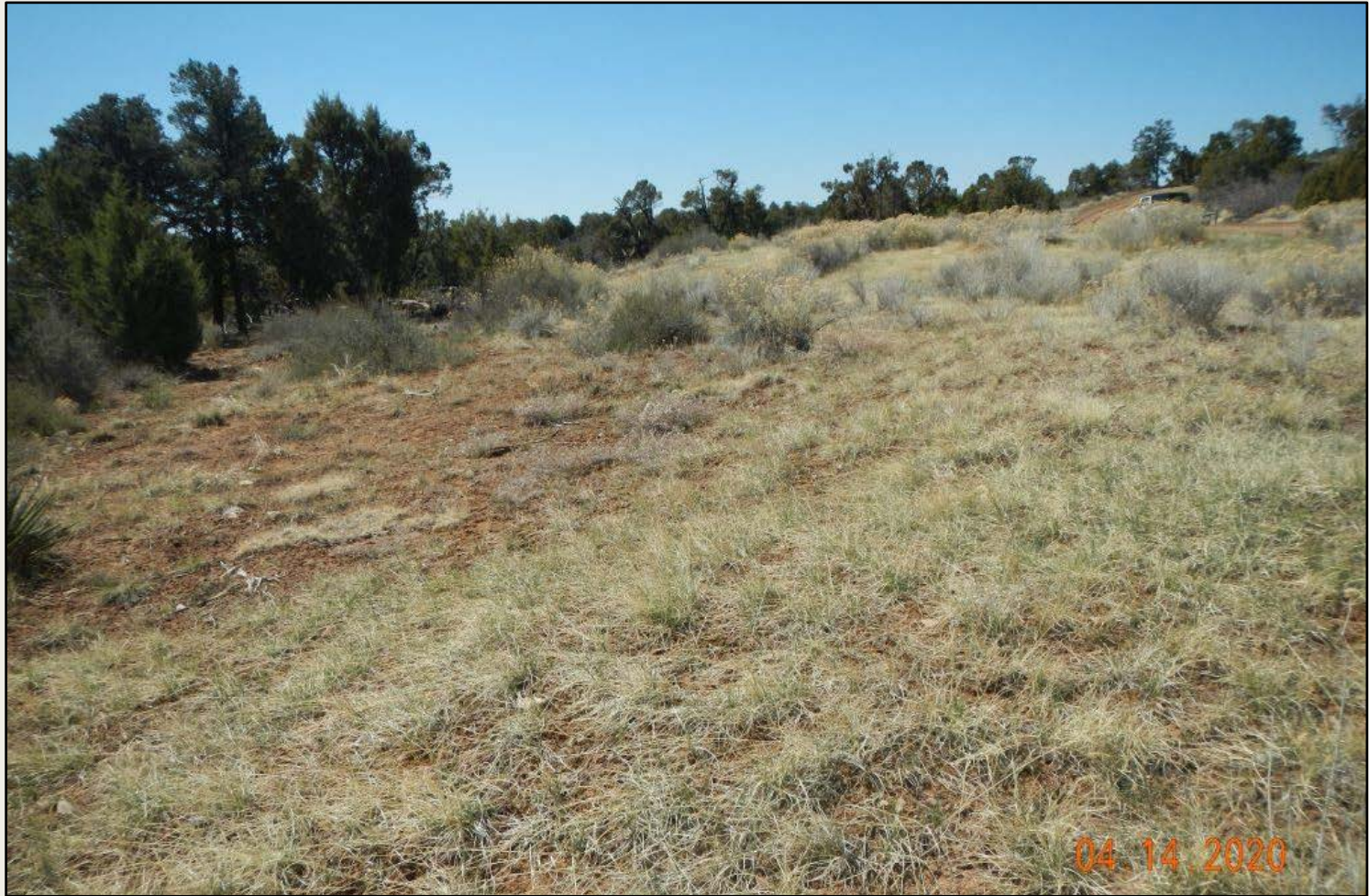
Photo 2. View of the eastern fill slope from the northeastern corner facing southward. Revegetation is progressing here with grasses and shrubs such as western wheatgrass, and rubber rabbitbrush.