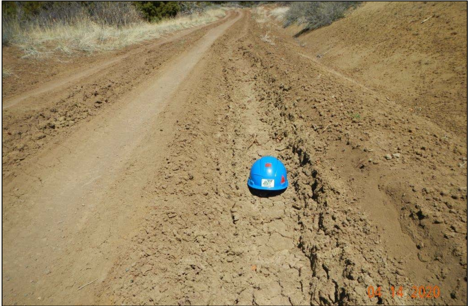
Photo 7. View of rutting on the access road, approximately 1.5 feet deep.