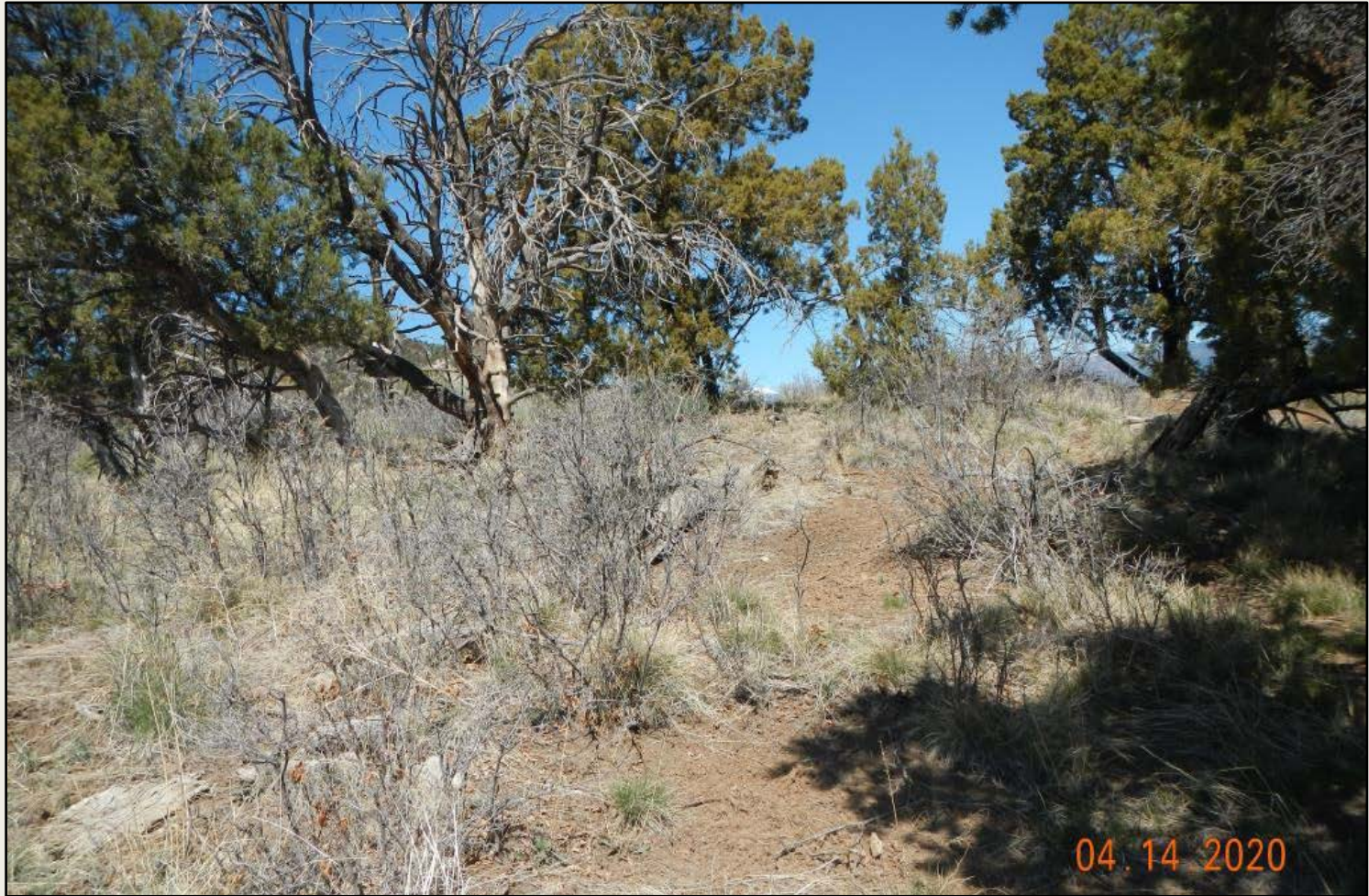
Photo 11. View of reference area, comprised of pinyon-juniper woodland with understory of gambel oak and mountain mahogany with grasses such as Arizona fescue.