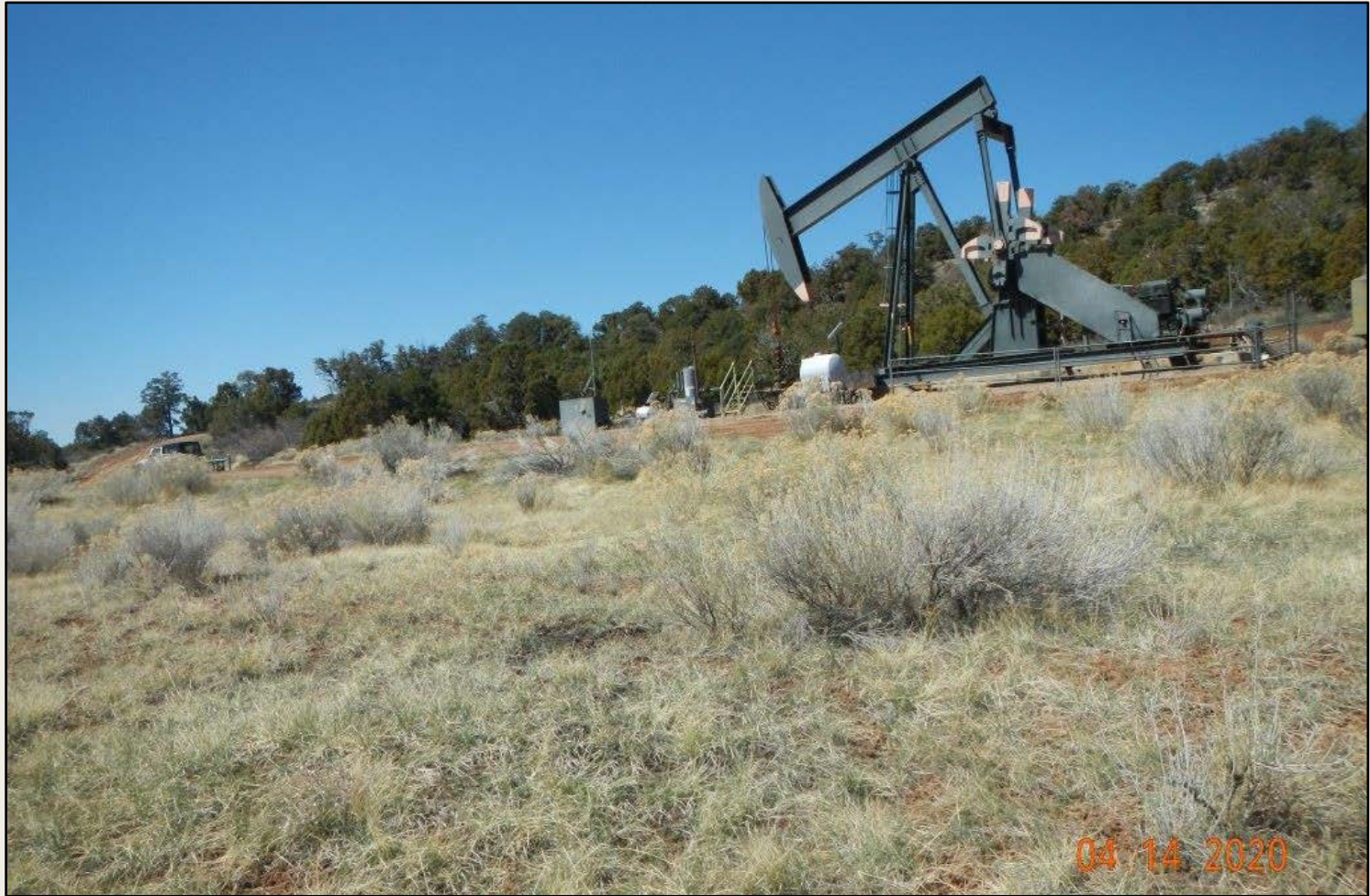
Photo 1. View of the project area from the northeastern corner facing center.