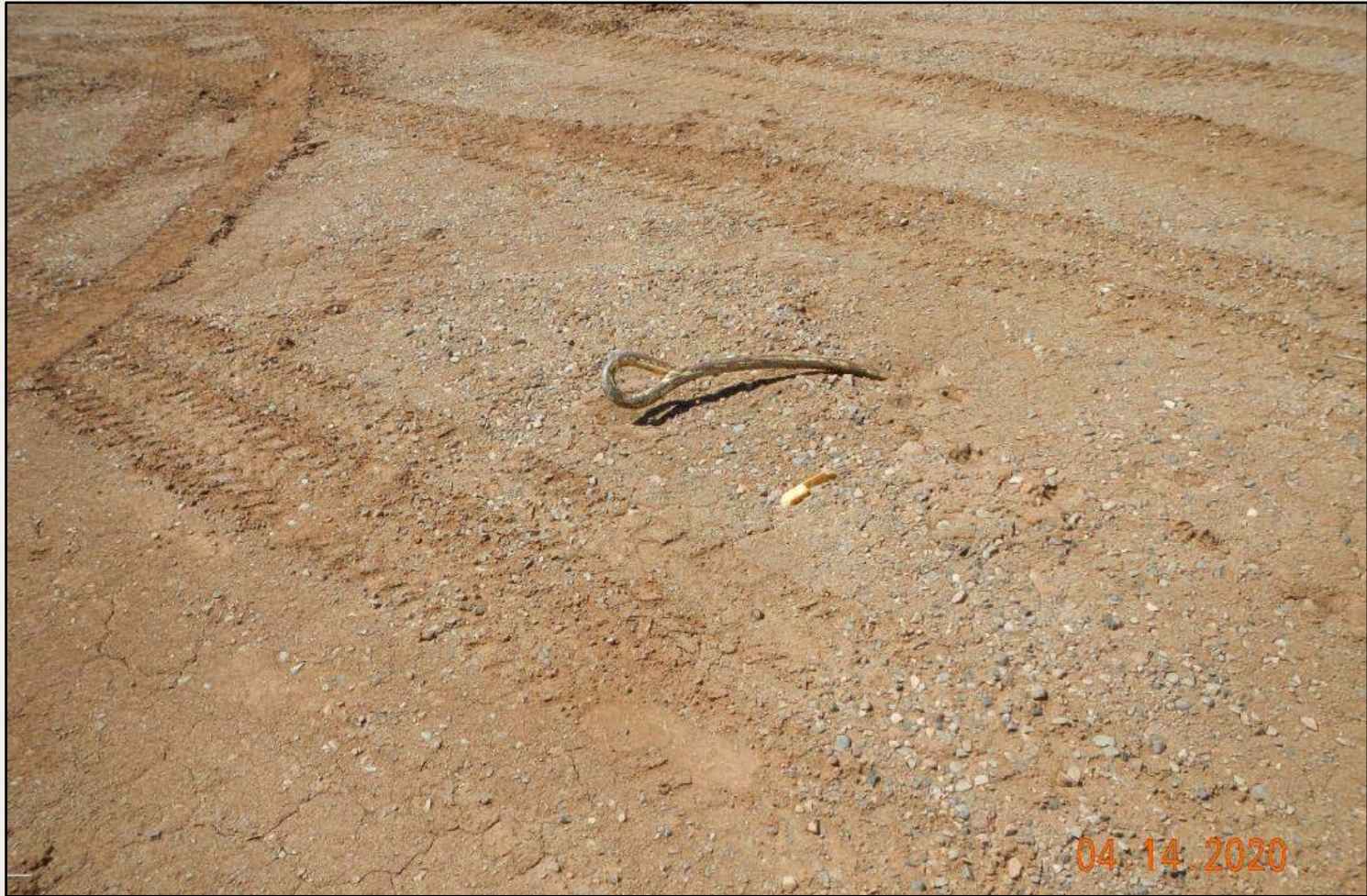
Photo 4. View of unmarked rig anchor on the well pad.