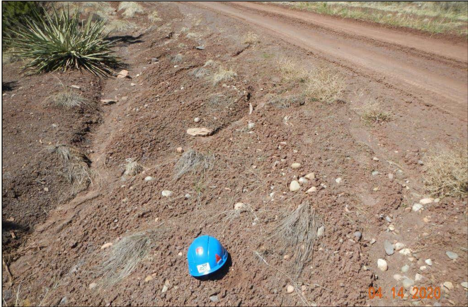
Photo 5. View of erosional rilling and channeling, approximately 2 feet wide and deep, occurring along the access road. Hard hat in place for scale reference.