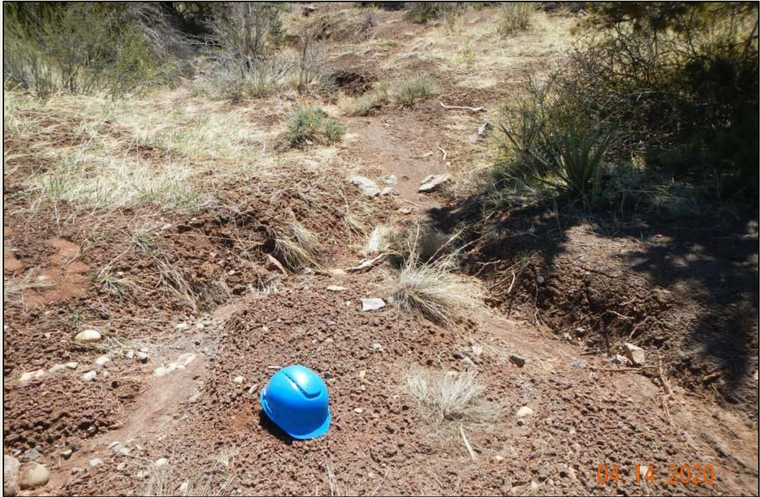
Photo 6. View of area downstream from photo 5 where erosional channeling is occurring from diverted stormwater flowing off of the access road.