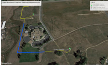
Grant Brothers Battery Flowlines.jpg 921K