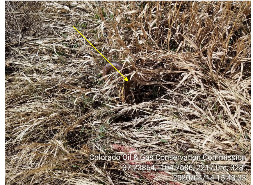
PHOTO 8: GUYLINE MARKER IN DOWN. Install proper guy line markers per Rule 1003.a CA DATE 5-14-20.