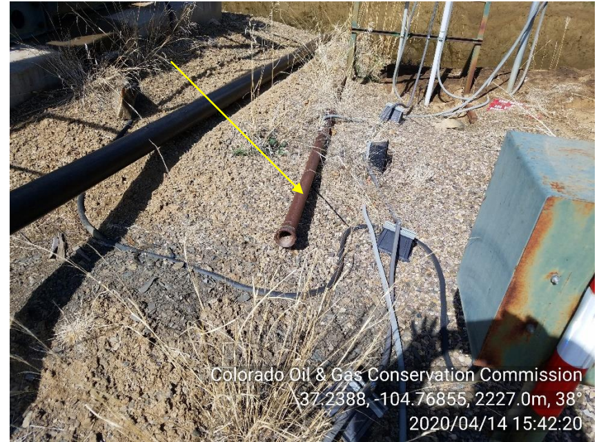
PHOTO 5: UNUSED EQUIPMENT STORED ON LOCATION. REMOVE UNUSED EQUIPMENT ACCORDING TO RULE 603.f. CA DATE 5-14-20

PHOTO 6: UNUSED EQUIPMENT STORED ON LOCATION. REMOVE UNUSED EQUIPMENT ACCORDING TO RULE 603.f. CA DATE 5-14-20