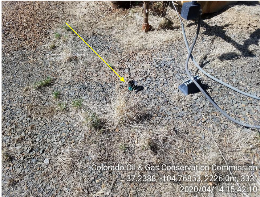
PHOTO 7: TRASH ON LOCATION. PICK UP ALL TRASH ON LOCATION ACCORDING TO RULE 603.f. CA DATE 5-14-20