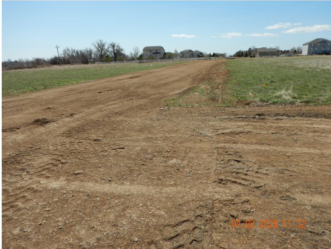
Photo 3. Photo taken east of the well and tank battery location, facing South. Photo illustrates a pipeline has been recently installed which has used a portion of the original access road- see Photo 4.