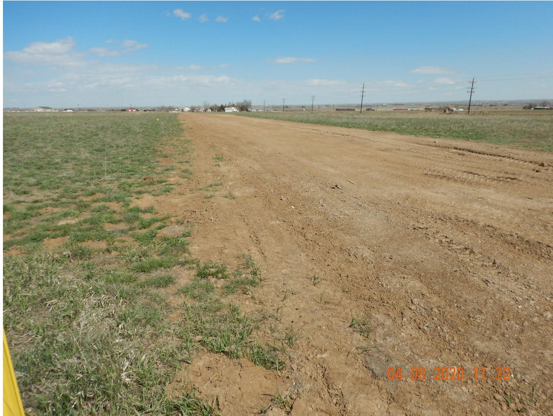
Photo 5. Photo taken east of the well and tank battery location, facing North. See comments under Photo 3.