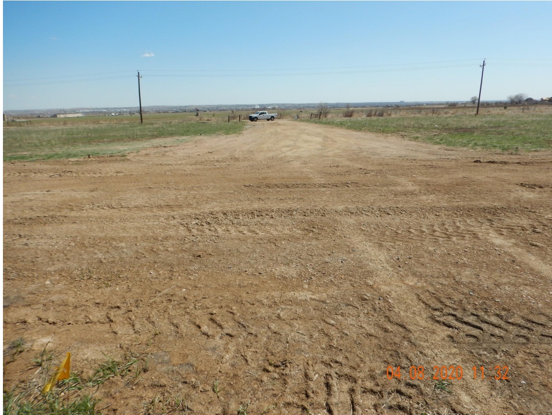
Photo 4. Photo taken east of the well and tank battery location, facing East. See comments under Photo 3.