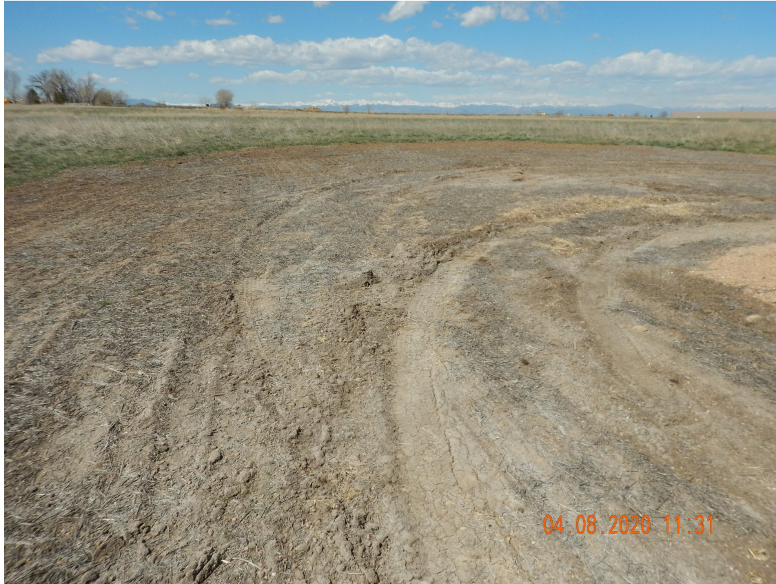
Photo 2. Photo taken from the southwestern well and tank battery location, facing West. Photo illustrates Operator has performed final reclamation activities throughout all other disturbance areas with the evidence of germination.