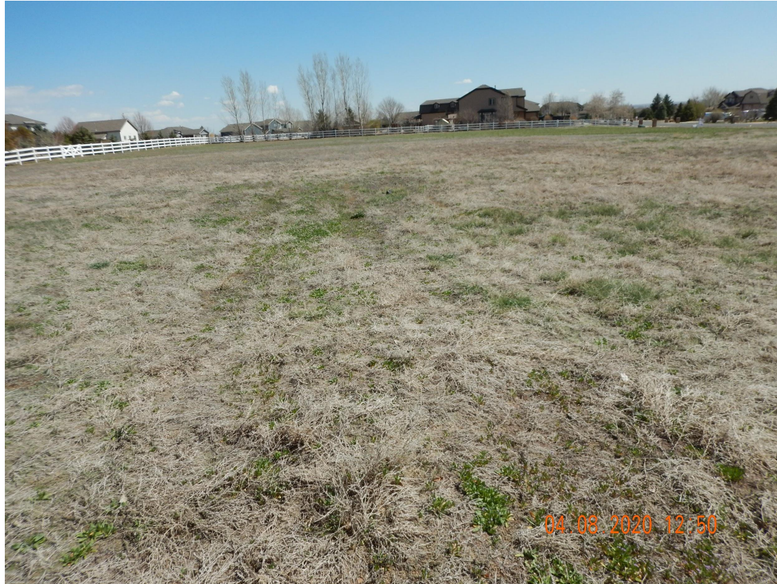
Photo 1. Photo taken from the western well and battery location, facing East. Photo illustrates all surface equipment has been removed. Location has not been reclaimed. Annual, weedy vegetation consisting mostly of tumbleweeds.