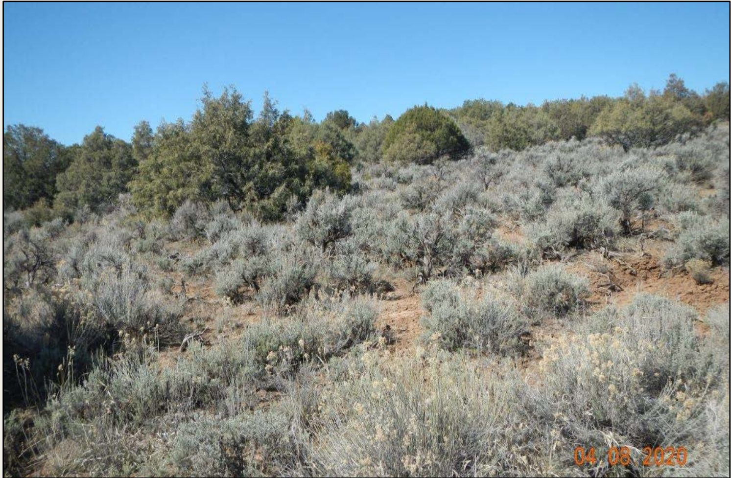
Photo 5. View of reference area comprised of open pinyon-juniper woodland with sagebrush shrubland understory.