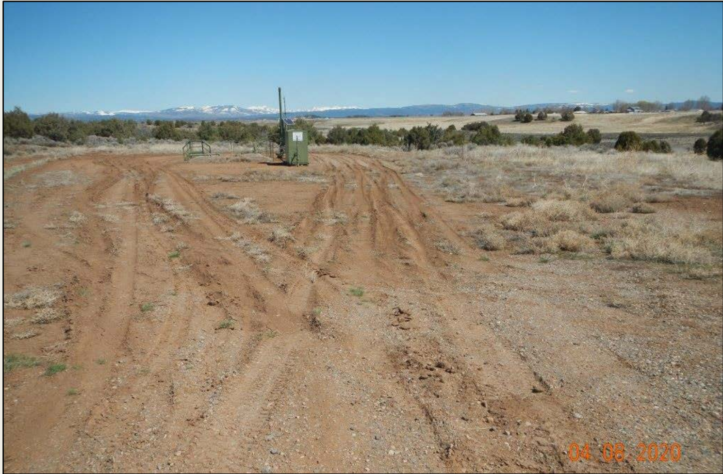
Photo 1. View of the project area from the well pad entrance facing center.