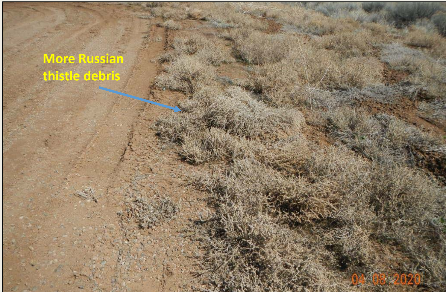
Photo 4. View of more Russian thistle debris along the eastern edge of the working area.