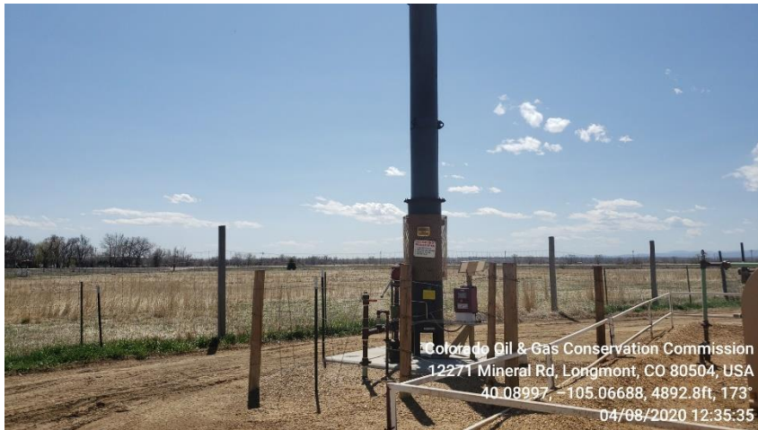
Photo 5 ECD.