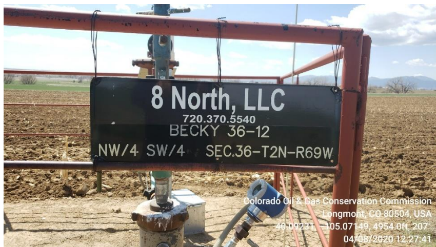
Photo 1 WH sign has old operator name.