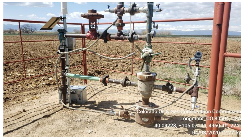
Photo 2 WH