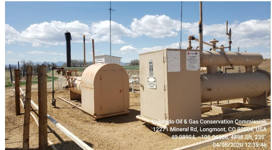
Photo 6 Horizontal heated separators