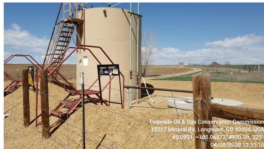
Photo 3 TB sign.