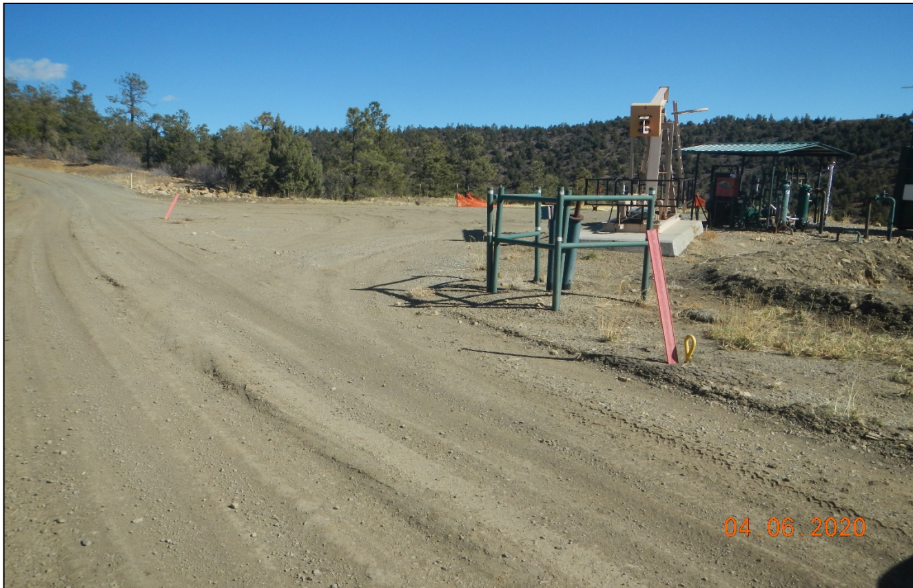
Photo 1. Facing northeast toward the location.