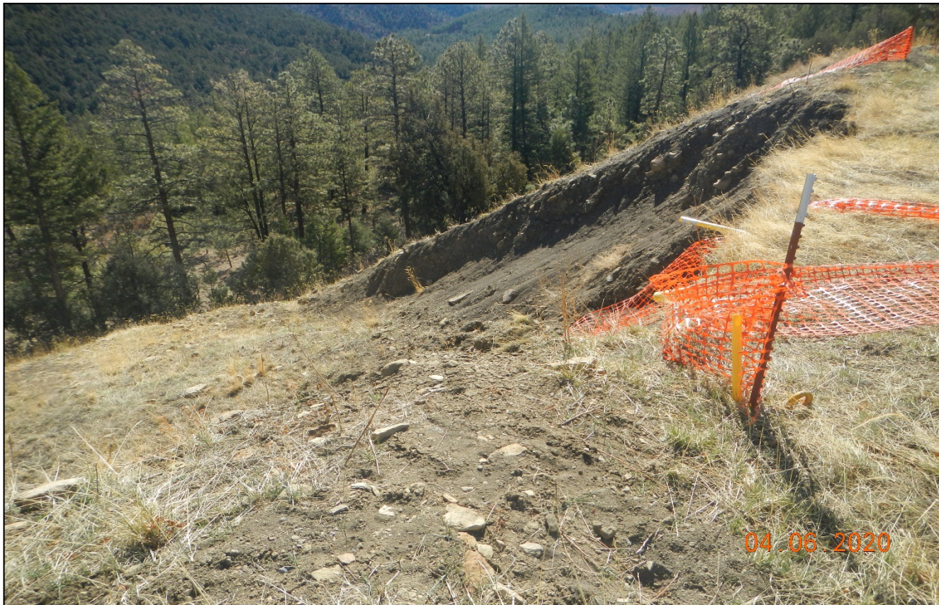
Photo 3. Facing southeast toward the fill slope which has sloughed.