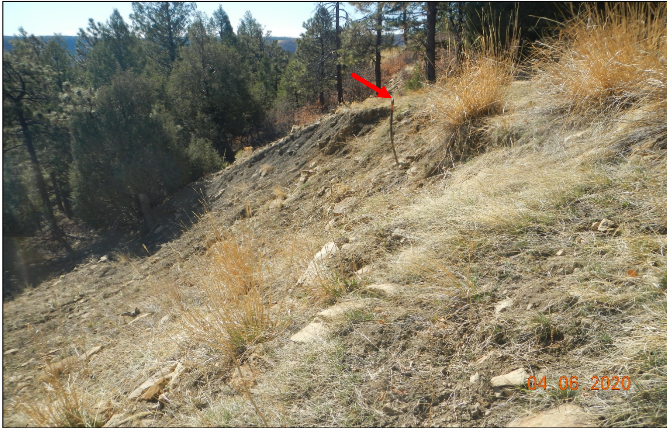
Photo 5. Facing toward the southeast side of the location. This area has also sloughed which has exposed the guyline anchor shown at arrow.