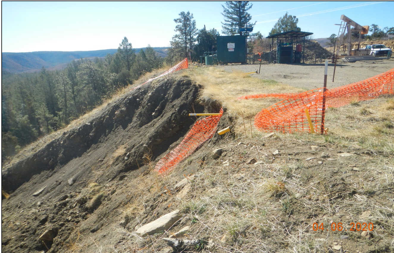
Photo 2. Facing south at the east side of the location. The area of soil slough has not been repaired. Safety fencing was installed in this area but is now degraded. Corrective action of previous inspection was not completed.