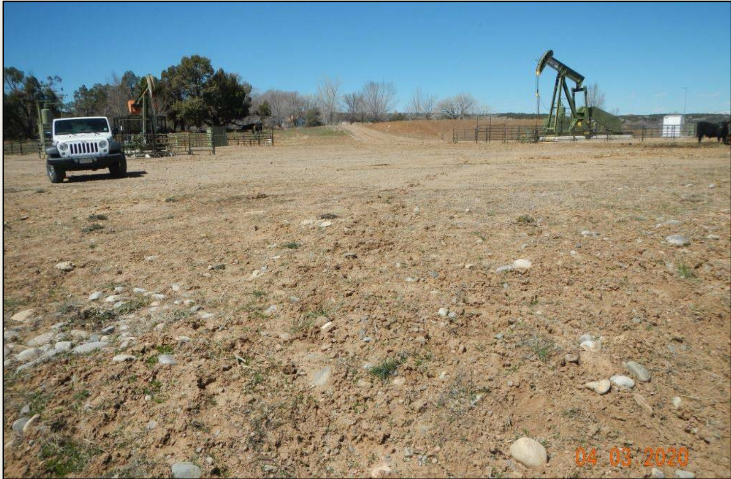
Photo 1. View of the project area from the southeastern corner facing center.