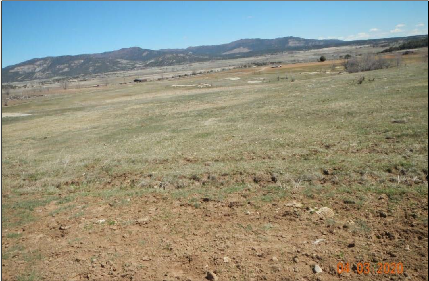
Photo 5. View of reference area vegetation, comprised of irrigated grass field, largely in grazed condition.