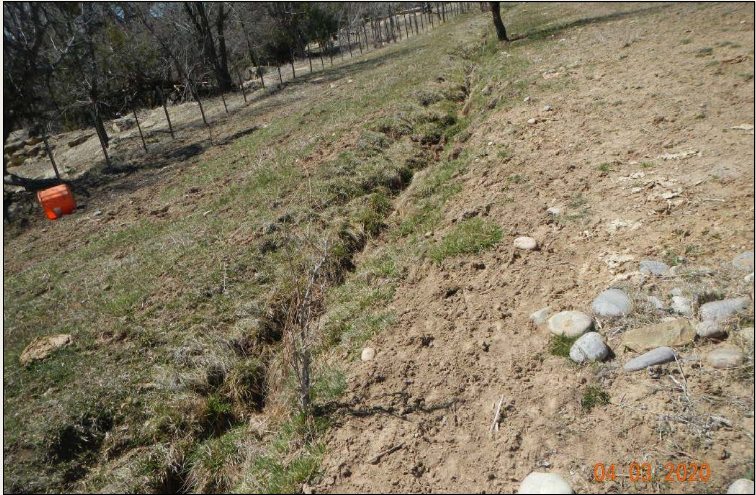
Photo 3. View of the southern project area from the southeastern edge facing westward. Irrigation ditch runs adjacent to southern edge of working area.