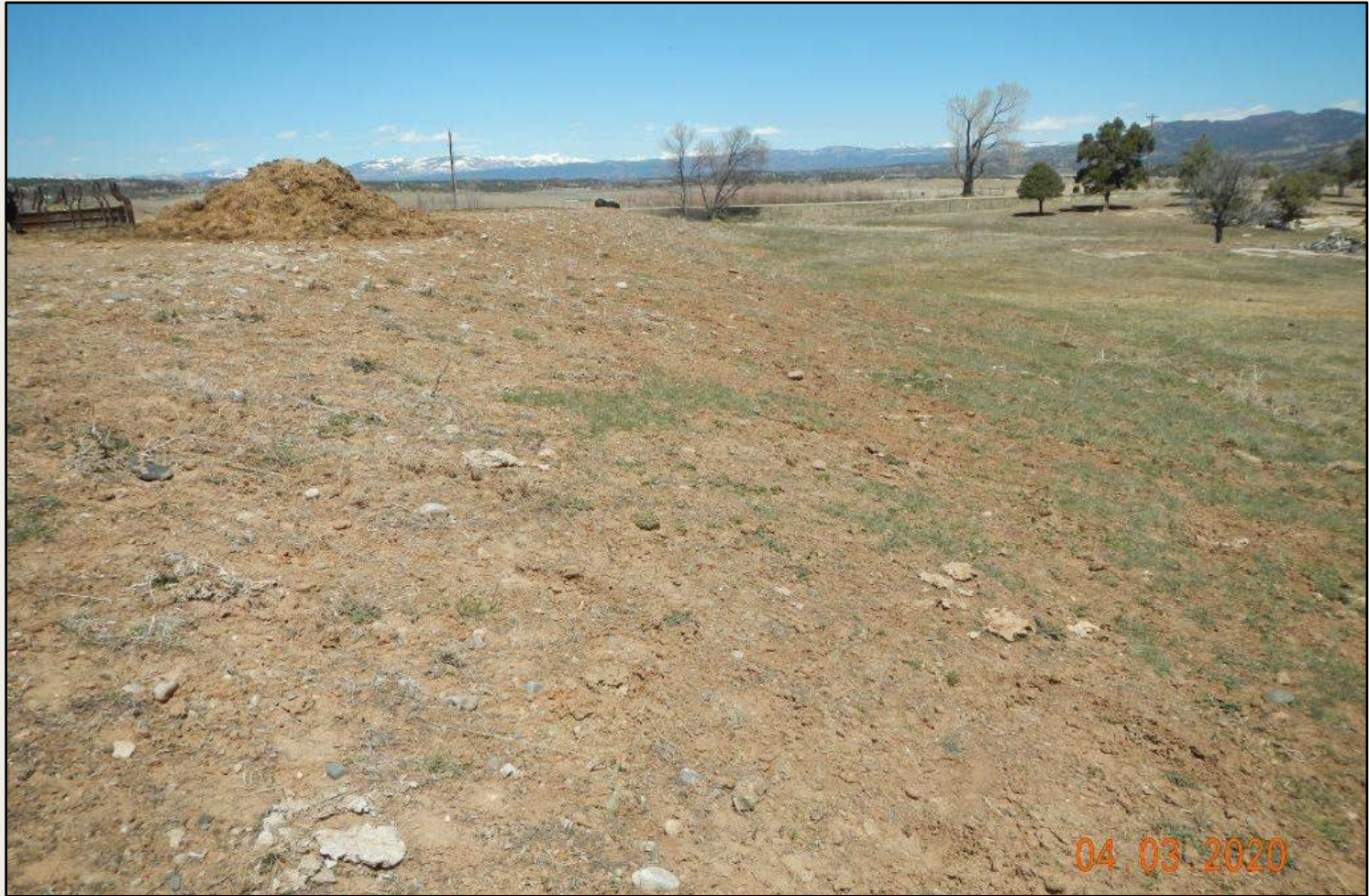
Photo 2. View of the eastern fill slope from the southeastern corner facing northward. Vegetation is grazed and in a condition similar to surrounding reference area.