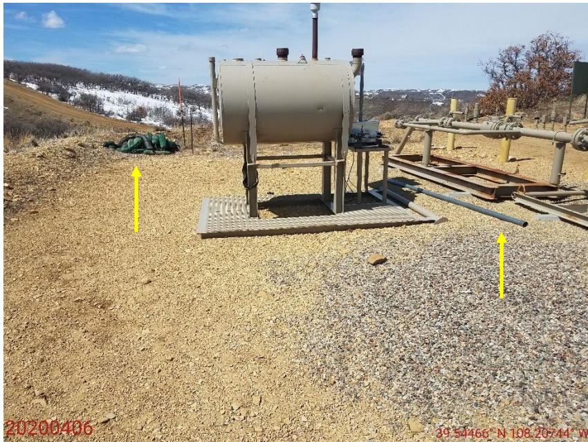
Photo 19: Photo taken from the southwest corner of the Location. Photo shows unused equipment (rock socks, pipe) being stored on the Location. Equipment/materials require removal and proper storage in accordance with 603.f