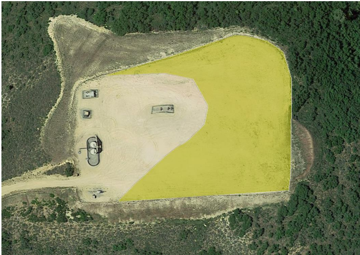
Photo 21: 2016 Google Earth Aerial imagery; most current available google earth imagery. Photo shows large areas (~1.8 acres) of the current production area that do not appear to be necessary for production activities, and require reclamation in accordance with Rule 1003.b.