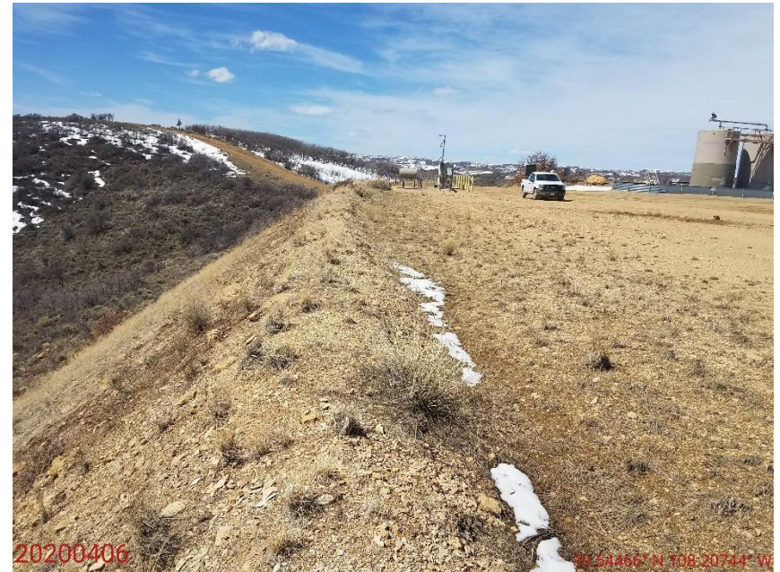
Photo 14: Photo taken from the south end of the pad facing west. Photos 14- 18 provide an overview of the Location from west, northwest, north, northeast to east. Photos show large areas of the current pad that do not appear to be necessary for production activities, and require reclamation.