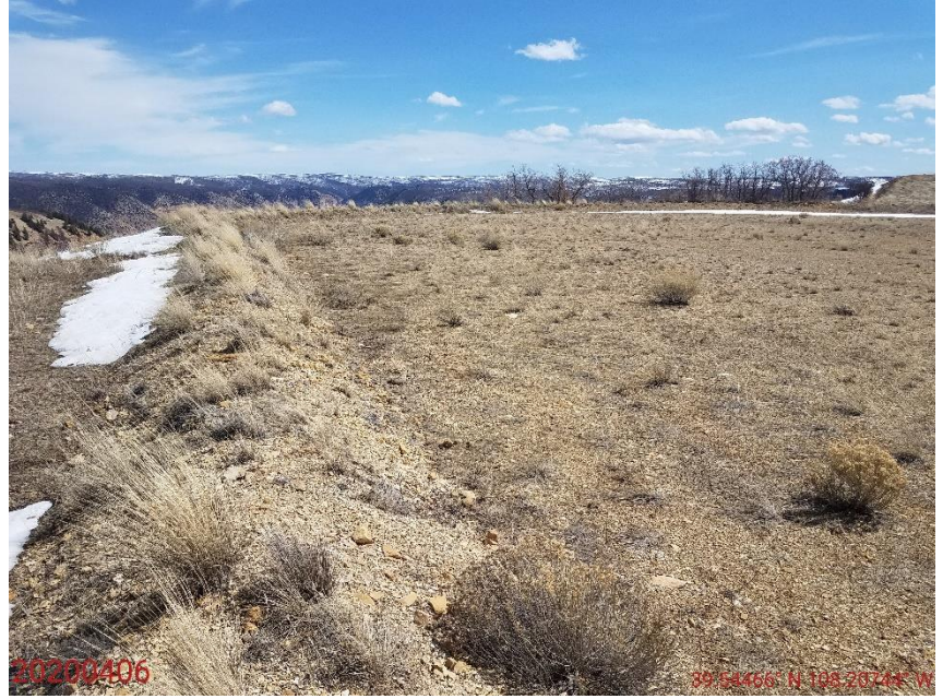
Photo 2: Photo taken from the north end of the Location, facing northeast. Photos 2-6 provide an overview of the Location from northeast, east, southeast, south, southwest to west. Photos show large areas of the current pad that do not appear to be necessary for production activities, and require reclamation.