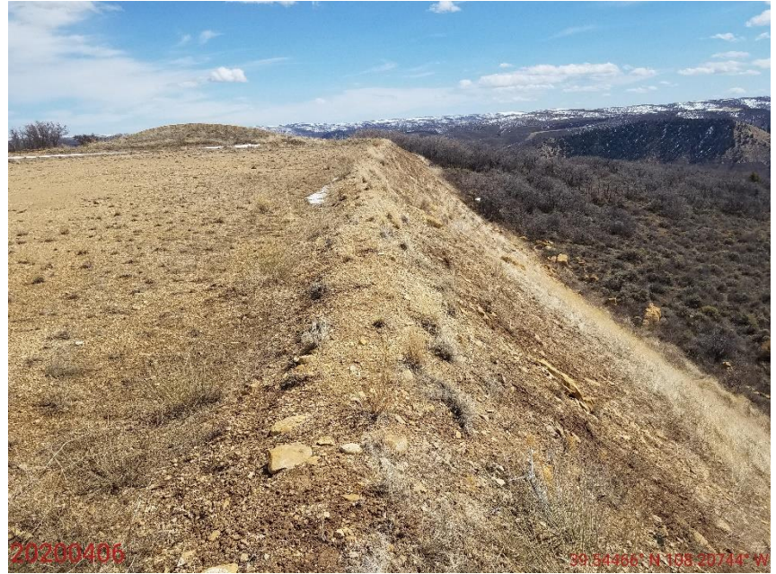
Photo 18: See comments under photo 14. Photo also shows fill areas of the Location that will require contouring and regrading to the former topography.