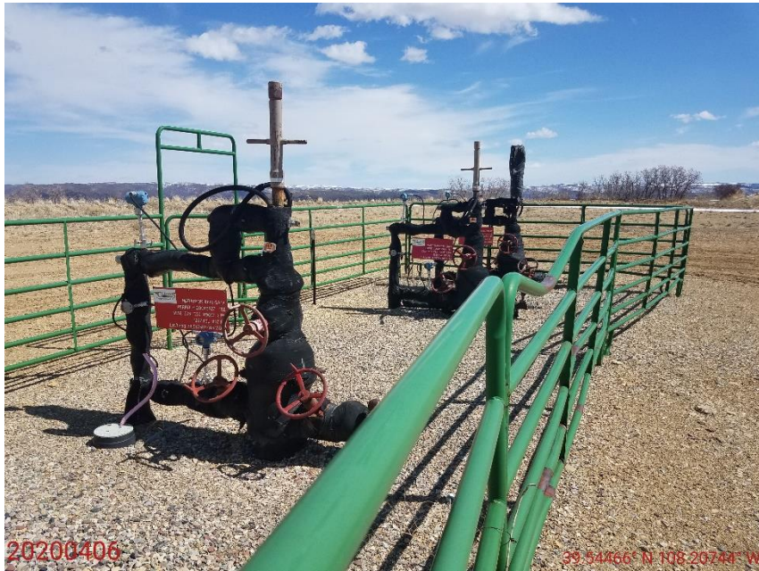
Photo 1: Photo shows the three (3) active wells on the Location. Records show well have produced since 2009.