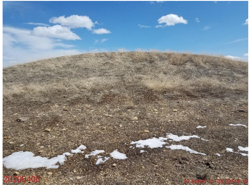
Photo 10: Photo taken from the southwest corner of the pad, facing east. Photo shows topsoil stockpile. Vegetation observed on the soil stockpile were predominantly undesirable weedy plant species such as Bromus tectorum in violation of Rule 1002.c