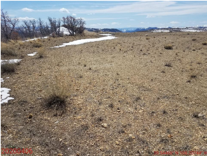
Photo 7: Photo taken from the northeast corner of the pad, facing south. Photos 7-9 provide an overview of the location from south, southwest to west. Photos show large areas of the current pad that do not appear to be necessary for production activities, and require reclamation.