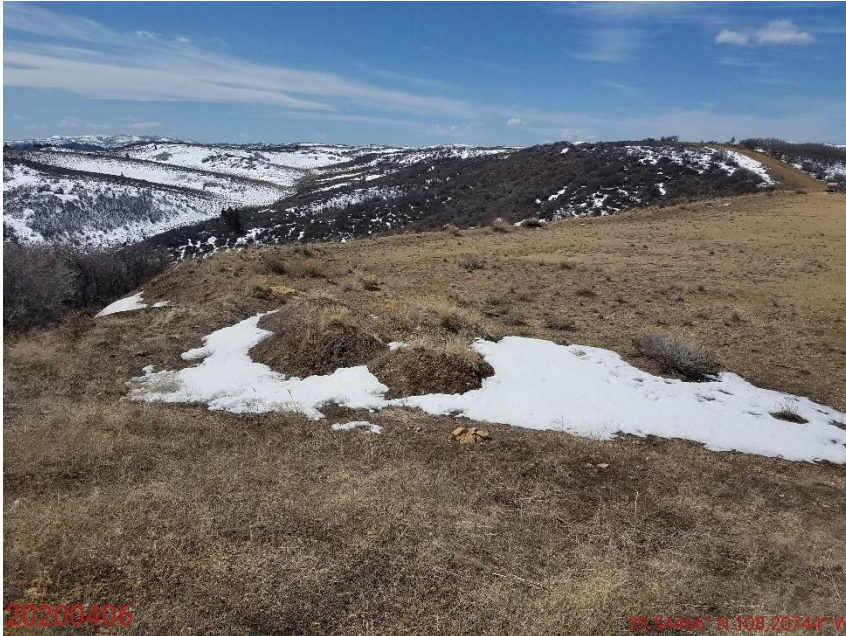
Photo 11: Photo taken from the southeast corner of the pad, facing southwest. Photos 11-13 provide an overview of the Location from southwest, west, to northwest. Photos show large areas of the current pad that do not appear to be necessary for production activities, and require reclamation.