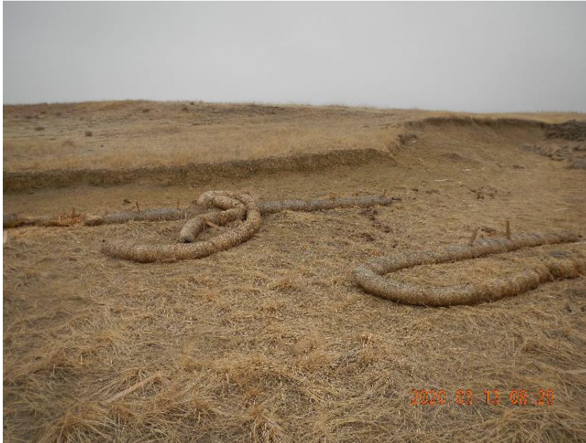
Photo 13: Erosion at entrance area to location Waddles pulled up by livestock.