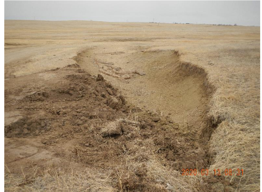
Photo 14: Washed out area at top of channel erosion. Placed additional fill as temp repair.