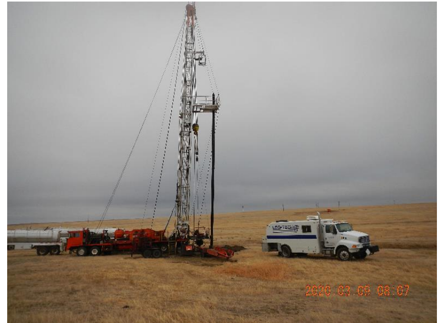
Photo 4: Wireline on location to run CBL, Perforate casing for cement plugs, and set CICR.