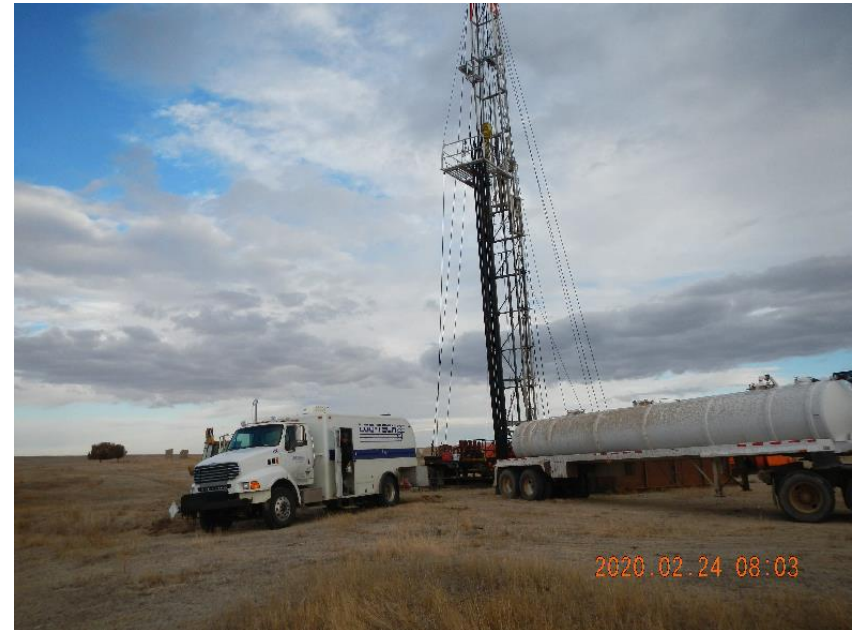
Photo 2: Wireline rigged into well to set CIBP, run CBL, and perforate well for cement plugging.