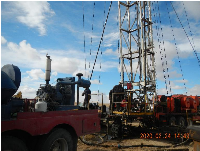
Photo 7: Rig crew tripping out tubing and stinger after pumping first cement plug.