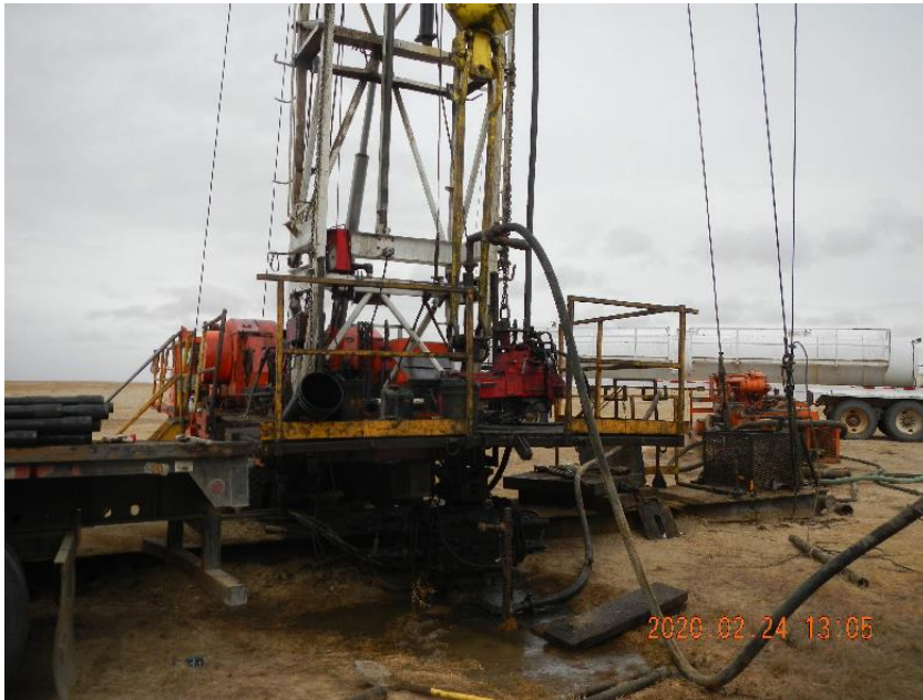
Photo 5: View of well with cement pump truck rigged in for cement job.