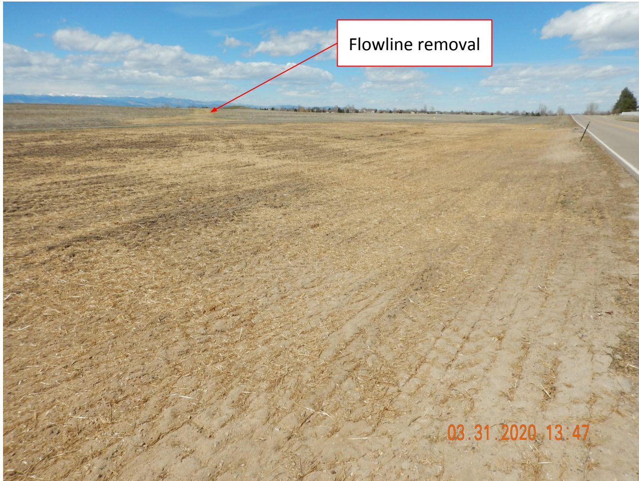
Photo 3. Photo taken from the associated offsite tank battery location, facing North. See comments under Photo 1.