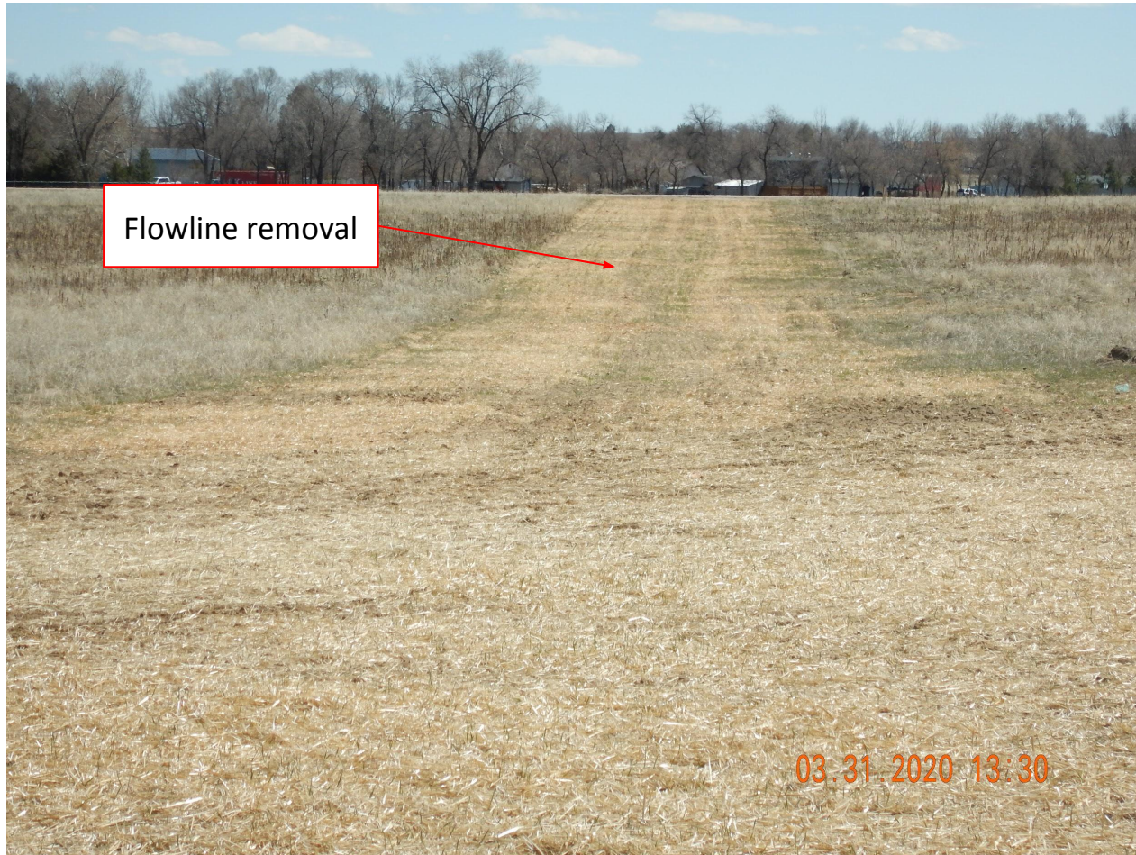
Photo 2. Photo taken from the well location, facing Southeast. Photo illustrates the flowline removal area.