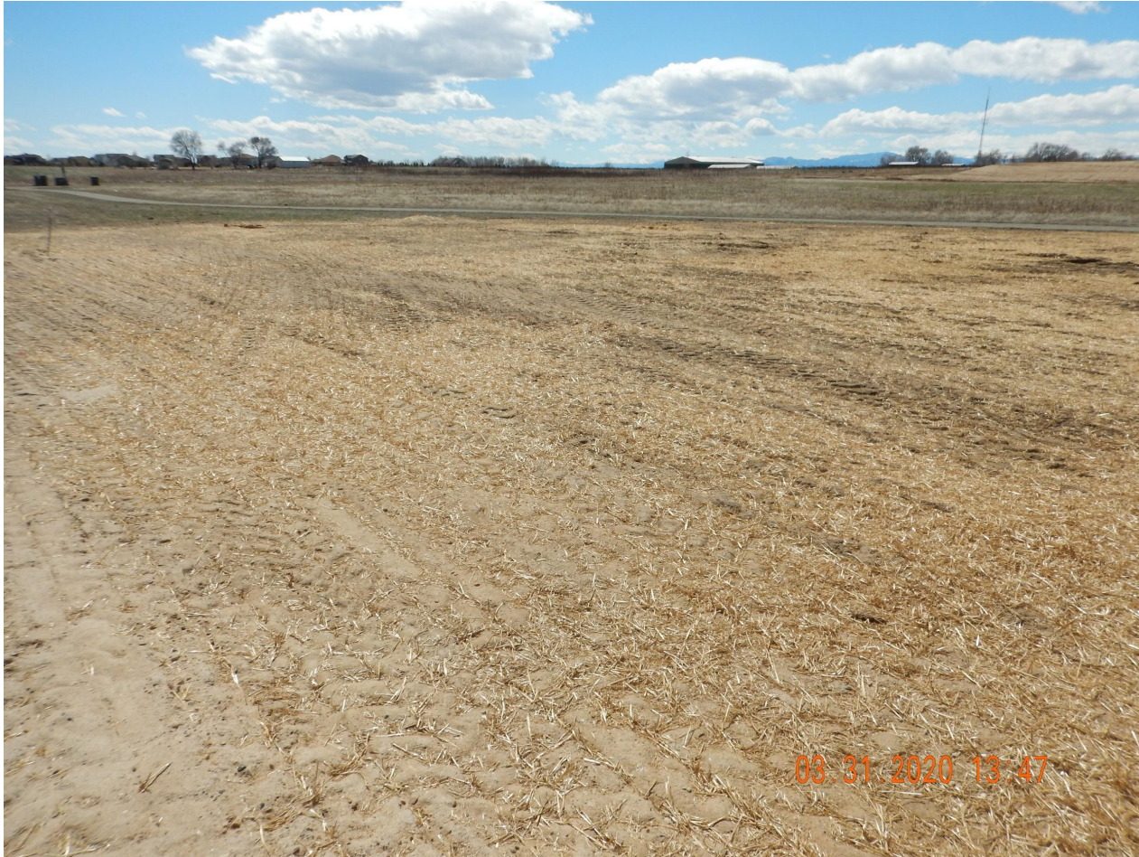
Photo 4. Photo taken from the associated offsite tank battery location, facing South. See comments under Photo 1.