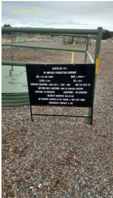
Photo of first corrective action completed

Completed work description Corrective Action 1