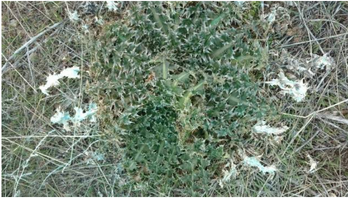
Completed work description of corrective action 3 Photo of fourth corrective action completed